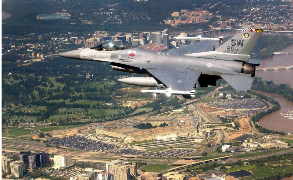
NORAD F-16 aircraft flies over the Pentagon in NOBLE EAGLE mission defending the homeland after 9/11.

Operation Noble Eagle response has become institutionalized into daily plans and NORAD exercises through which the command ensures its capability to respond rapidly to airborne threats. USAF units of NORAD have also assumed the mission of the integrated air defense of the National Capital Region, providing ongoing protection for Washington, D.C. Also, as required, NORAD forces have played a critical role in air defense support for National Special Security Events, such as air protection for the NASA shuttle launches, G8 summit meetings, and even Superbowl football events.