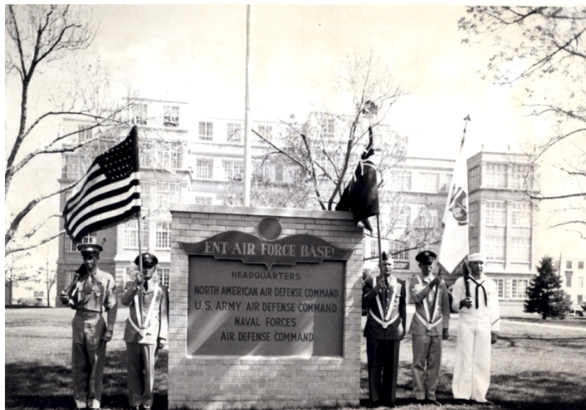
Headquarters, North American Defense Command, Ent AFB, Colorado Springs, CO.

With the beginning of the Cold War, American defense experts and political leaders began planning and implementing a defensive air shield, which they believed was necessary to defend against a possible attack by long-range, manned Soviet bombers. By the time of its creation in 1947, as a separate service, it was widely acknowledged the Air Force would be the center point of this defensive effort. Under the auspices of the Air Defense Command (ADC), first created in 1948, and reconstituted in 1951 at Ent AFB, Colorado, subordinate Air Force commands were given responsibility to protect the various regions of the United States. By 1954, as concerns about Soviet capabilities became more grave, a multi-service unified command was created, involving Naval, Army, and Air Force units—the Continental Air Defense Command (CONAD). Air Force leaders, most notably Generals Benjamin Chidlaw and Earle Partridge, guided the planning and programs during the mid 1950s. The Air Force provided the interceptor aircraft and planned the upgrades needed over the years. The Air Force also developed and operated the extensive early warning radar sites and systems which acted as “trip wire” against air attack. The advance warning systems and communication requirements to provide the alert time needed, as well as command and control of forces, became primarily an Air Force contribution, a trend which continued into the future as the nation’s aerospace defense matured.