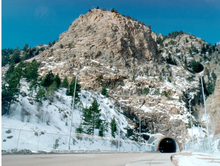
Cheyenne Mountain entrance, c. 1990s

Another example of NORAD's continuing adaptability also came in 2006. In NORAD's fifty-year history, perhaps the most notable symbol of the command has been the Cheyenne Mountain Operations Center (CMOC), often referred to as simply "Cheyenne Mountain." This vast bunker complex, which became fully operational in 1966, sat more than 1500 feet underground and consisted of fifteen buildings which comprised the central collection and coordination facility for NORAD's global-sensor systems. In early 2006, after studies and reviews, the NORAD and USNORTHCOM commander, decided, because of the changing nature of the threat in a post-9/11 world and because of gained efficiencies in monitoring the warning networks, the CMOC surveillance and warning of attack command centers could be relocated into a dual- purpose command center located at NORAD and USNORTHCOM headquarters on Peterson AFB. Cheyenne Mountain would become an alternate command center rather than be maintained on a 24/7 basis. The NORAD and USNORTHCOM Command Center at Peterson would become the official surveillance center for both commands, designed to give the commander and the Canadian and US leadership an accurate picture of any aerospace and other domain homeland threat.