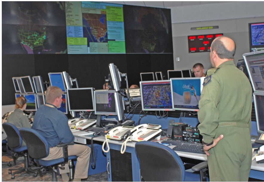
The NORAD and USNORTHCOM Command Center, May 2008.

defense and political leaders have therefore maintained the conviction that, for the foreseeable future, their common defense was best guaranteed by continued mutual cooperation.