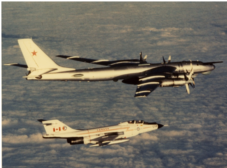
Canadian CF-101 Voodoo intercepts Russian TU-95 Bear Bomber flying near the North American airspace buffer zone.

Within one year of its establishment, NORAD began the process of adapting its missions and functions to “a new and more dangerous threat.” During the 1960s and 1970s, the USSR focused on creating intercontinental and sea-launched ballistic missiles and developed an anti-satellite capability. The northern radar-warning networks could, as one observer expressed it, “. . . not only [be] outflanked but literally jumped over.” In response, the USAF built a space-surveillance and missile-warning system to provide worldwide space detection and tracking and to classify activity and objects in space. When these systems became operational during the early 1960s, they came under the control of the NORAD.