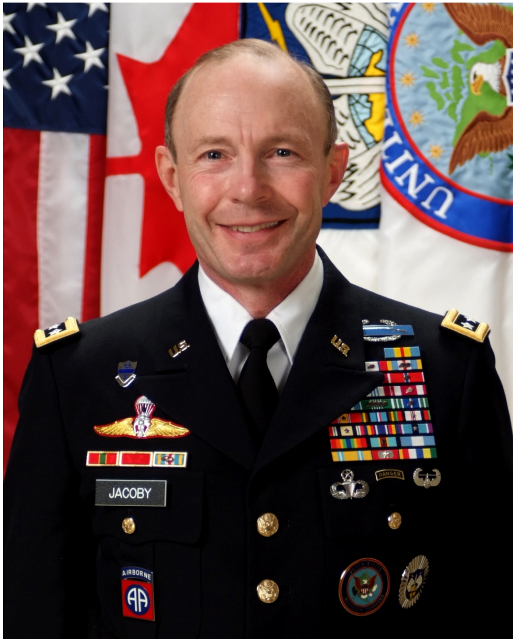
General Charles H. Jacoby, Jr. Commander, North American Aerospace Defense Command 3 August 2011 - Present