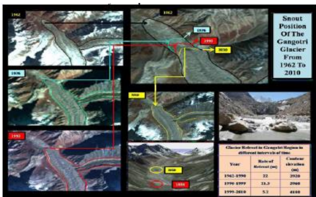
Fig 3: Decadal change analysis using satellite and panchromatic imagery datasets