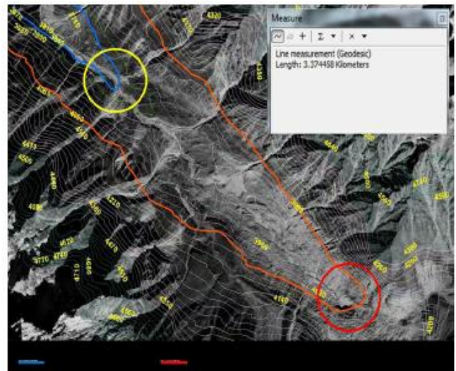
Fig 1: Contours at 30 m resolution generated from ASTER and overlay on Cartosat DEM and Panchromatic image between the years 1866 and 2011 overlaying on Cartosat DEM (Source of ground photograph)