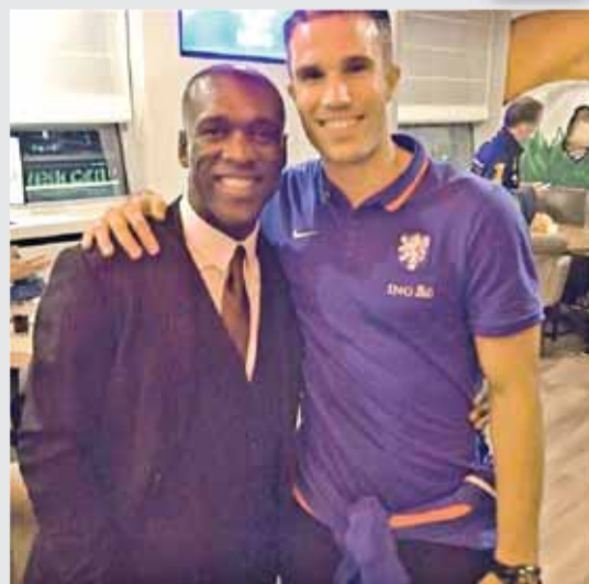
robinvanpersie Good luck Clarence Seedorf with the Laureus All Stars vs Real Madrid Legends tomorrow in the Kick Off For Good Charity Match @ The AFAS stadium in Alkmaar.