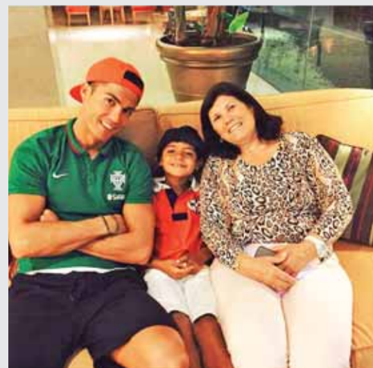
cristiano Love you both