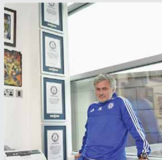
chelseafcJose Mourinho has had his name entered into the 2016 version of the Guinness Book of Records! Full story on chelseafc.com #CFC #Chelsea