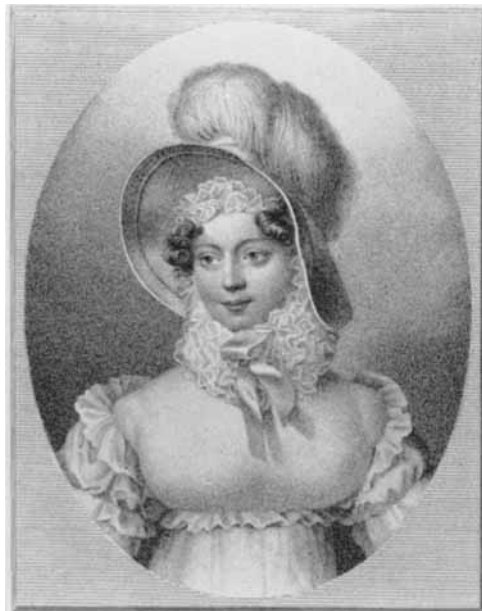
The Grand Duchess Maria Pavlovna

Now the intellectual fame of Saxe-Weimar had spread rapidly around Europe and attracted a flow of visitors, eager to partake in so much that was new and progressive. They came from all over the continent and among them was the Grand Duchess Maria Pavlovna from Russia. She was a daughter of the Czar Paul I and was married to Karl August's son; two of her brothers became the Czars