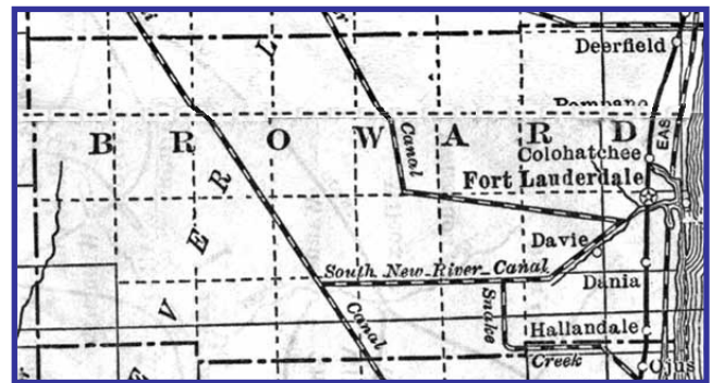
U.S. Railroad Administration Map, 1920

The 1920 Census divided Broward into six precincts (precursors to census tracts), which included incorporated and unincorporated areas. Fort Lauderdale was the most populous precinct.