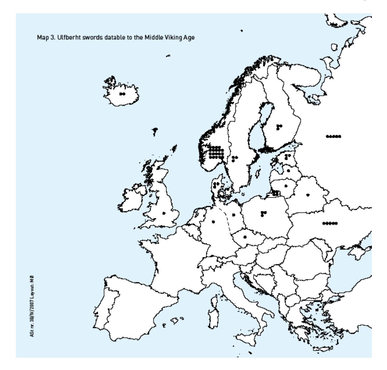
Map 3. Ulfberht swords datable to the Middle Viking Age. Constructed by Mona Ødegården. © Anne Stalsberg.

Heiko Steuer has suggested that probably not more than 1 per mille of the original number of objects has been discovered (Steuer 1999:408). On this basis the number of Vlfberht blades in pagan Europe is huge, while it is unrealistically small in the Frankish Realm. It is hard to believe that the Franks exported/smuggeled such a part of their production of Vlfberht blades to their pagan enemies (discussion vide infra ). The Christian burial rules explain the low number in the Frankish Realm.