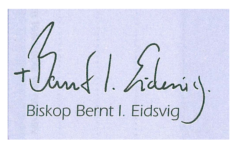
Fig. 5. The signature of the Right Reverend Roman Catholic Bishop of Oslo. Published with the Right Reverend 's permission.

This is most important information, since bishops and abbots were also warlords who waged war, and not least because weapons, from throwing machines for stone missiles to lances and swords, were produced at the episcopal seats and even more in the large abbeys (Verhulst 2002:78-84). Blacksmiths living on Abbey or aristocraticy lands, could be obliged to pay land rent with lances. Numerous abbeys produced weapons: St. Gallen, Lorsch, Fulda, Corbie, St. Riquier, St. Quentin, Bobbio, Vincenzo al Volherno, and others (Verhulst 2002:78-79). I am not saying that Vlfberht was a bishop or an abbot, not until his title and name have been found in contemporary sources (preferably in connexion with weapon priduction!), but the cross indicates a position in ecclessiastical or monastic hierarchy.