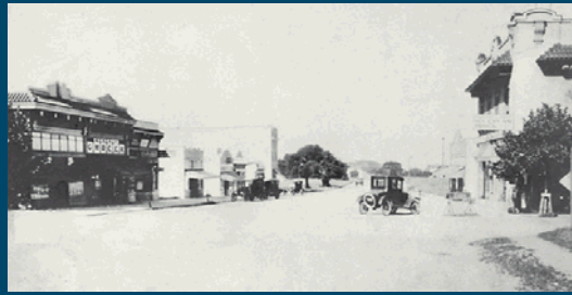
Main Street Los Altos 1920

LOS ALTOS HISTORIC WALKING TOUR UPDATED BY: