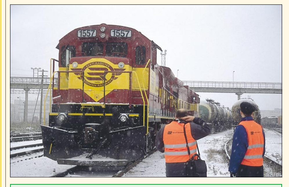
Above: GE locos 1557 and 1518 in multiple are uncoupled from a 4700 tonne oil train at Muuga as the snow falls heavily on 8 November 2002. Sakari Salo

The line between Tallinn and Narva has recently been upgraded by building a second track between Oru and Vaivara. During 2003 loops on the Tapa–Narva line will be