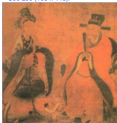
11.4. King Kongmin and Mongol Queen