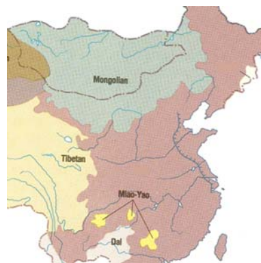
11.2. Qidan-Xianbei Depicted as the Mongols. Blunden and Elvin (1998: 18)

Mote (1999: 59) notes: “The Mongols effectively eliminated by absorption half or more of the tribal peoples named in the Liao records.”