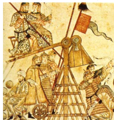
11.3. The catapult similar to the one used by the Mongols.