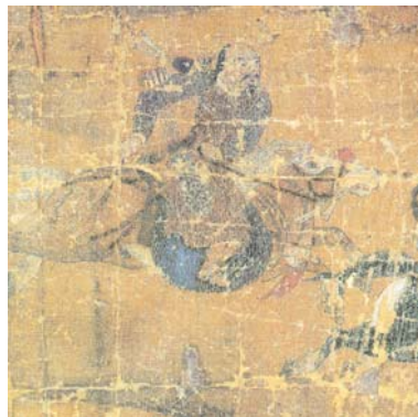
11.5. King Kong-min hunting

36 高麗史 卷二十五 元宗 庚申元年 [1260] 皇弟適在襄陽班師北上 王...奉幣迎謁[於梁楚之地]..皇弟驚喜曰 高麗萬里之國 自唐太宗親征而不能服 今其世子 自來歸我 此天意也