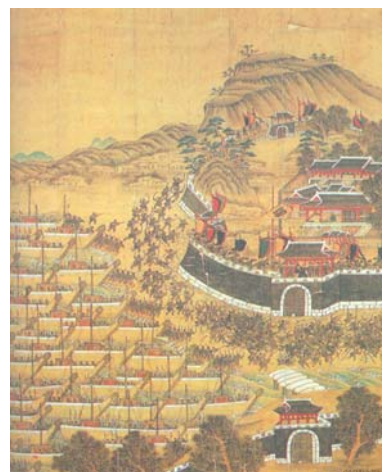
11.6. Japanese Invasion of Korea

terrible cost to all three countries, had not domestic turmoil in Japan, coupled with effective disruption of Japanese supply lines by the Korean navy, led to the recall of Japanese troops...in 1598."