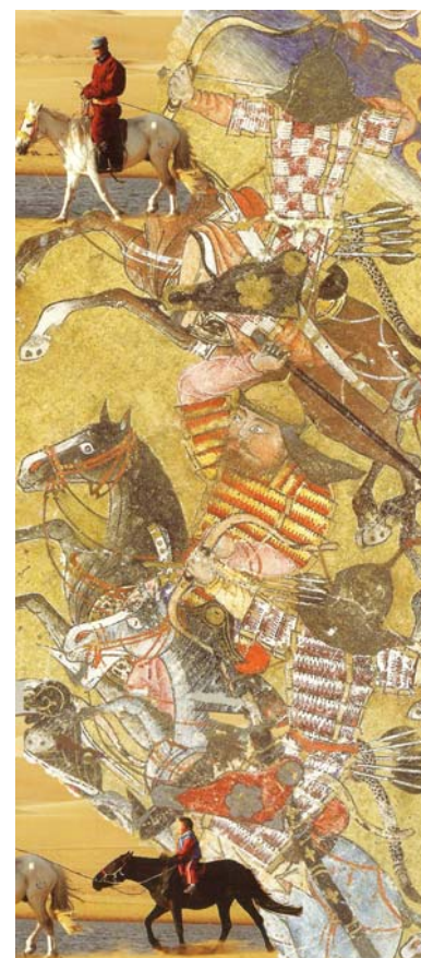
Mongol horses and Chinggis Khan's Cavalry