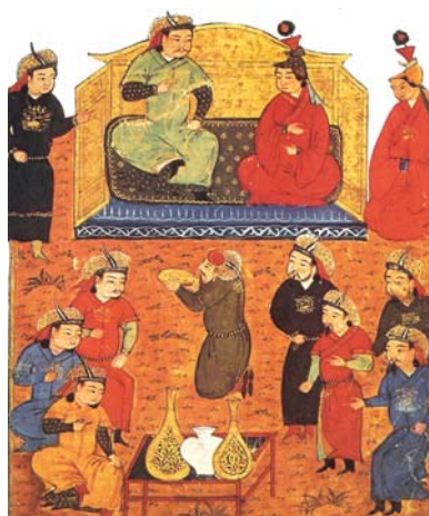
11.7. Arghun (r.1284-91), the grandson of Hülegü, seated alongside his wife.