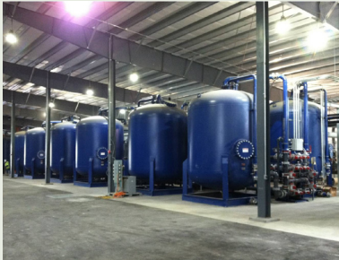
WATER TREATED Completed