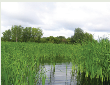
HABITAT / PLANTS / WETLANDS 7,500 plants, shrubs, and trees planted.