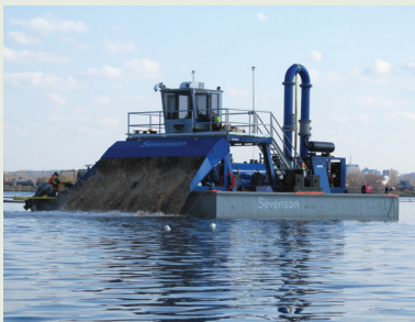
CAPPING 140,000 cubic yards of capping material placed.