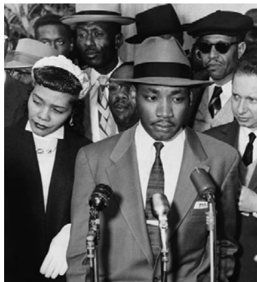
Martin Luther King, Jr., elected 1966.

Current affiliation: University of Washington