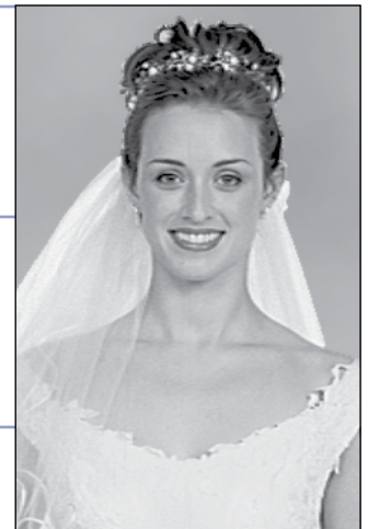
1 column wide (1.64 inches) 2½ inches deep $46.38