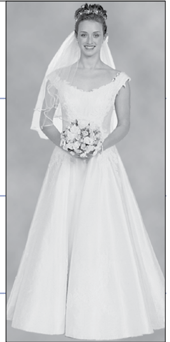
1 column wide (1.64 inches) 3½ inches deep $64.93