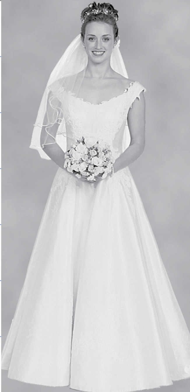
2 columns wide (3.40 inches) 7 inches deep $259.70