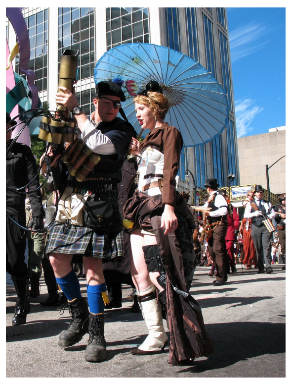
Figure 4: Steampunk cosplay at the 2010 Dragon*Con parade.

It seems very unlikely that modifying one's laptop will ever surpass watching football as a national pastime. It is equally unlikely that Philip Reeve or Abney Park will sell more books or CDs than Jonathan Franzen or U2, respectively. Yet steampunk appears even more firmly entrenched as a subculture than when we began work on this special issue in the autumn of 2008. Our own anecdotal experience observing the number of people engaged in steampunk cosplay at the annual Dragon*Con convention in Atlanta (see Figure 4) confirms that steampunk appeals to an increasing number of people each year.