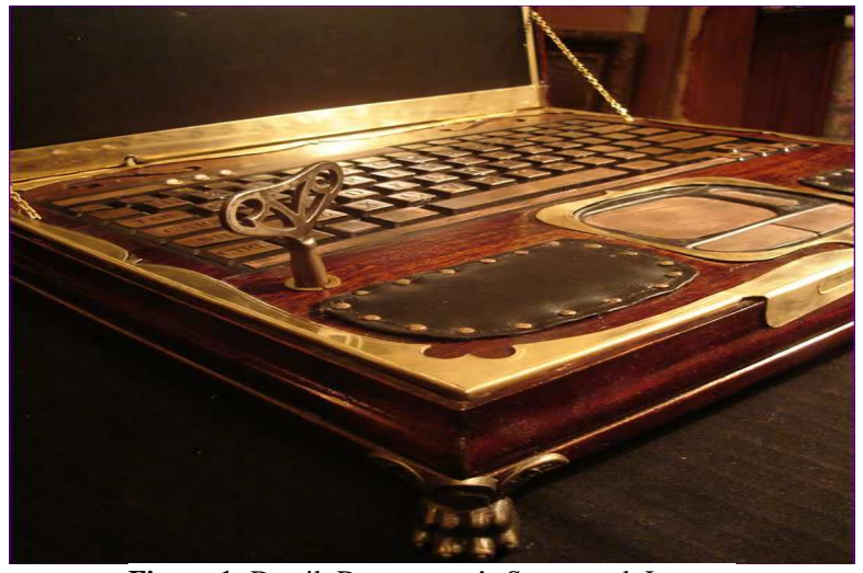
Figure 1: Detail, Datamancer's Steampunk Laptop. © Richard Nagy , reprinted with kind permission of the artist.

Steampunk is premised on these temporal connections, especially in visible manifestations. Steampunk asks us, perhaps via its material culture even more than through its fictional instantiations, to consider the apparent disjunction of a turn-key starter and a laptop computer (see Figure 1).