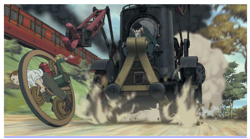
Figure 3: Frame from Steamboy , dir. Katsuhiro Otomo. © 2004 Katsuhiro Otomo , Toho , and Sony Pictures Entertainment . Reprinted in accordance with fair dealing guidelines.

powered vehicle's technology being tested against (and visually compared to) the devices of his pursuers and of the train to whose tracks he runs parallel (see Figure 3).