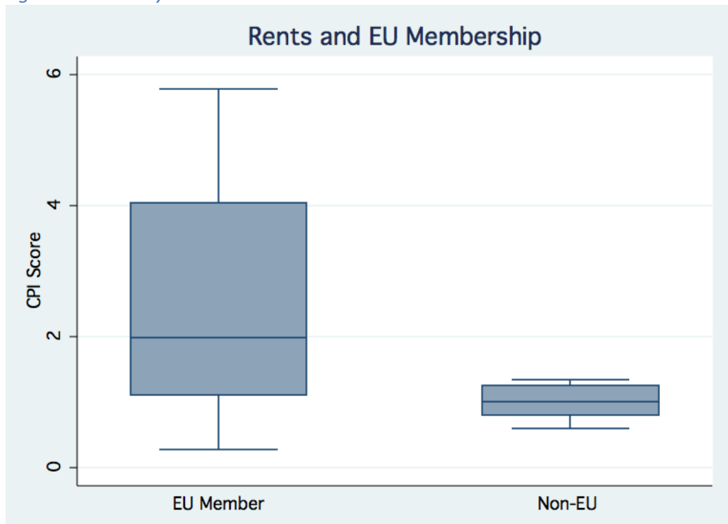
Figure 1.03: Policy-Coordination and Rent Extraction

As Figure 1.03 shows, as a box-plot of the level of rents by high-income democracies that are/are not EU member states, EU membership among these countries (captured by a dummy variable that takes the value of 1 if an OECD state is an EU member) is associated with more rent extraction. Of course, because self-selection into the EU is restricted by geography and a host of other factors<sup>26</sup>, these bivariate results have to be treated with caution. Still, the fact that the median non-EU state had a lower (inverted) CPI score than even the best performing EU state, suggests that a robust association, as anticipated by the model, is consistent with the empirical evidence.