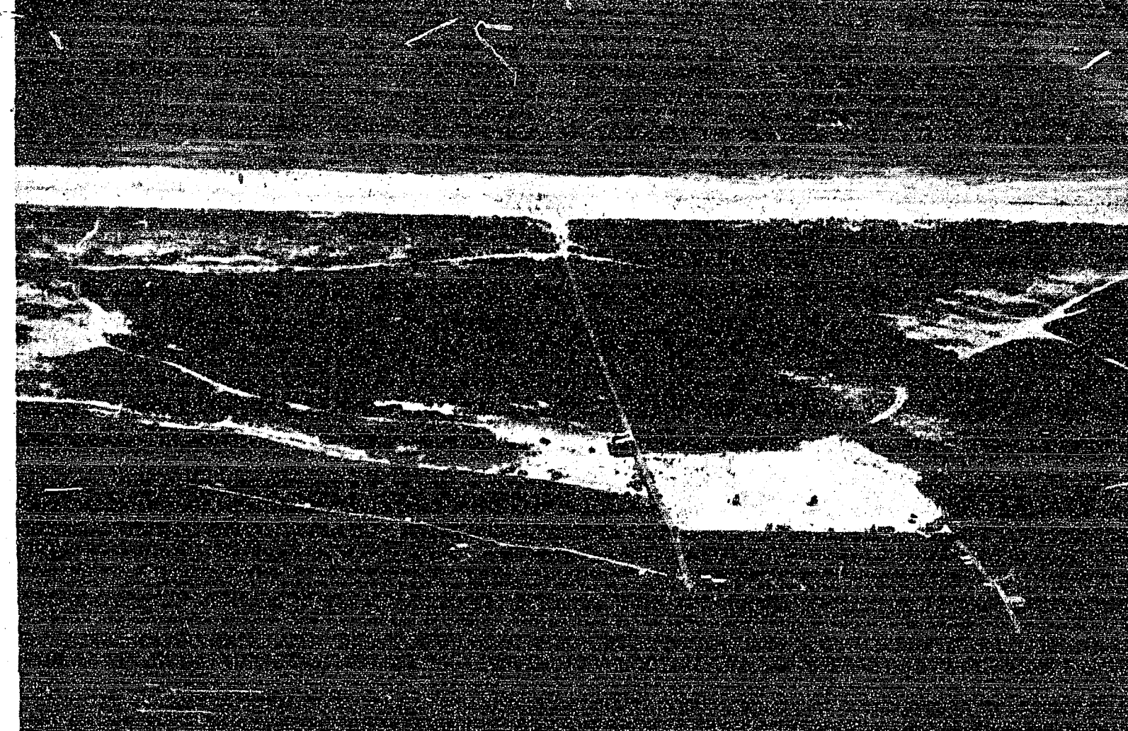
GREAT GUN BEACH, seen in this recent aerial view, offers town residents a combination of bay and ocean activity. Bay-front docking facilities offer the watergoing resident an opportunity to tie up for a day, a weekend or longer; a boardwalk offers easy access to swimming or angling in the surf and for those so inclined, walks along the dunes offer an escape into the wilds of nature. Improvements at this town-owned facility have been in the planning stage for several weeks and are currently being implemented. A new well and water pump was installed early last week, waste receptacle facilities have been in place on the dock area for the past several weeks, with the recep-