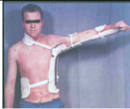
Splinting to maintain position of function