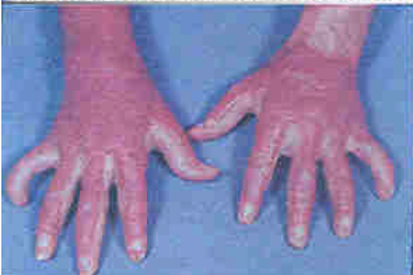
Healed deep burn with hypertrophic scar.

Continued scar deposition in the re-epithelialized wound results in a raised, hyper-pruritic wound that produces functional impairment due to rigidity and pain as well as a severe cosmetic abnormality. Severe discomfort results. Pain with any