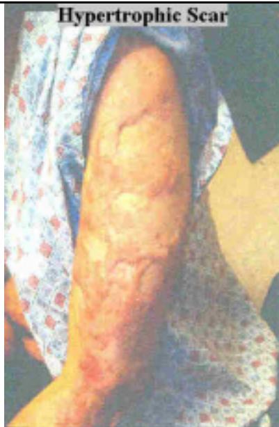
Red and Raised