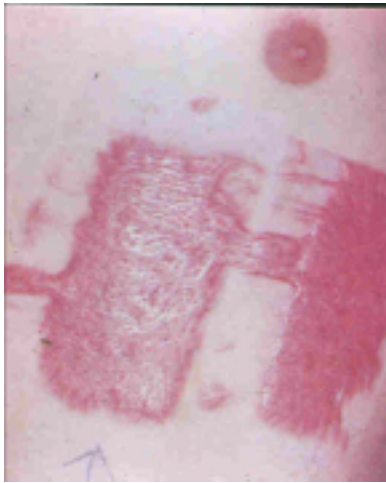
Delayed healing of donor site led to scar