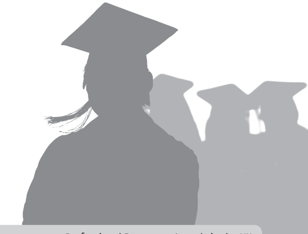
Professional Doctorate Awards in the UK