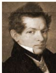
Nikolai Ivanovich Lobachevski

up with the list of 21 axioms. Hilbert not only explained these axioms but proposed that they would be the basis for the further development of the subject. Thus Hilbert provided geometry with a formal axiomatic setting. He developed geometry from a much more rigorous set of axioms than those of Euclid. Hilbert's results were published in his classic work Grundlagen der Geometrie ( The Foundations of Geometry , 1899). The book was considered so important that nine editions came out in the course of sixty years of its publication. This was part of Hilbert's attempt towards establishing a postulational basis for mathematics as a whole. Since Hilbert's first attempt the axiomatic approach has remained a permanent feature of mathematics.