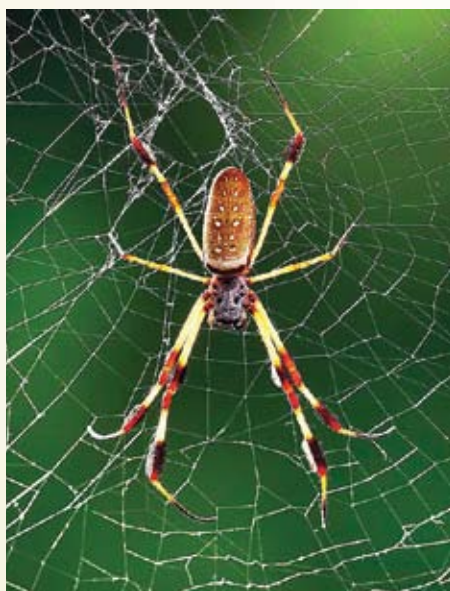
Nephila clavipes , the golden orb spider, in its web

The spider webs are made from multiple silk types, but two types, known as viscid silk and dragline silk are most critical to the integrity of the web. Viscid silk is stretchy, wet and sticky, and it is the silk that winds out in increasing spirals from the web centre. Its primary function is to capture prey. Dragline silk is composed of a suite of proteins with a unique molecular structure