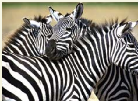
Zebras stripes are designed to keep away blood-sucking horseflies.

The familiar term “zebra crossings” that mark pedestrian crossings on roads comes from the characteristic black-and-white stripes on the coat of the zebra. But why do the zebra have stripes? The striped appearance of zebras has provoked much speculation about its function and why the pattern has evolved, but experimental evidence has been scarce. Now a team of researchers from Hungary and Sweden led by Gábor Horváth of Eötvös