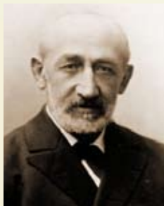
Paul Albert Gordan

be extended to systems with more than two variables, as computational difficulties became insurmountable. Hilbert after failing to extend Gordan's approach developed an altogether new approach. Hilbert's approach was highly abstract. Hilbert submitted the paper proving the finite basis theorem to Mathematische Annalen . The paper was referred to Gordan, being the expert on invariant theory for the journal, for reviewing. Gordan failed to recognise the importance of Hilbert's work. Thus, he sent his comments to the editor of the journal, Felix Christian Klein (1849-1925) expressing his apprehension on