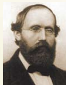
Friedrich Bernhard Riemann

Hilbert compiled the list of 23 unsolved problems which set the course of 20th century mathematical research. The list is regarded as the most successful and deeply considered compilation ever to be produced by an individual mathematician. He launched the problem set in a talk presented at the International Congress of Mathematics held in Paris in 1900. The title of his talk was "The Problems of Mathematics." At the Congress he described fewer than half the problems and in his subsequent publication he extended the list up to 23. The list later became known as '23 Problems of Hilbert'.