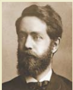
Felix Christian Klein

the suitability of the paper for publication in the journal. Hilbert had demanded that no changes be made in the paper. Klein realised the significance of Hilbert's paper and he published it without making any changes.