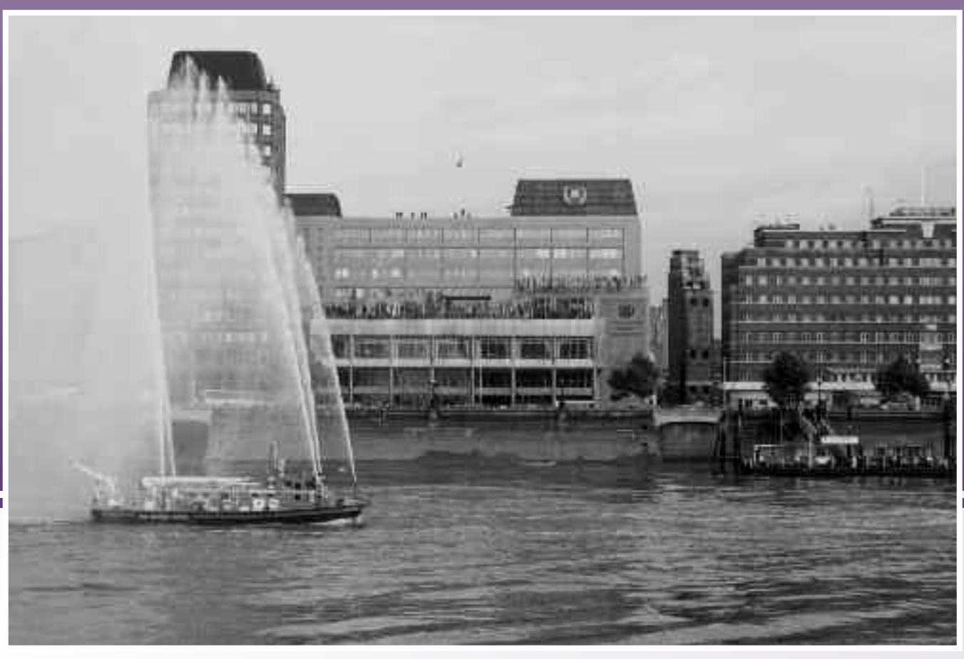
A view from the river of the celebrations to mark the opening of IMO's new Headquarters building, displaying the flags of all the Member States

for the ecological and the economic well being of the planet. The problem was first raised at IMO in 1988. Guidelines to address the problem were adopted in 1997. Subsequently, further technical advances were sought, leading eventually to the adoption, in February 2004, of the International Convention for the Control and Management of Ships' Ballast Water and Sediments - a new international instrument to prevent the potentially devastating effects of the spread of harmful aquatic organisms carried by ships' ballast water.