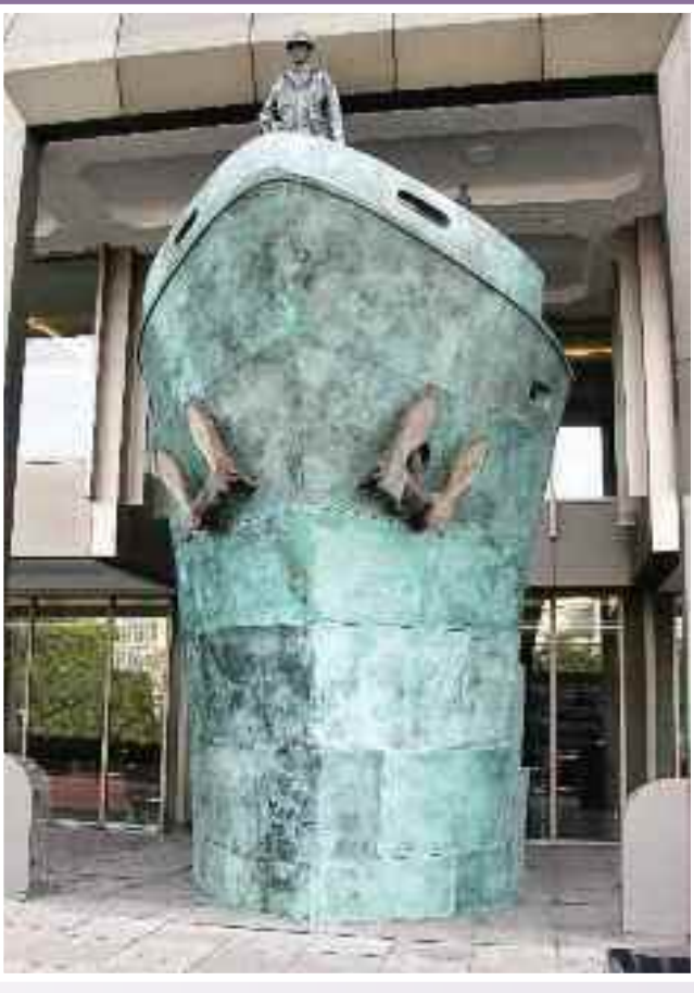
Front elevation of Seafarers' Memorial, situated next to the entrance of the IMO building, which had to be modified to accommodate the new sculpture

Then, in 1974, IMO adopted the Athens Convention relating to the Carriage of Passengers and their Luggage by Sea, which declares the carrier liable for damage or loss suffered by passengers if the incident is due to the fault or the neglect of the carrier.