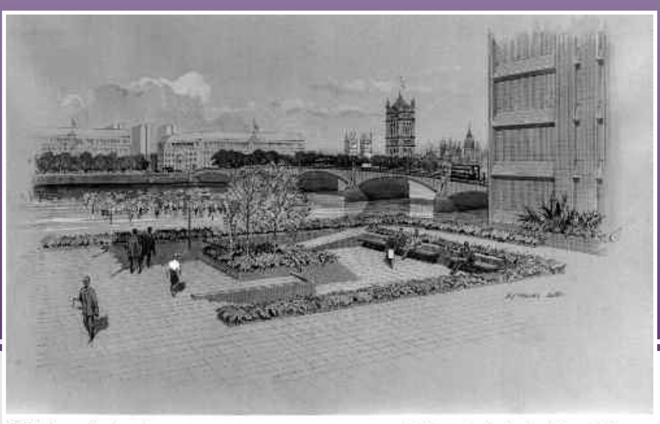
Sketch view over River from offices