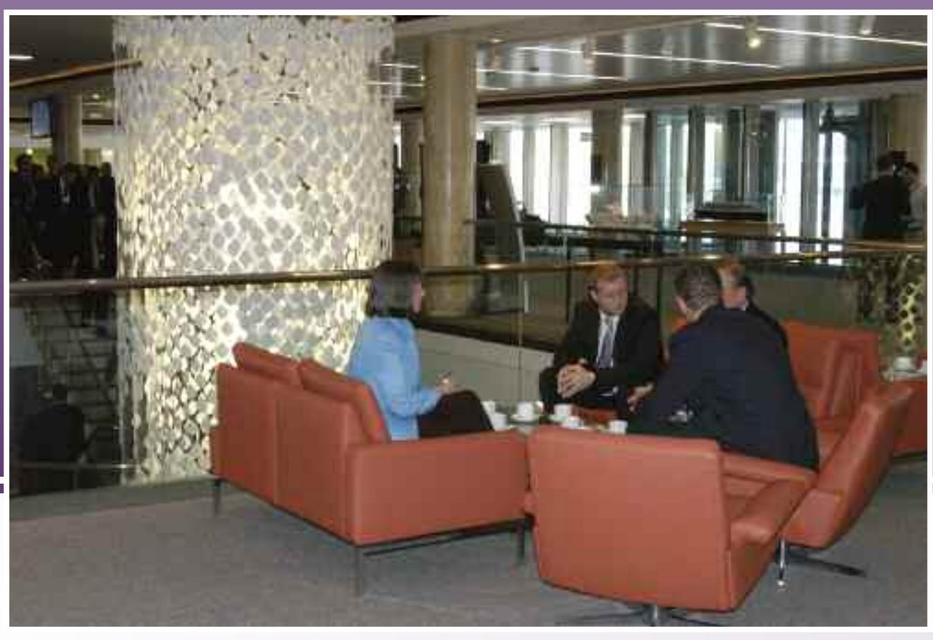
The new-look delegates' lounge features comfortable, informal seating areas

the leading maritime nations, they tended to create their own standards with regard to vessel construction, safety, manning and so on. But, in 1948, the new spirit of global unity that was in the air and the first glimpses of a new world order on the horizon combined to cause a number of far-sighted nations to draw up the blueprint for an international organization that would develop standards for shipping – for adoption and universal implementation throughout the entire industry. For it was becoming generally accepted that a situation in which each shipping nation had its own maritime laws was counterproductive in ensuring safety in shipping operations worldwide. Not only were standards different, but some were far higher than others. Conscientious safety-minded shipowners were at an economic disadvantage vis-à-vis their competitors who spent relatively little money on safety, and this was a threat to any serious attempt to improve safety at sea and to international seaborne trade as a whole.