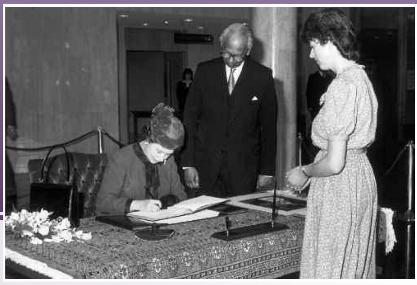
The Queen signs the visitors' book

ship design; use of alternative fuels; a \mathrm{CO}_2 Design Index for new ships; external verification scheme for \mathrm{CO}_2 operational index; an Emissions Trading Scheme (ETS) and/or Clean Development Mechanism (CDM) and inclusion of a mandatory \mathrm{CO}_2 element in port infrastructure charging.