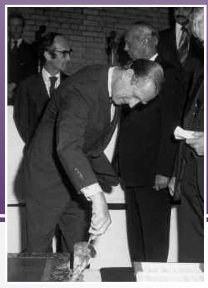
HRH The Duke of Edinburgh laying the foundation stone of the new Headquarters building (May 1979)

Although the prevention of pollution of the sea from the land is not IMO's responsibility, the Organization does carry out secretariat functions in respect of the Convention on the Prevention of Marine Pollution by Dumping of Wastes and Other Matter (London Convention). This Convention was adopted in 1972 at a conference held under the auspices of the United