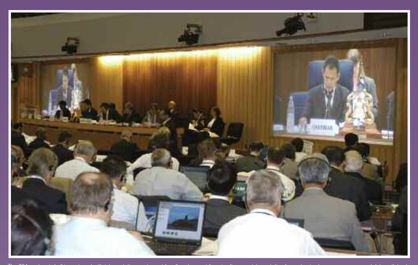
The 764-seat main hall is equipped with interpretation equipment for all seats, providing simultaneous interpretation for up to nine languages, power and data outlets at desktops for 644 delegates, audio-visual cameras and screens with full video-conferencing capability and a paging system