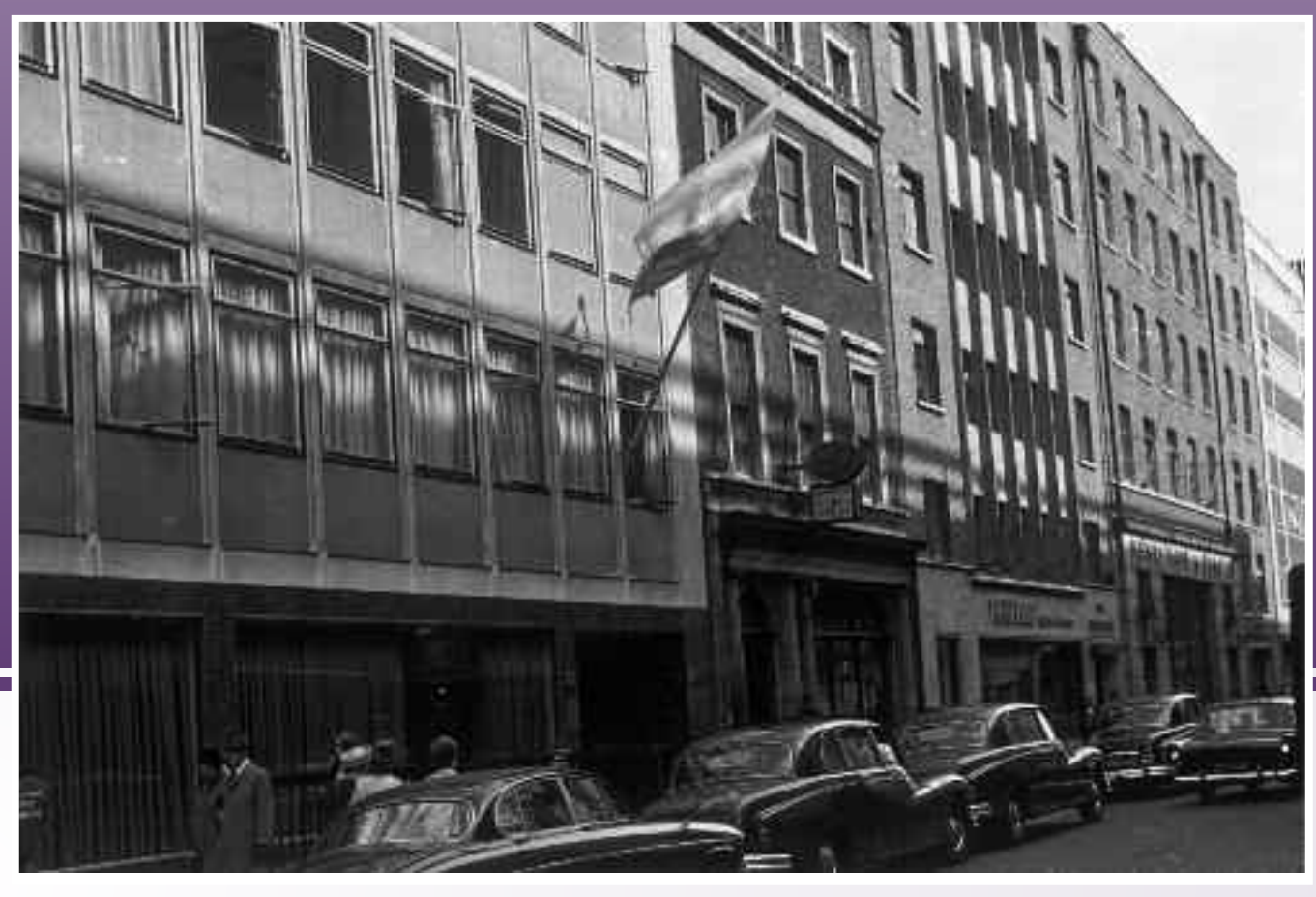
IMCO's first home was in Chancery Lane, London. The second was in 22 Berners Street, London (shown here), a building shared with the International Coffee Organization from the early 1960s to 1970

sometimes referred to as 'SOLAS, 1974, as amended'. Several new chapters have subsequently been added, for example, on Management for the Safe Operation of Ships; Safety Measures for High-speed Craft; Special measures to enhance maritime safety; special measures to enhance maritime security; and additional safety measures for bulk carriers.