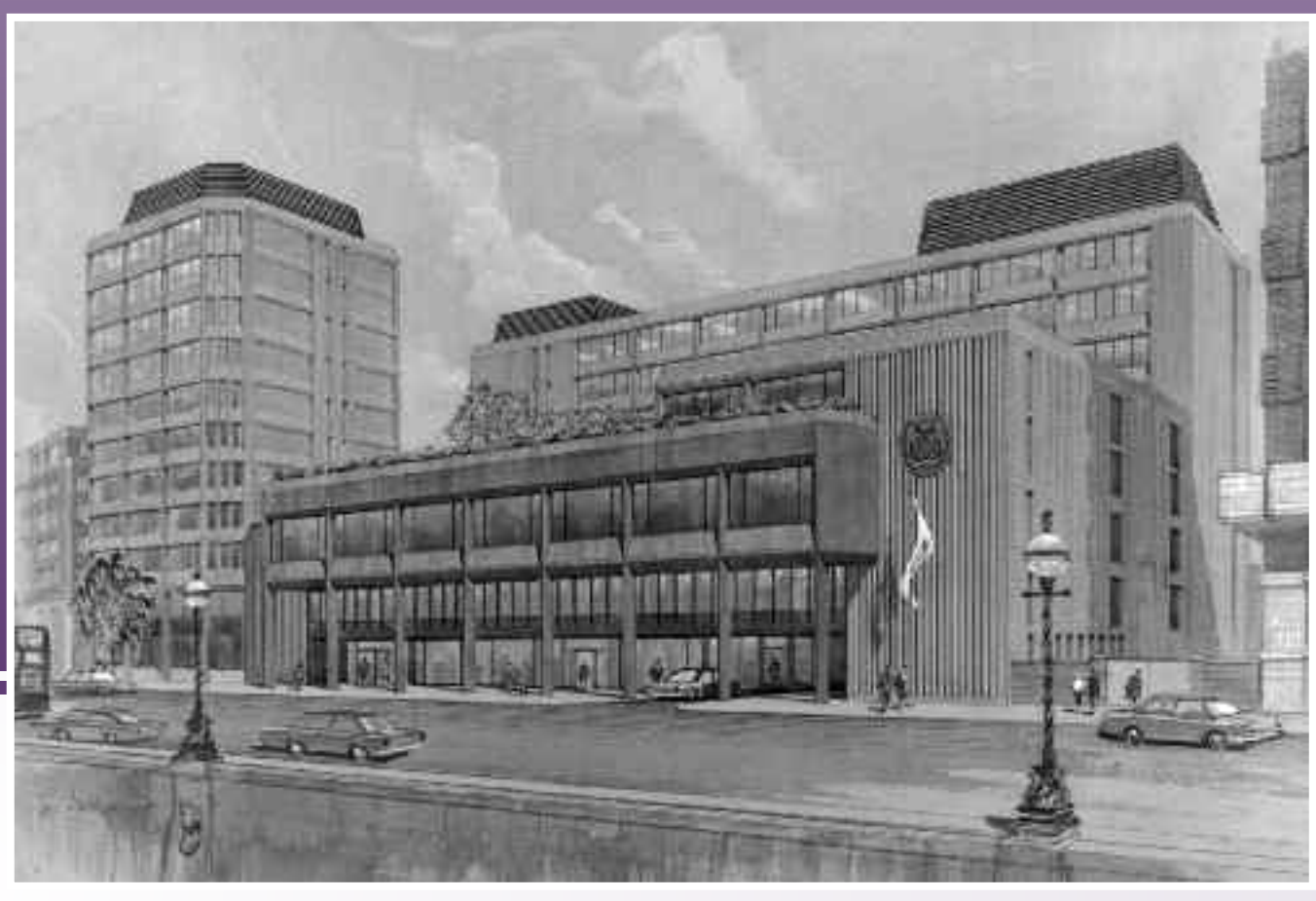
Contemporary artist's impression showing front elevation of the new Headquarters building

that time. The incident raised questions about measures to prevent oil pollution from ships and also exposed a number of deficiencies in the existing system for providing compensation following accidents at sea.