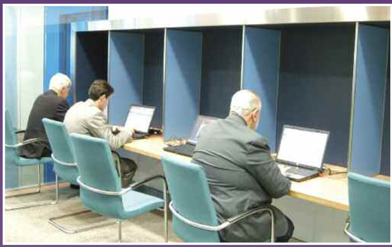
Business centres have been provided for delegates as part of the £62 million-plus refurbishment