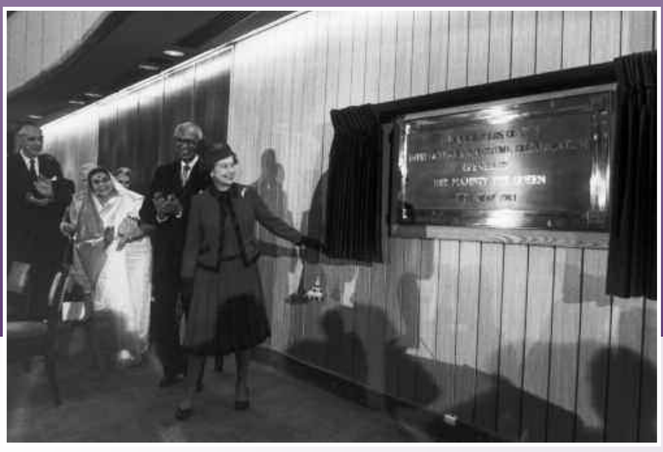
The Queen unveils the plaque to commemorate her visit

Emission Control Areas (SECAS) to be established with more stringent controls on sulphur emissions; prohibits deliberate emissions of ozone depleting substances, which include halons and chlorofluorocarbons (CFCs), and the incineration onboard ship of certain products, such as contaminated packaging materials and polychlorinated biphenyls (PCBs). It also sets limits on emissions of nitrogen oxides (NOx) from diesel engines. A mandatory NOx Technical Code, which defines how this shall be done, was also adopted.