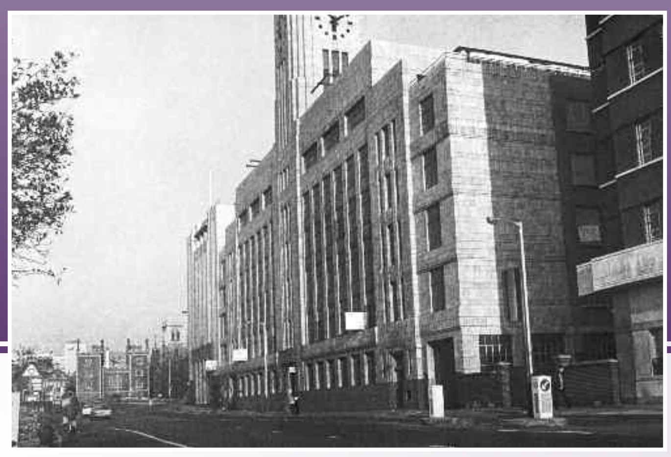
IMO moved to new Headquarters (opened in 1982) built on the site of this warehouse, formerly owned by the newspaper and magazine retail chain WH Smith

protection systems for the large atrium typical of cruise ships – and life-saving appliances and arrangements.