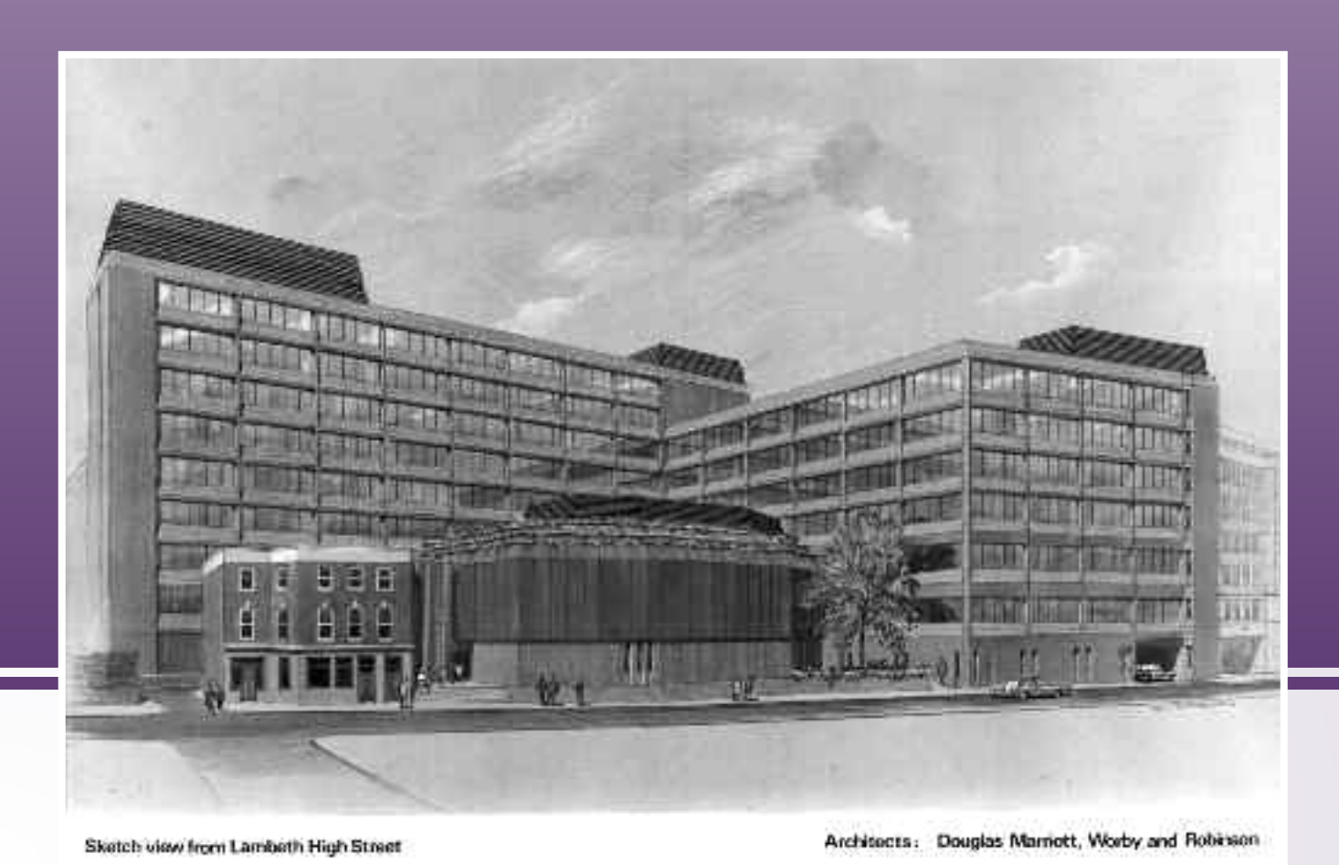
This contemporary artist's impression shows the proposed conference hall, the low structure in the centre of the building

in conjunction with the United Nations Industrial Development Organization (UNIDO) under the Global Environment Facility (GEF/UNEP) funded project "Combating living marine resources depletion and coastal areas degradation in the Guinea Current Large Marine Ecosystem (GCLME) through ecosystem-based regional actions".