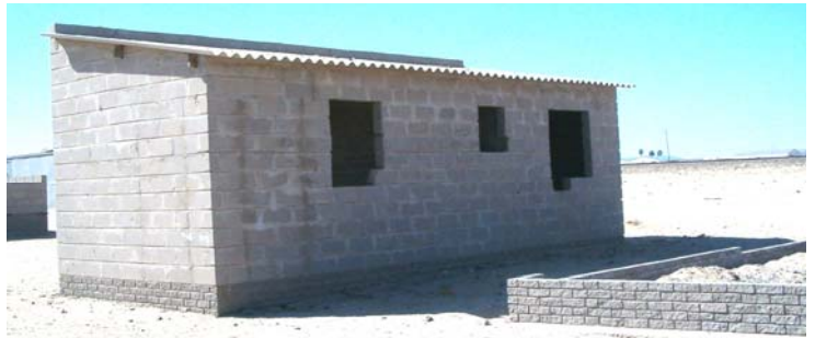
Home Sweet Home: An incomplete Build Together house

The provision of municipal services is a costly exercise and thus the installation of electrical services will be done in phases.