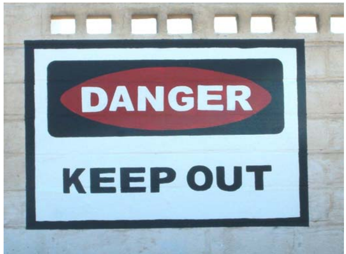
Awareness Campaign: Warning notices placed around Sewerage Plant

The Department of Engineering Services has arranged for a security guard to be on site during working hours with the main task to man the vehicular entrance, but it is not the solution as the site is very big and one guard will not be able to effectively guard the whole site against unlawful entrances. The cost amounts to N$135.00 per day or N$3 000.00 per month. During a Special Management Committee it was agreed that the entrance gate be closed all times and that staff should be alert not to allow any unauthorised person on the premises.