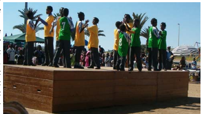
Its Ours: Energetic youth performing dramatic performances much to the delight of the crowd

The Governor requested parents and guardians to allow the children to run, jump, explore, share, chase, see, slide, ride, eat, walk, sit, smell, feel and belong whilst for the aged a park awakens and ignites the youth in them once again.