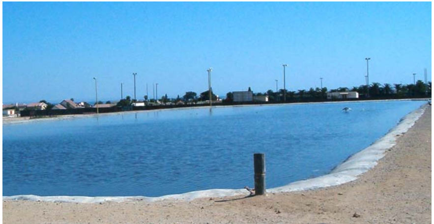
Oxidation Ponds: Where the unfortunate incident took place

On Friday 13 June 2008 a tragic and very unfortunate incident occurred at the Sewage Works when two young children drowned in the Oxidation Ponds at the Sewage Works. It is with sorrow that we have learnt about the loss of 2 young lives at our Sewerage Plant, Rudi Klaase 5 and Dino Swartbooi 6.