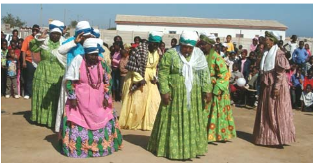
Remembering their heydays: A group of elders performing traditional dance during the official opening of the Mondesa Play Park

The event coincided with the fundraising activities of Festus !Gonteb, Vrede Rede and Hanganeni Primary Schools.