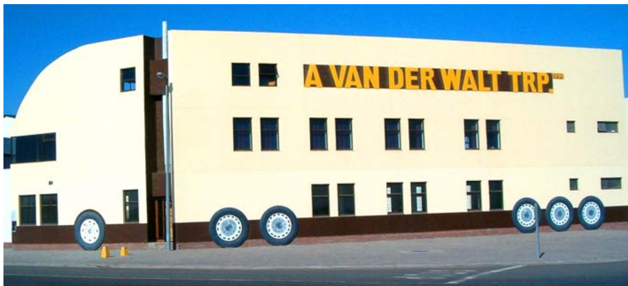
Architectural masterpiece: The A van der Walt Transport Offices in the Industrial Area

Swakopmund is regarded as the mecca of tourism in the SADC region and a prime holiday destination for Namibian and foreigners alike.