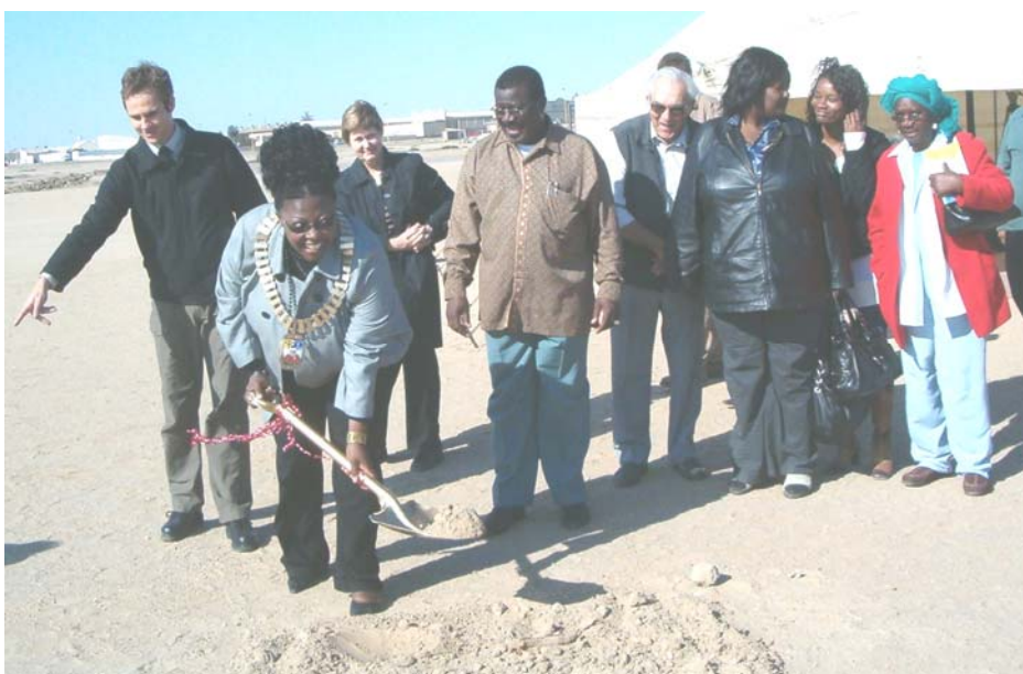
A Historic Occasion: The Mayor, Councillor G N Shitaleni at the ground breaking ceremony. In attendance is the Governor, Hon. S S Nuuyoma, Councillors and Officials

The New Municipal Office Complex will replace both the main Municipal Building constructed during 1907 as well as the Altes Ampsgericht building which was completed during 1906.