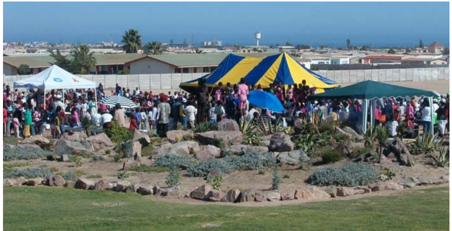
We witnessed it: A section of the crowd who attended the official opening of the Mondesa Play Park.

The Play Park which was constructed to the tune of N$200000.00 was designed and built internally by the Municipality of Swakopmund, including the landscaping of the area. This project has brought a renewed sense of community identity and