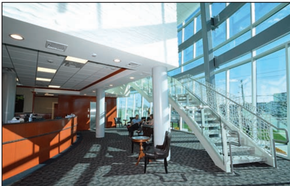
The Zwanger-Pesiri facility in Levittown, NY

to ensure the best outcomes for patients.