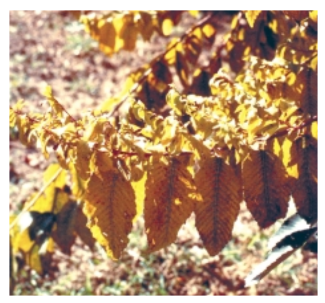
Figure 3. Symptoms of Elm yellows on U. villosa grown in Pisa, Italy.

fer from the results of DED. Yet in Europe, EY is tolerated by the populations of native elms, with only a few individuals showing symptoms of yellowing (Figure 3), witches' brooms (Figure 4), growth retardation, or a general decline (Mittempergher, 2000).