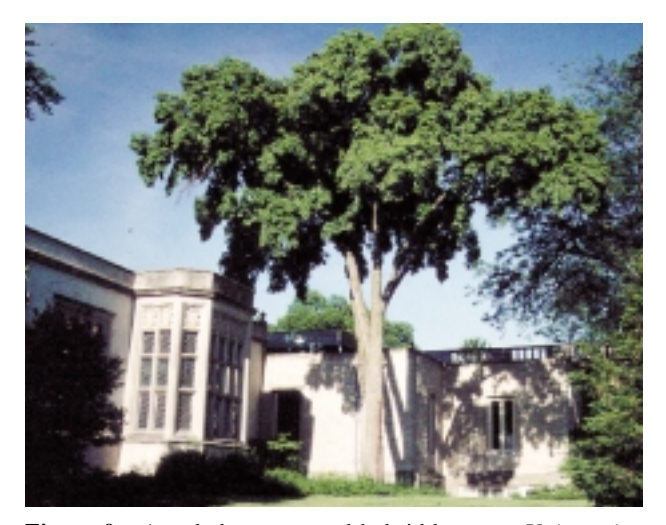
Figure 9. «Accolade», a natural hybrid between U. japonica and U. wilsoniana , is the first of several releases of the Morton Arboretum.

The breeding programme began in 1972 (Ware, 1992; Ware, 2000) with the finding of an outstanding tree resembling the American elm on the grounds of the Arboretum near the Thornhill Educational Center. The Thornhill elm was identified as a natural hybrid between U. japonica and U. wilsoniana , and was named «Accolade» (Figure 9). It became a parent of many of the resistant elm selections built up in the hybridisation activity of the Arboretum. Five hybrid clones have been named and released containing U. pumila and U. minor in their parentage in addition to the named U. japonica and U. wilsoniana . New crossings have been