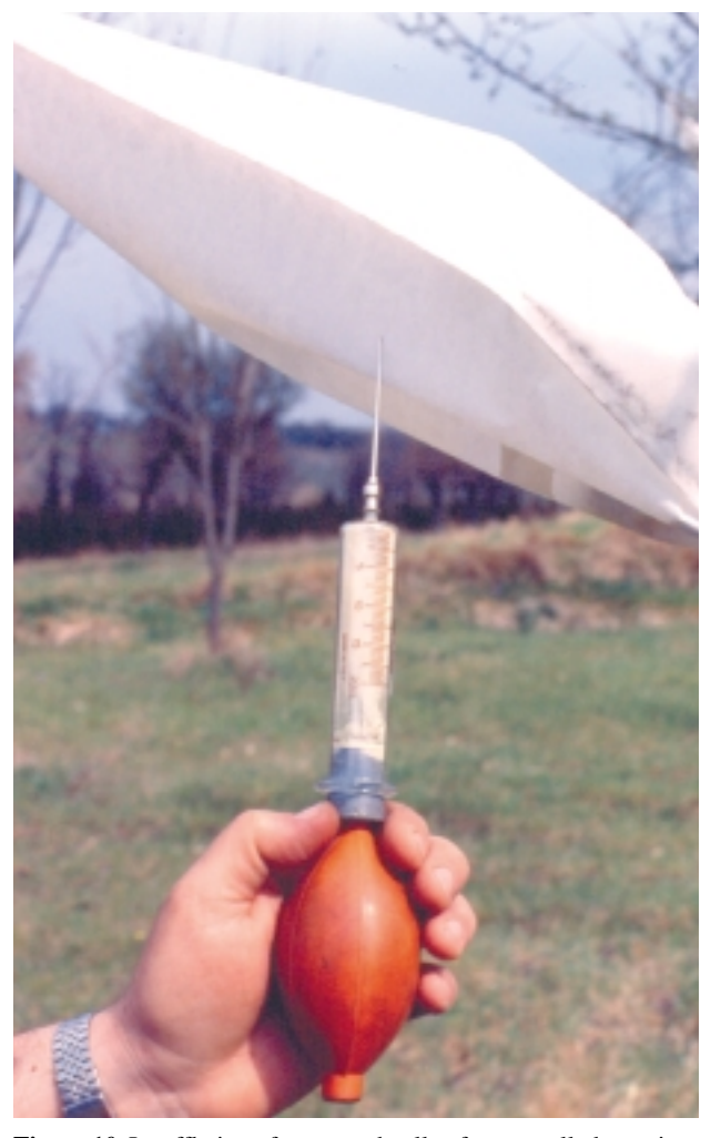
Figure 10. Insufflation of preserved pollen for controlled crossing.

Self-sterility is a common event in elms, a fact that makes it possible to effect crossings without recurring to emasculation, i.e. in the presence of self-pollination. But the phenomenon is not always complete in the different species, and varies from year to year and