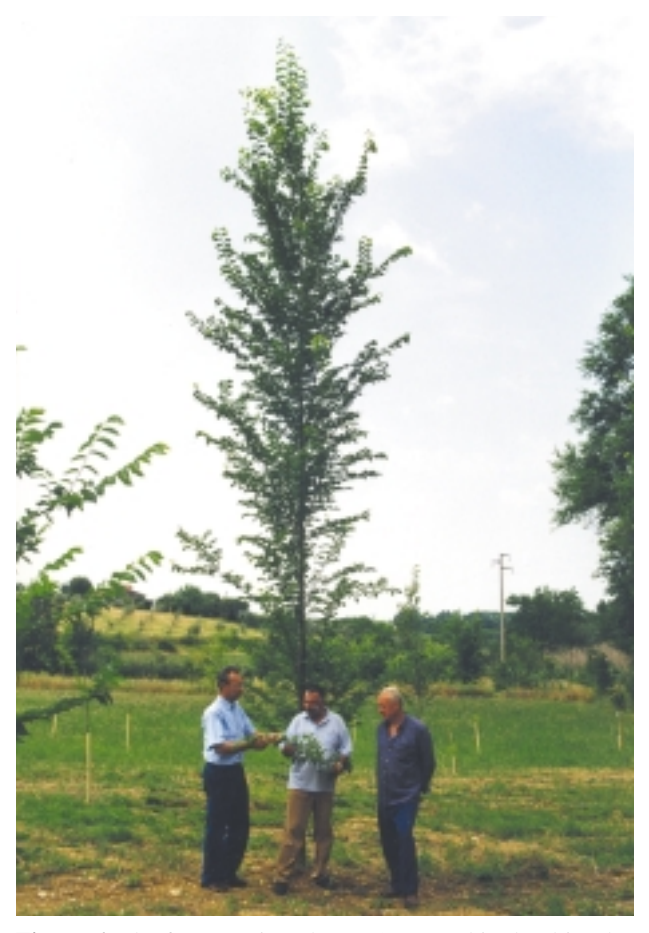
Figure 6. The fast growing clone «San Zanobi», bred in Florence, Italy, by crossing the Dutch clone «Plantyn» with U. pumila , gives hope to be grown also for timber production.

rience, the Chinese species U. laciniata (Trautv.) Mayr is so susceptible to leaf beetle that it is very difficult to raise it in central Italy without chemical control, whereas U. parvifolia Jacq. and U. wilsoniana Schneid., are scarcely damaged. The Institute in Flo-