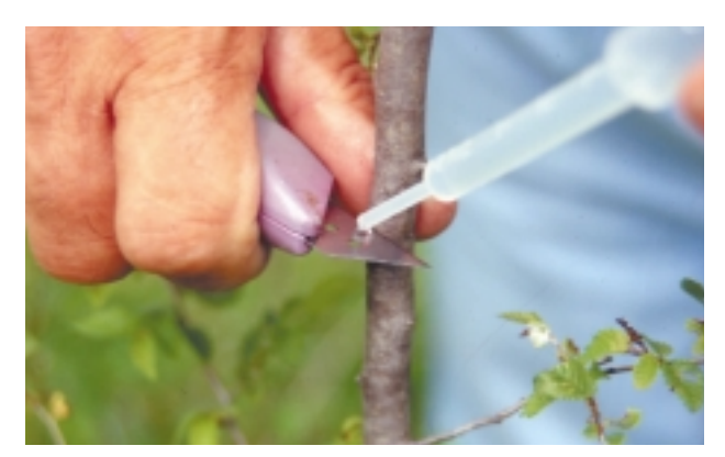
Figure 11. The Dutch slit inoculation technique.

lum directly into the large vessels of the lower trunk by cutting into the new sapwood and letting two drops of the conidium suspension, placed on the knife blade, be sucked into the rising sap, guarantees approximately 100% infection of the treated trees. For this reason, even it is an unnatural method remote to the infectional courts made by the bark beetle vectors, it has been adopted by European breeders and by the Forestry Commission in Great Britain. The latter has promoted fundamental studies on the genetics of the fungus.