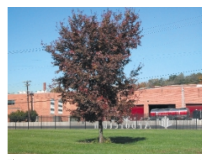
Figure 7. The clone «Frontier» (hybrid between U. minor and U. parvifolia ) is among the several selections released by the USDA programme.

the male and female parents, and their interactions influenced the expression of the disease symptoms (Townsend and Douglass, 1996), and that clones from within the same full-sib family differed significantly in their resistance to DED, as an effect of the heterozygosis of the parents and also of the existence of specific combining, or non additive, gene action. The work of hybridizing and selecting among the progeny for disease and insect resistance continues at present with the non-American elms, with emphasis on the production of sterile lines by crossing spring-flowering elm with selections of Chinese (or lacebark) elm, U. parvifolia (Figure 7). Prevention of the introgression of genes into the native elms and of seed production are reasons for the development of sterile lines.