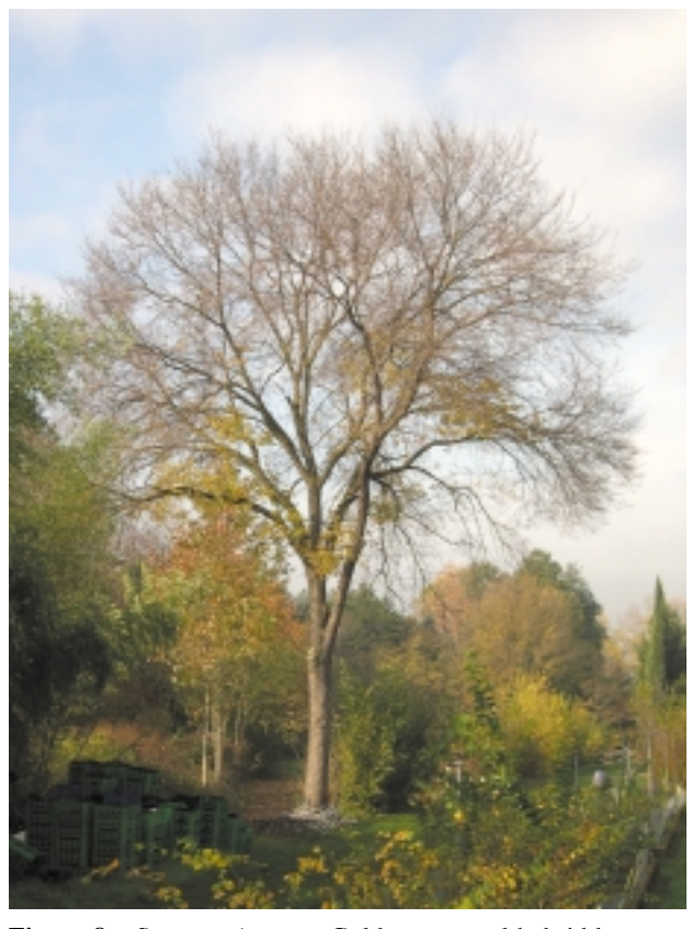
Figure 8. «Sapporo Autumn Gold», a natural hybrid between U. japonica and U. pumila , is the file-leader of nine selections patented by the Wisconsin University and sold also in Europe.

At the beginning of the hybridisation work with diploid species in 1968, three species, U. pumila, U. japonica, and U. rubra Muhl., were designated to be combined in order to replace U. americana. Later on, the last species, reputed to contribute vigour and ornamental value, was dropped because of its extreme susceptibility to DED. U. pumila, U. japonica, U. parvifolia and U. wilsoniana were the major sources of resistant genes for elm cultivar release in America up until the early 1990s. Starting from 1984, the Wisconsin breeding programme relied more and more on U. parvifolia because of its resistance to DED, to black leaf spot (Stegophora ulmea), and to the elm leaf beetle to which U. pumila was very susceptible. This was also because of the possibility of obtaining a certain number of hybrids with U. americana when the Chinese species was used as the female parent. Hundreds of U. parvifolia X U. americana hybrid seedlings were obtained with the prospect that vigorous resistant elms liable to preserve the structural characteristics of the American elm could be glimpsed. Nine resistant clo-