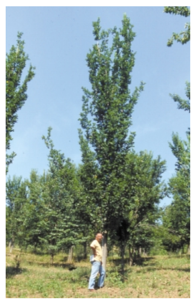
Figure 1. Fastigiate shape of selection «Columella» built up by H.M. Heybroek by selfing the clone «Plantyn» ( U. minor, U. glabra and U. wallichiana are among the parents).

In 1989, encouraged by the favourable results gathered in the European Community adaptability test, Heybroek released the «Columella» clone (Figure 1 and 2), which was characterized by a high level of