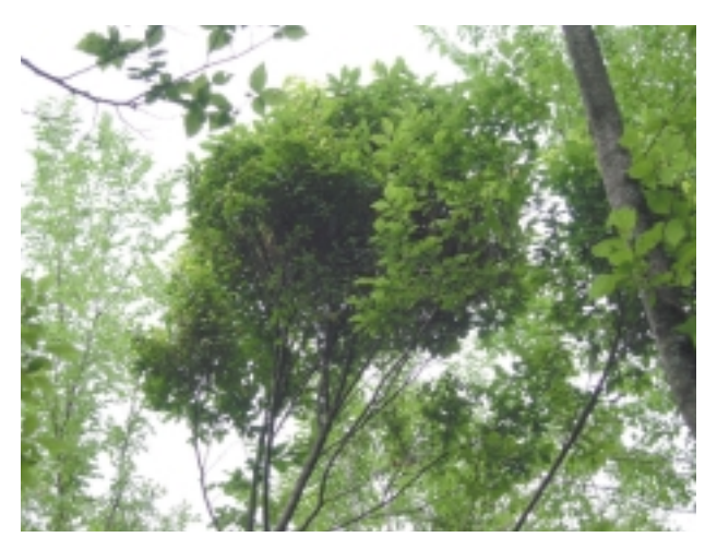
Figure 4. Witches' broom caused by natural infection of Elm yellows on U . «Lobel» in the Apennines, Italy.

Numerous insects are also known to damage European elms. Among these, the elm leaf beetle ( Xanto galerucha luteola Müller) (Figure 5) and the goat moth ( Cossus cossus L.) have a very high ranking. The various Asian elm species used in breeding programmes because of their resistance to DED show varying susceptibility to these insects. For example, in our expe-