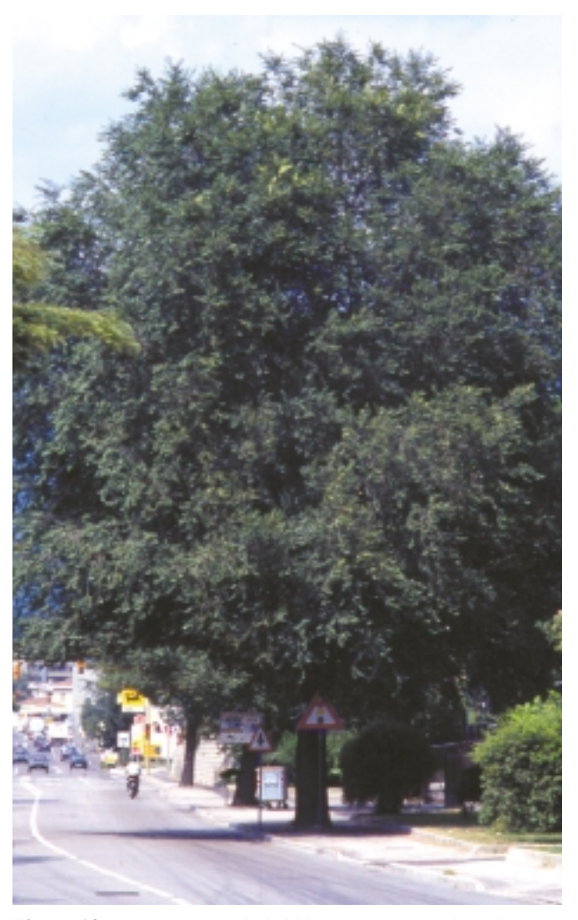
Figure 13. A spontaneous hybrid between U. pumila and U. minor in northern Italy.

The question of interfertility does not arise with sterile hybrids obtained with U. parvifolia , but is current and important for hybrids containing U. pumila , the Siberian elm, which crosses very easily with the field elm, U. minor , in southern Europe (Italy and Spain) (Figure 13) where it has been introduced abundantly,