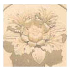
Left Perimeter showcases, Bank Stock Office