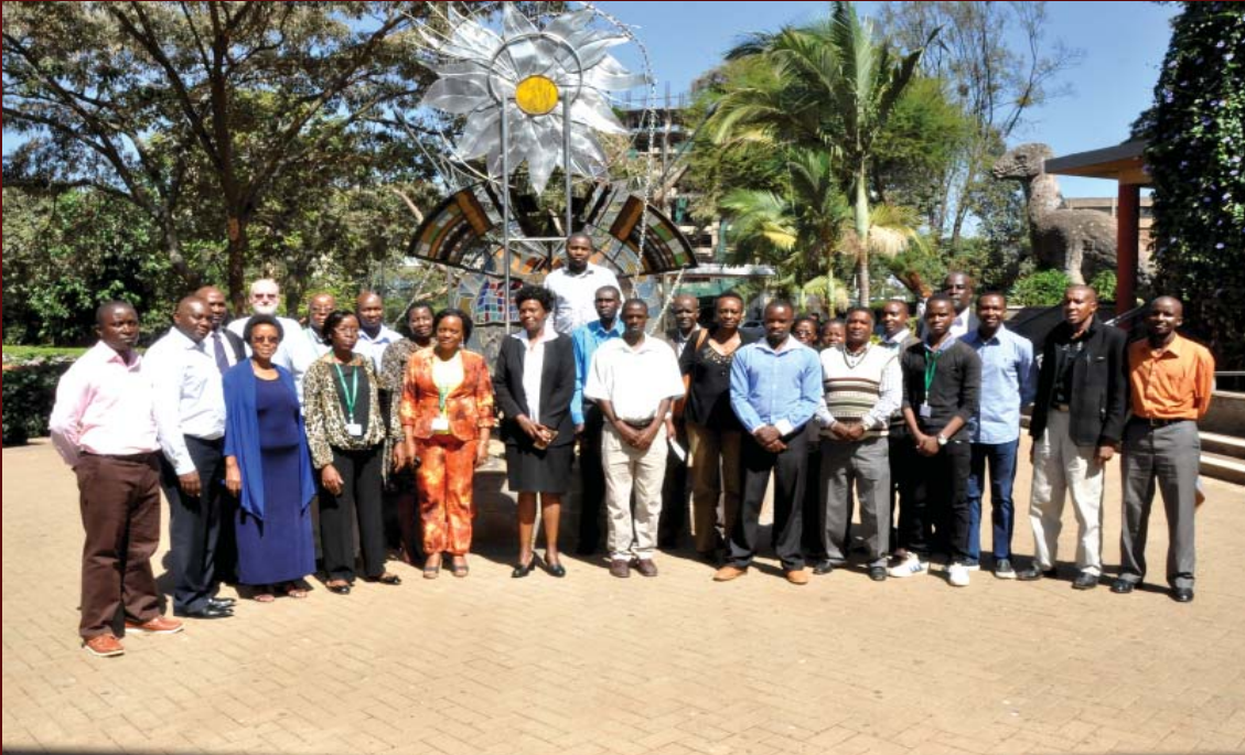
Group photo of Participants at the Nairobi National Museum during the 1st Regional Workshop on Assessment of Lepidoptera pollinator species diversity in East Africa

The National Museums of Kenya held four-day-1st regional training/workshop on Assessment of Lepidoptera pollinator species diversity data in East Africa from 5th March 2017 at the Invertebrate Zoology lab . Dr. Mzalendo Kibunja, Director General, NMK officially opened the workshop on 6th March, 2017.