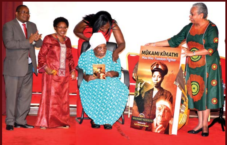
Her Excellency The First Lady Margaret Kenyatta (right) unveiling the memoirs of Mukami Kimathi, wife of the late Dedan Kimathi (seated) at the Louis Leakey Auditorium

H.E First Lady Margaret Kenyatta on 17th February 2017 joined several Mau Mau veterans in celebrating the life of Mukami Kimathi and her sacrifices in celebrating the struggle of Kenya's freedom.