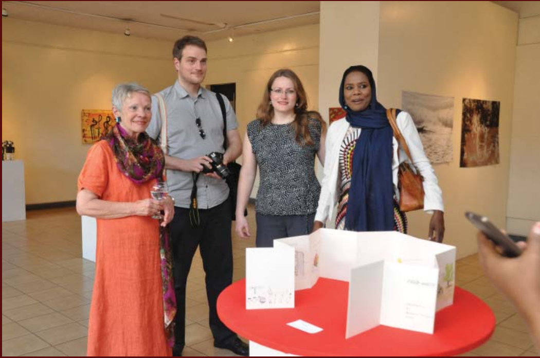
Above: Visitors during the opening of the Food Waste Exhibition at the Nairobi National Museum Creativity gallery. The display features work from IKV (Internationaler kunstlererein e.V and Hawa Artists. The exhibition supports the awareness of food Waste as a challenge through this collaborative exhibition by African and German artists. The exhibition closes on April 28