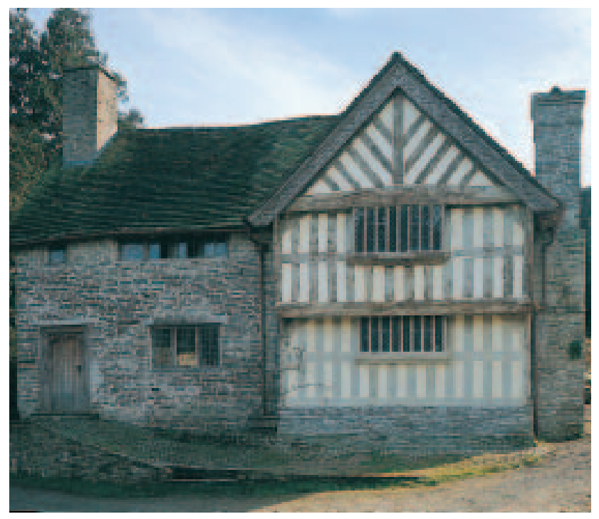
Upper House, Discoed, is listed Grade II*. This timber-framed hall-house was built in the sixteenth century and remodelled in the seventeenth century.