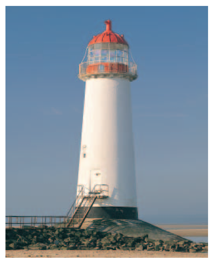
The lighthouse at Point of Ayr, Flintshire, was built in 1777 and its lantern may be the earliest in Wales. It is listed Grade II.