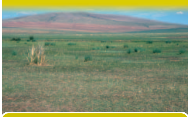
Table 2. Conservation issues and strategic solutions for birds of the Eurasian steppes and desert.

Conversion of steppe for agriculture has ceased in most parts of eastern Russia, and some formerly cultivated areas are reverting to steppe, but this is still a threat in Mongolia and China.