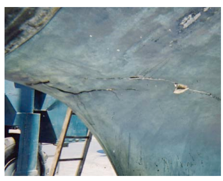
A large crack, like this, means a hard grounding, which may have caused structural damage.

Keels tend to take a lot of abuse in shal-