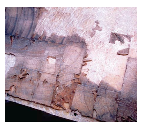
Water that leaks into the core can eventually cause rot.

Nearly all sailboats built in the 1980s or later have a deck comprised of a core made from balsa or some sort of