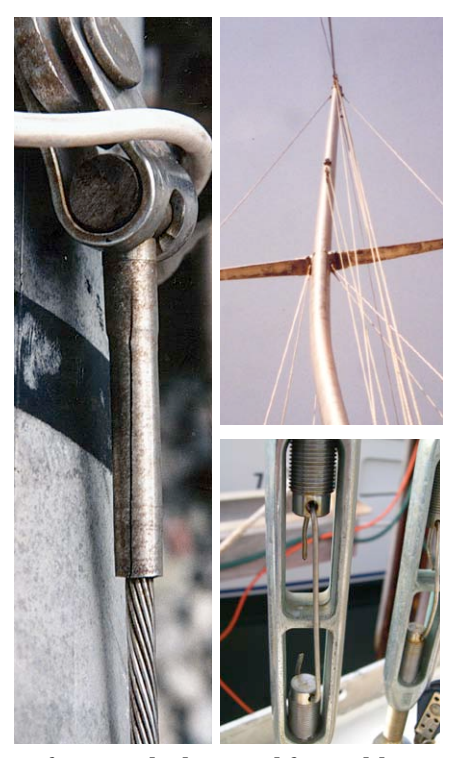
Left: A cracked swaged fitting like this can bring the whole rig down. Top right: A stay broke on this mast in light winds, but fortunately the rig stayed up. Bottom right: Replace cotter pins with welding rod to avoid snagging lines.

cracks, above and belowdecks — you may have to remove a liner and some trim to get to it.