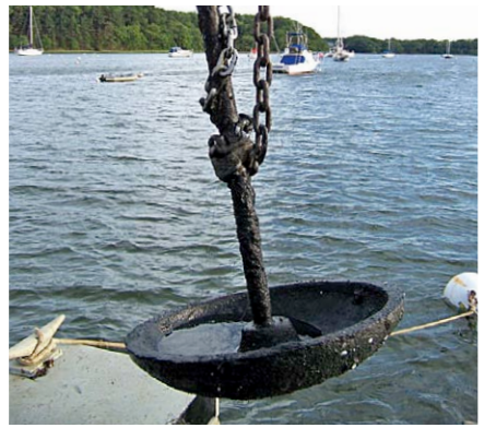
Mushroom anchors can drag if the chain wraps around the shank.

But both have serious issues. While a deadweight anchor may gain some advantage from suction in a mud bottom, in most cases its holding power is completely dependent on its weight, or, more exactly, on its submerged weight. Cast iron weighs about 12.5 percent less in the water than out; concrete loses nearly half of its weight underwater. The reduced weight and lack of shape to help the anchor dig in to the bottom mean that it takes a very large and heavy deadweight anchor to hold a boat in place in gale-force winds. As you would expect, in various tests deadweight concrete moorings