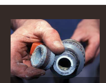
PVC has no place in seacock installations.