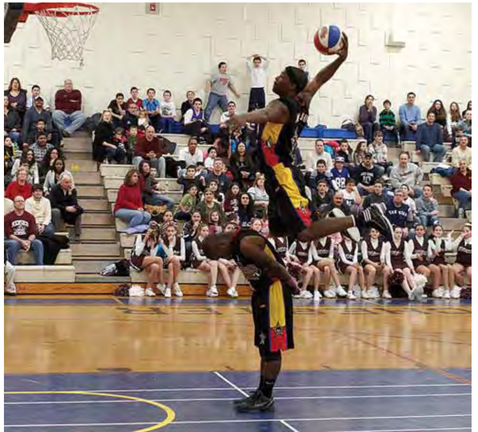
Harlem Wizards in action.

Tickets are: $12 for students ($14 at the door); $14 for general admission ($16 at the door); $25 for reserved seating (includes free team poster); and $40 for Courtside Plus (includes