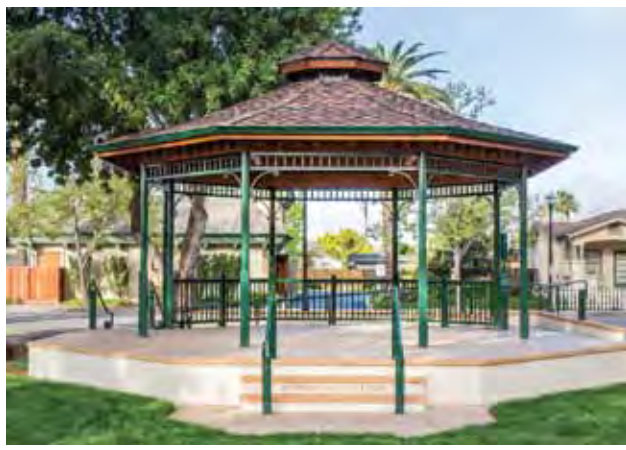
A view of the completed bandstand.