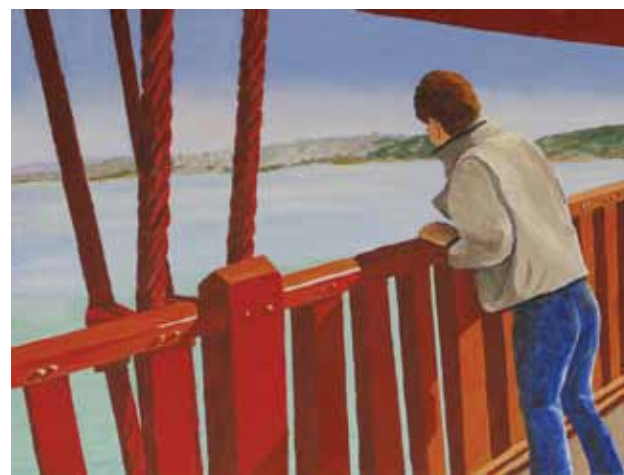
Gina Kaiper's oil painting "On the Bridge" is included in the exhibit at Pleasanton's Firehouse Arts Center, April 8-30.