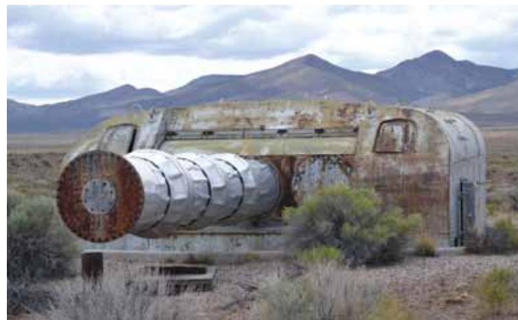
Mark 9 turret from the USS Louisville, rusting in the Nevada desert, where it once served in Lawrence Livermore National Laboratory's nuclear testing program.