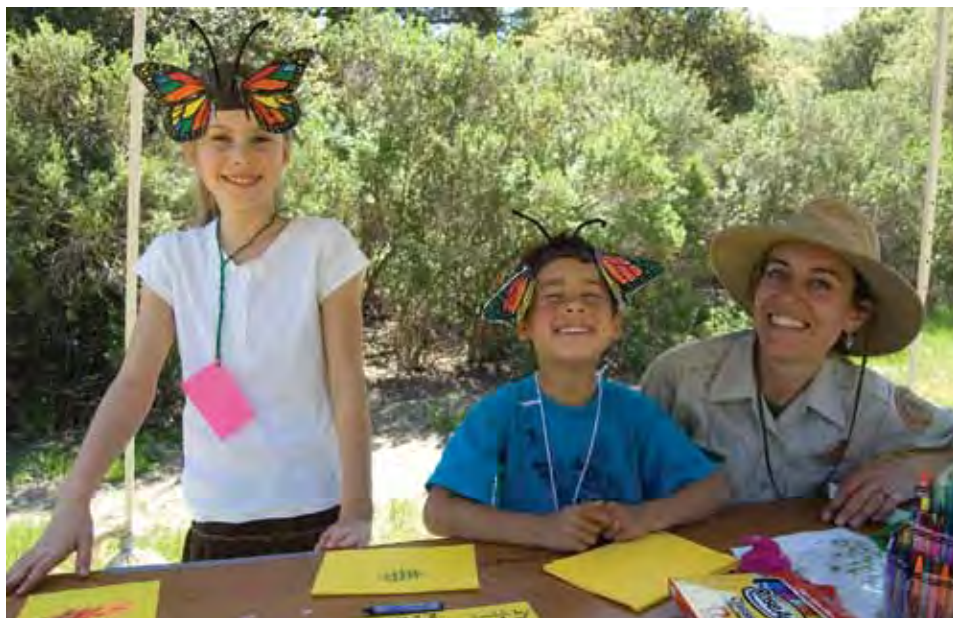
Fun at last year's festival