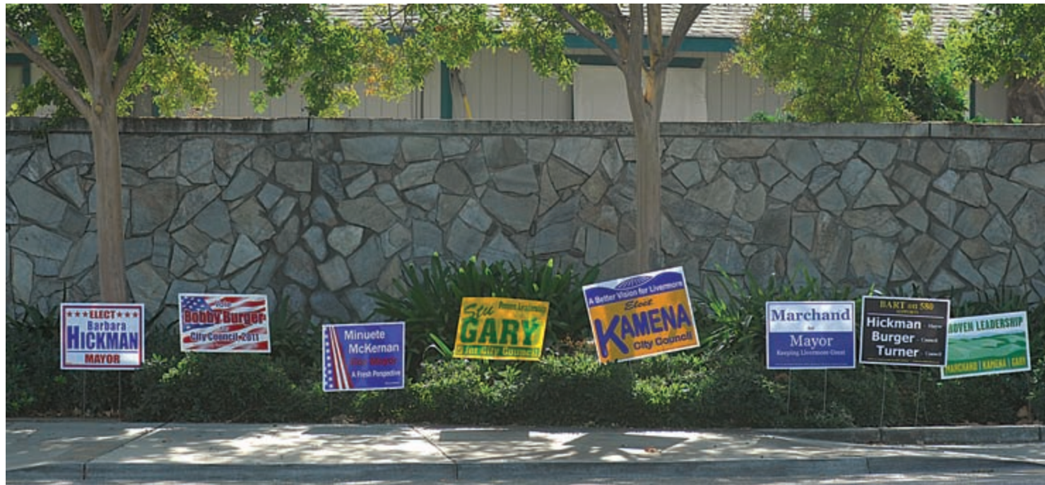
Campaign signs are posted throughout the city in support of candidates running for office in Livermore.