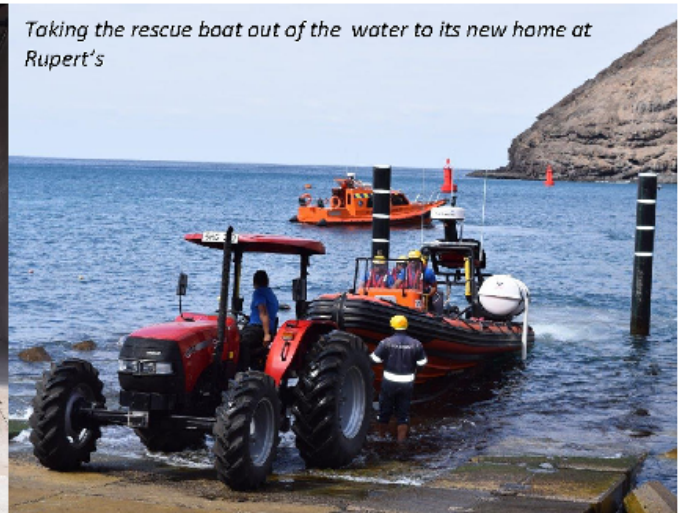
Taking the rescue boat out of the water to its new home at Rupert's