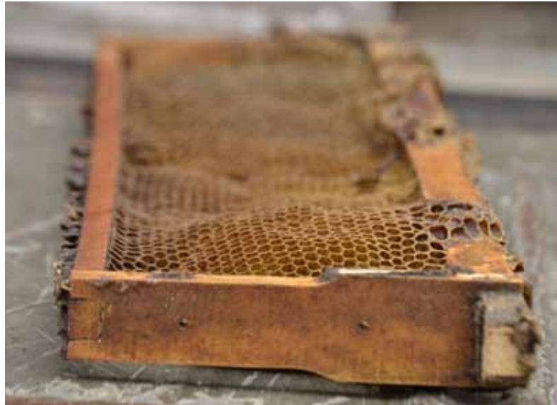
Comb fresh from a hive.

be a little dangerous. Don't take off your veil and bee suit until you are satisfied you have not been followed by bees. Bees will smell honey a mile away and will want some if they can get it. When you arrive at the parked vehicle, place the honey inside with the windows up and then ask your helper to check to make sure you are not carrying bees on your veil. Sometimes they just hang there and love the ride. You will find yourself sweating from the bee suit and veil so remove those things and place them in a sack for easy storage with gloves and wiping cloths. When you arrive at home, you should have already made a storage space somewhere in a dark place and away from ants. I normally have my containers on top of a bench in the coolness of a passage and covered with table cloths. It is advised to let honey rest for a few days before it is tampered with. Always work with processing honey in the evenings when the bees are in the hives as they will enter the house and workplace and will try to get into the honey, so watch very carefully. Wherever you choose to process the honey make sure you have all the containers, strainers, jugs, spoons and knives at hand. You should also have a nice sink of hot water for washing your hands often. It is very important to realise that what you are dealing with is food, most of which might be sold on the open market so