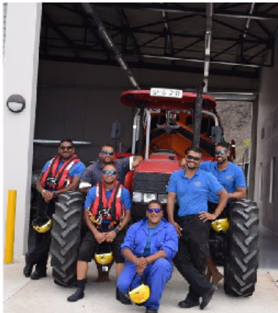
Members of the Sea Rescue Team

Now that the Sea Rescue Service has relocated, the public is asked to refrain from parking in front of the Sea Rescue Facility and the Slipway. Any obstruction to the area could delay the deployment of the Sea Rescue Boats in the event of an emergency.