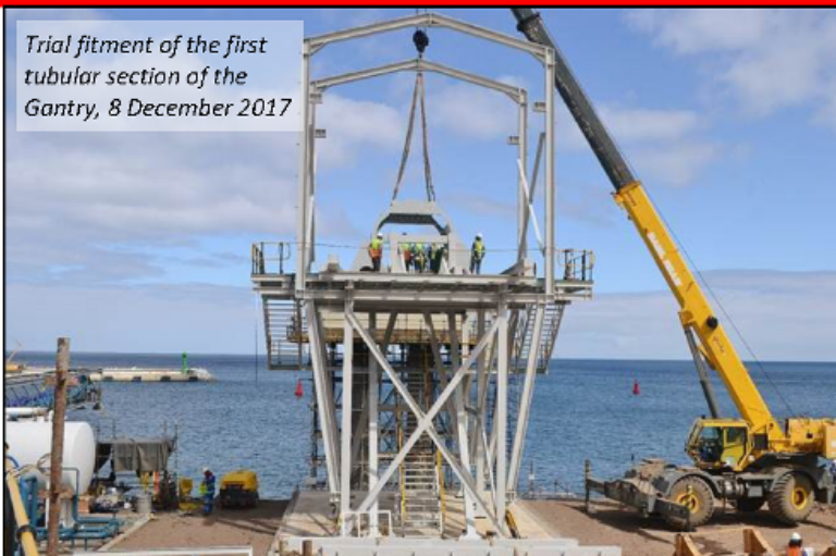
Trial fitment of the first tubular section of the Gantry, 8 December 2017