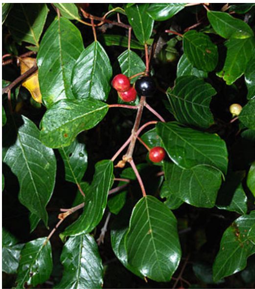
Fig. 2.2 Rhamnus frangula . Alder buckthorn. David Perez, Feb. 17, 2012 via Wikimedia. Creative Commons Attribution

Arabic-speaking regions of northern Africa. Later on, the name ribose was used (in 1892) for a new isomer of arabinose, the change of letters from arabinose to ribose being a sort of literal representation of the chemical isomerization (likewise, in the same period, an isomer of xylose was named lyxose ).