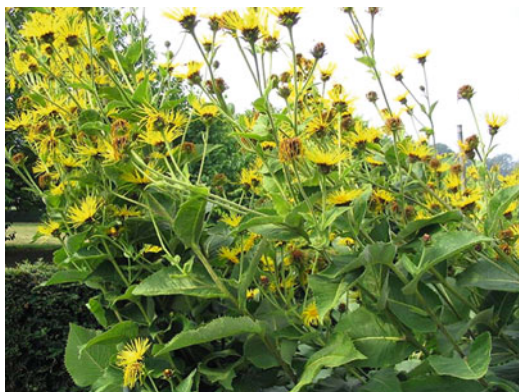
Fig. 2.4 Inula helenium. Elecampane.

Inulin is extracted from a large yellow-flowered plant called elecampane in English (Fig. 2.4). Since antiquity, this plant has been known for its medical properties. Pliny the Elder describes it under the name inula , itself derived from Greek helenion , which designates a plant supposed to be dedicated to the legendary, famous, and beautiful Helen of Troy . Namely, helenion was borrowed in primitive Latin as elena , or enula , due to the permutation of l and n (i.e., metathesis, as mentioned earlier in this chapter), and then inula in classical Latin. At the same time, elena ( alena ) evolved to aunée in French, alant in German and