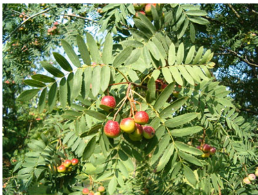
Fig. 2.1 Sorbus domestica . Sorb tree, or service tree, or rowan. BotBln, Feb. 17, 2012 via Wikipedia, Creative Commons Attribution

Starting from glucose , the suffix -ose is added, for designating different sugar units, to several elements related to: