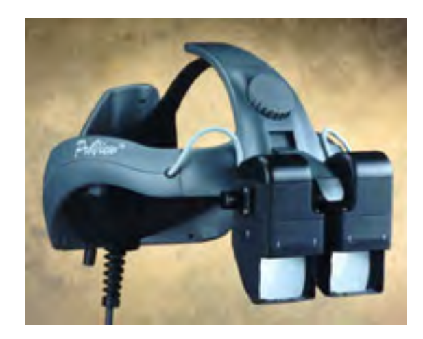
Figure 6. Kaiser ProView 50.