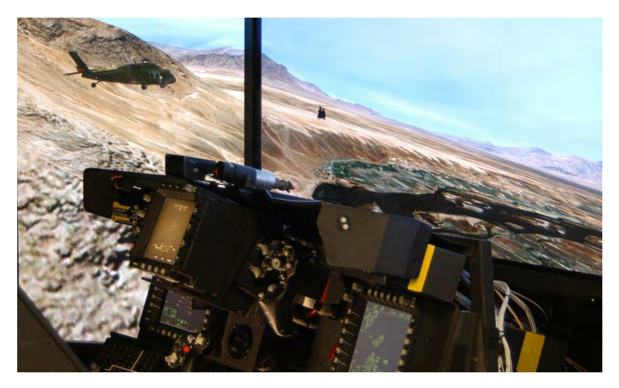
Figure 3. Bagram, Afghanistan visual database.