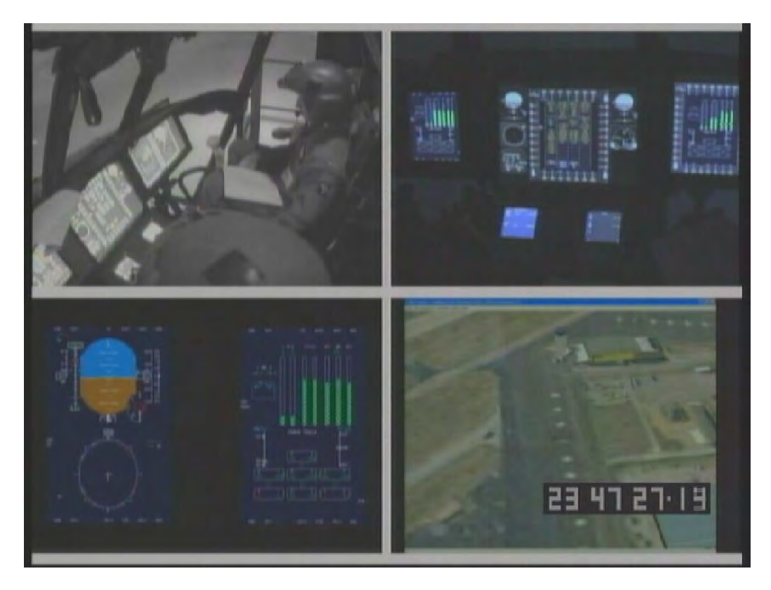
Figure 10. CH-EAC cockpit and displays.