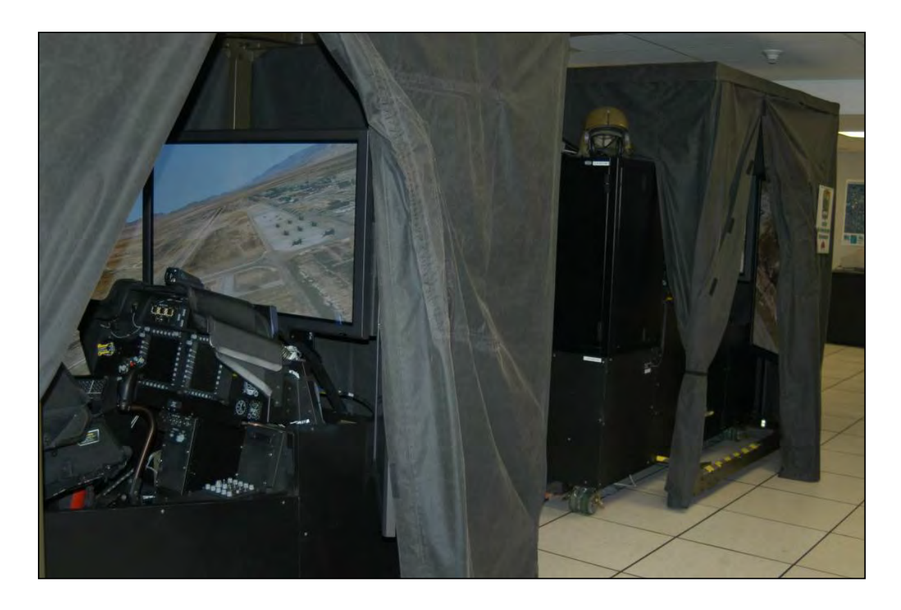
Figure 2. RACRS cockpit simulator.

The simulator visual system was configured to fly the existing Bagram, Afghanistan, visual database (figure 3). This is a geo-specific large gaming area built from satellite acquired high-resolution imagery and detailed terrain relief. It also contained appropriate cultural features to increase realism for the pilots.