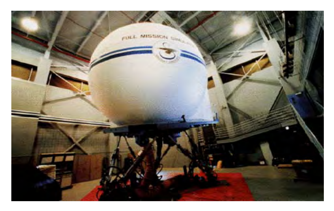
Figure 5. EDS simulator.

The Kaiser ProView 50^* (figure 6) was the helmet mounted display (HMD) used by all of the pilots in the EDS and CPC. It had two liquid crystal displays with 28^\circ (V) \times 49^\circ (H) field-of-view (25% binocular overlap), 1024 \times 768 resolution, inter-pupillary distance adjustment, eye relief adjustment, adjustable headband and strap, an electronic control unit, and a Polhemus head-tracking sensor. The weight of the HMD was 1.3 lb. The HMD provided the out-the-window display to the pilots via a synthetic visual scene overlaid with monochrome symbology. When used in the night vision pilotage system (NVPS) mode, the HMD displayed the forward-looking infrared (FLIR) scene overlaid by the monochrome symbology. A headset was placed over the HMD to provide the pilots with the capability for radio and inter-cockpit communication.