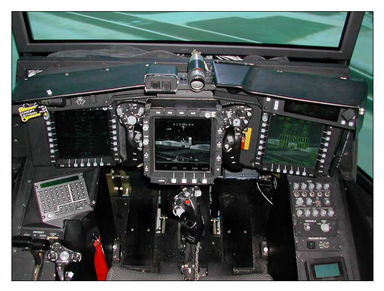
Figure 1. AH-64D Apache Longbow cockpit and displays.

ARL HRED conducted two pilot workload assessments for unmanned aerial system (UAS) teaming using the RACRS. The assessments evaluated the video from UAS for Interoperability Teaming Level II (VUIT-2) system (Hicks et al., 2009) and the integrated UAS (IUAS) system (Durbin and Hicks, 2009) that were being incorporated into the aircraft. VUIT-2 provided the ability to conduct level II UAS interoperability (receive video from the UAS). The IUAS system provided the aircrew with the capability to conduct level II, level III, and level IV UAS interoperability (receive video from the UAS sensor and air vehicle).