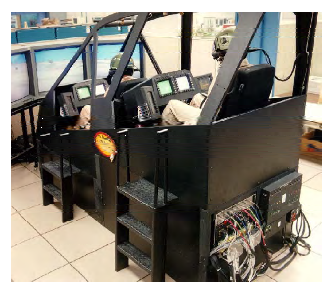
Figure 4. CPC simulator.

The CPC (figure 4) and EDS (figure 5) each consisted of two Comanche crewstations arranged in a tandem seating configuration. The front and rear crewstation configurations were identical (figure 4), enabling each pilot to perform all aircrew navigation, communication and weapons employment tasks. The simulators contained the hardware and software that emulated the controls, flight characteristics, and most of the functionality of the proposed Comanche production aircraft. The EDS was a full motion simulator and the CPC was a fixed-base simulator. The EDS motion was the only significant difference between the simulators. The EDS and CPC were used by ARL HRED to assess the crewstation design during the RAH-66 Force Development Test and Experiment 1 (Durbin et al., 2003).