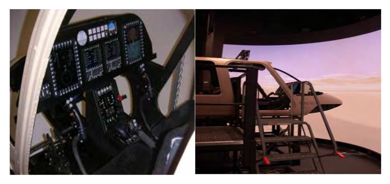
Figure 9. ARH BHIVE 2 cockpit and simulator.