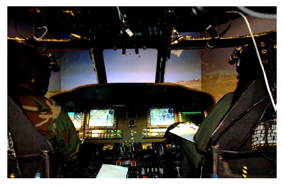
Figure 8. UH-60M SIL cockpit view.