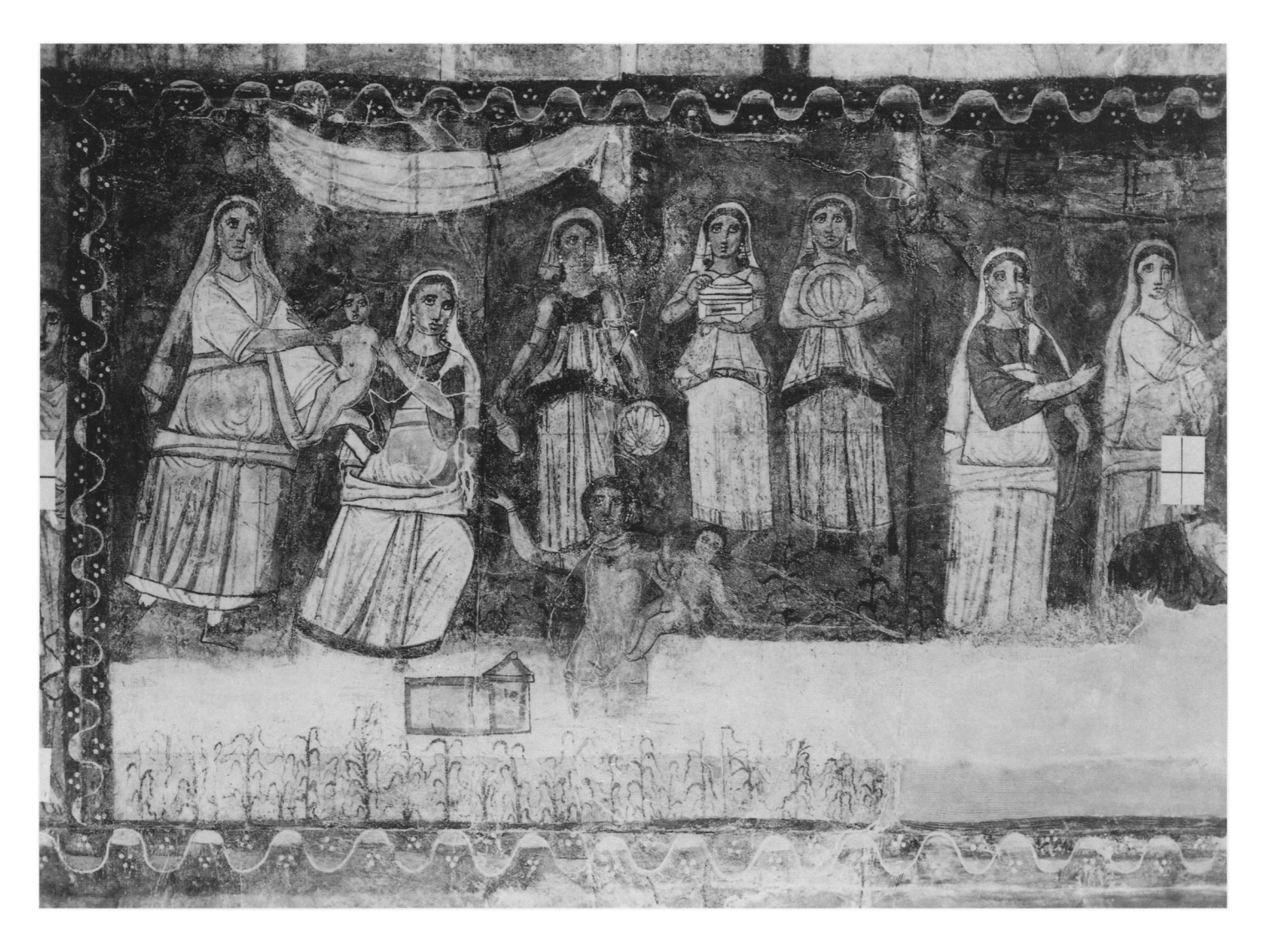
1) «The Finding of Moses», Dura Europos Synagogue, west wall, Syria, ca. 245 A.D., Damascus National Museum.

common implement featured in Christian art). Furthermore, Abraham's grasping of Isaac's hair in the Leon miniature is a detail not found in the Dura painting.