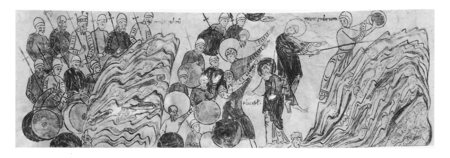
5) «The Exodus from Egypt», Ripoll Bible, Spain, first half of 11th century, Vatican City, Biblioteca Apostolica, MS lat. 5759, fol. 310v.

with Byzantine Octateuchs (for instance, Istanbul, Topkapi Saray Library, Cod. gr. 8, fol. 141), yet the similarities are rather superficial. In both renderings the four major persons described in the Bible are present, and the patriarch is seen reclining. However, the costumes in the two scenes differ. In the Dura synagogue painting Joseph is clad in a Persian trousered costume, whereas in the Octateuch he is shown wearing the draped robe. Furthermore, in the Dura painting Jacob is neither bearded nor has white hair, as in the Octateuch miniature. In addition, in the Dura scene neither Jacob nor Joseph are haloed, as they are in the Octateuch rendition. In the Octateuch all of the figures are shown in profile, while at Dura they are presented frontally. Moreover, in the Octateuch Jacob's hands are shown crossed, an antitype of Jacob's preference for his younger son Ephraim (interpreted by the Church Fathers as Ecclesia). The Dura depiction seems to have avoided the crossing of Jacob's hands - the prefiguration of the cross.6 It seems, then, that the differences in the two scenes far outweigh the resemblances, and appear to rule out any direct connection between them.