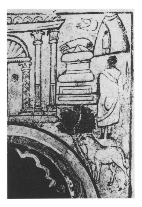
3) «The Sacrifice of Isaac», Dura Europos Synagogue, west wall, Syria, ca. 245 A.D., Damascus National Museum.

Narrative scenes in the Dura synagogue paintings have been linked not only with Spanish illustrations, but with Byzantine ones as well. Such depictions as that of Jacob blessing the sons of Joseph in the Dura synagogue have been compared