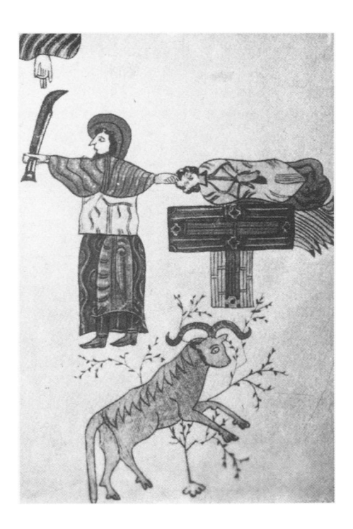
4) «The Sacrifice of Isaac», Leon Bible, Spain, 960, Léon, Colegiata de San Isidoro, Cod. 2, fol. 21v.