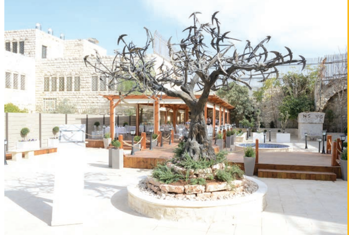
St John celebrates International Women's Day > PAGE 8

The Newsletter of St John of Jerusalem Eye Hospital Group - The only charitable provider of expert eye care in the West Bank, Gaza and East Jerusalem; treating patients regardless of religion, ethnicity, or ability to pay