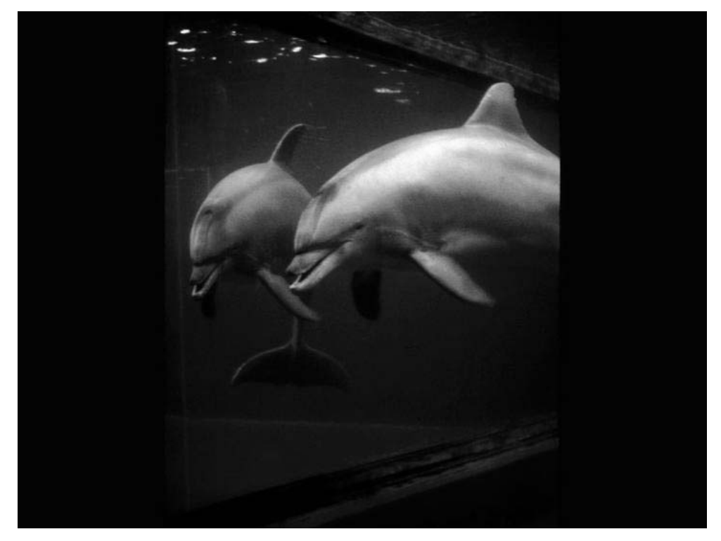
Figure 3. Bottlenose dolphins use mirrors to investigate marks on their bodies.

These findings revealed, once again, that dolphins possess cognitively complex capacities that are found in only a small subset of primates with highly elaborated brains. Bottlenose dolphins also show related capacities in the domains of awareness of one's own body parts and behavior (Herman et al., 2001; Mercado et al., 1998, 1999).