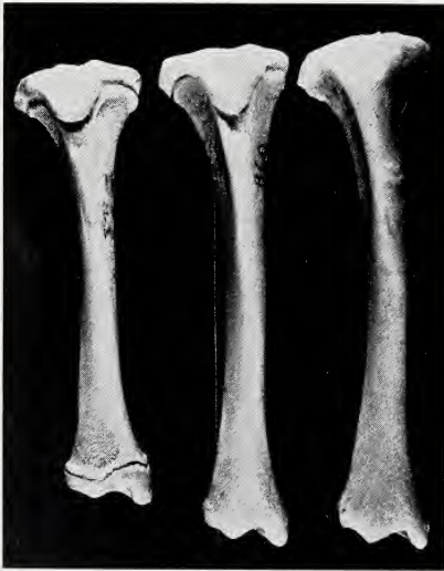
Fig. 1. Tibiae from badgers of different age. Age of the animals from left to right: c. 6 months, c. 18 months and c. 70 months