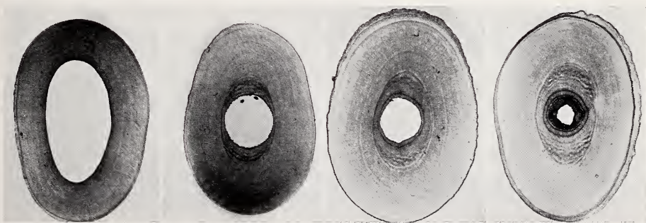
Fig. 2—5 (from left to right). Cross-section of the third incisor of a badger about 7 months old (Mag. c. 25×). — Cross-section of the third incisor of a badger about 16 months old (Mag. c. 25×). — Cross-section of the third incisor of a badger about 30 months old (Mag. c. 25×). — Cross-section of the third incisor of a badger 11 years old (Mag. c. 25×)

Animals killed during their second summer of life have a greatly reduced pulp cavity and a diffuse zone in the dentine, apparently formed during the winter, while the cementum usually shows one dark line (Fig. 3). In teeth from two-year old animals there are two lines present in the dentine; the diffuse line mentioned before and one very distinct line. In the cementum two zones are usually visible (Fig. 4). In older animals there is an increasing number of dark, distinct zones in the dentine with a corresponding number in the cementum and it seems reasonable to assume that these are formed annually.