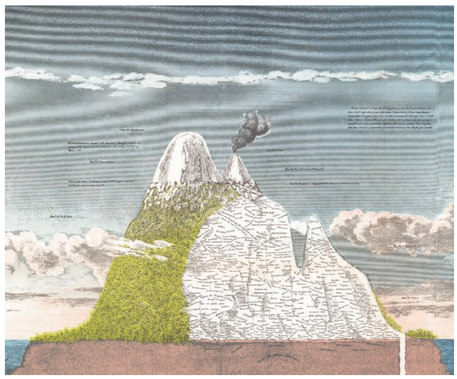
Intellectual riches. The central portion of Humboldt's Physical Tableau of the Andes and Neighboring Countries , published as part of ( 2 , 3 ), shows Chimborazo in profile, with vegetation zones, plant species, and snowline depicted at appropriate elevations. In the original, the profile is flanked on both sides by tables describing elevational patterns in temperature, humidity, light refraction and intensity, agriculture, fauna, and other physical, chemical, and biological features.

In the early 19th century, Alexander von Humboldt laid the foundations for today's Earth system sciences.