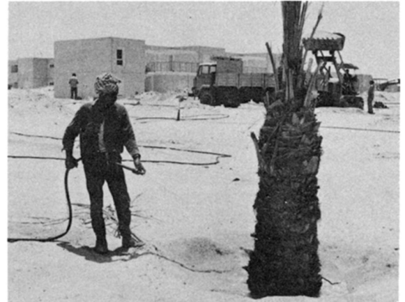
Top: constructing Yamit Middle: lookout at Sinai border settlement Bottom: Israelis withdrawing from Abu Rudeis