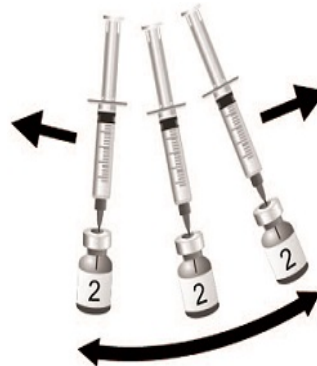
Figure 3. Gently shake the vial to thoroughly mix contents until powder is completely dissolved.