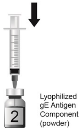
Figure 2. Slowly transfer entire contents of syringe into the lyophilized gE antigen component vial (powder). Vial 2 of 2.