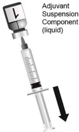
Figure 1. Cleanse both vial stoppers. Using a sterile needle and sterile syringe, withdraw the entire contents of the vial containing the adjuvant suspension component (liquid) by slightly tilting the vial. Vial 1 of 2.

component (powder) with the accompanying AS01 B adjuvant suspension component (liquid). Use only the supplied adjuvant suspension component (liquid) for reconstitution. The reconstituted vaccine should be an opalescent, colorless to pale brownish liquid. Parenteral drug products should be inspected visually for particulate matter and discoloration prior to administration, whenever solution and container permit. If either of these conditions exists, the vaccine should not be administered.