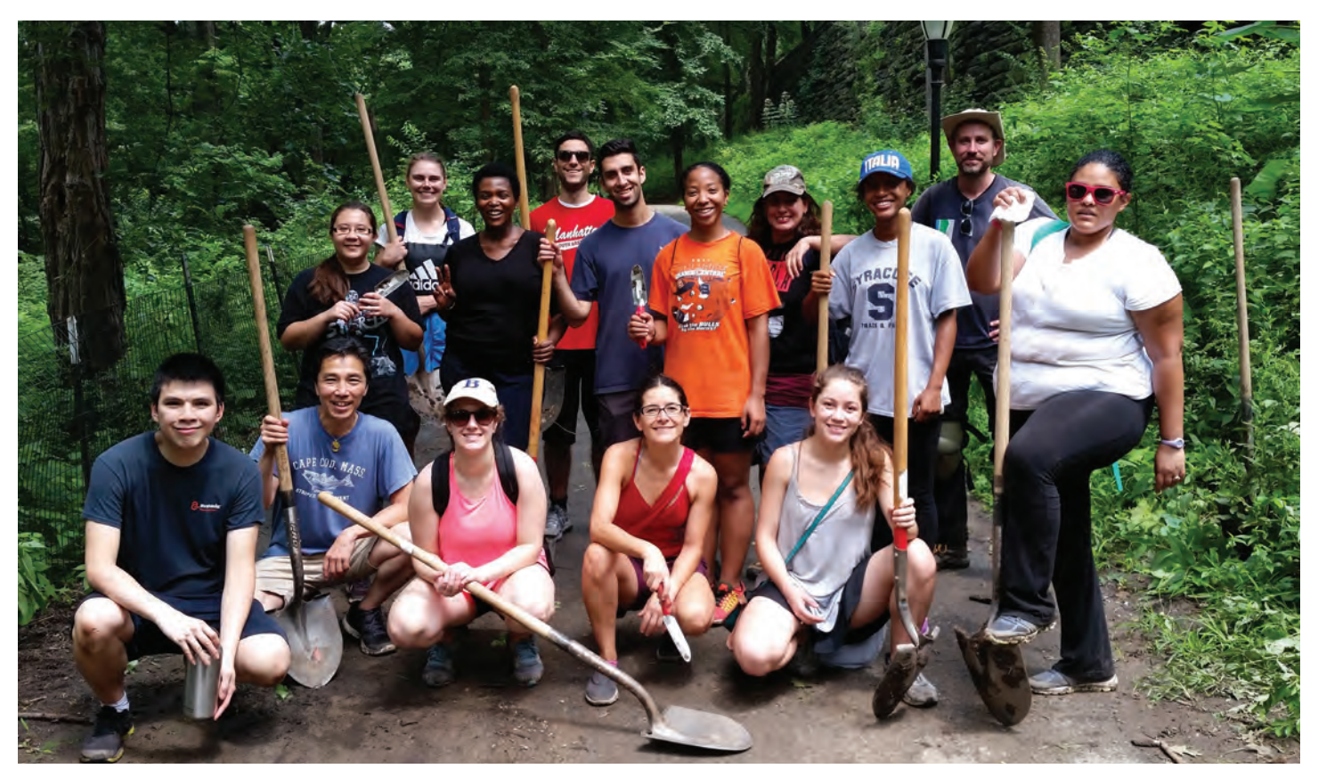
New York Cares volunteers help take care of the Park on a bi-weekly basis.

Spending time volunteering in the Park is a great way for local organizations, corporate groups, and schools to foster community building both within their group and within the Riverside Park community. We accommodate groups ranging in size from 10–50 people – several times a week, in the spring and summer – and also regularly work with larger groups of over 100 individuals. Groups can choose to volunteer in the park on an ongoing basis, several times a year, or just once per year, and donate a certain amount to the Conservancy to participate in various types of work.