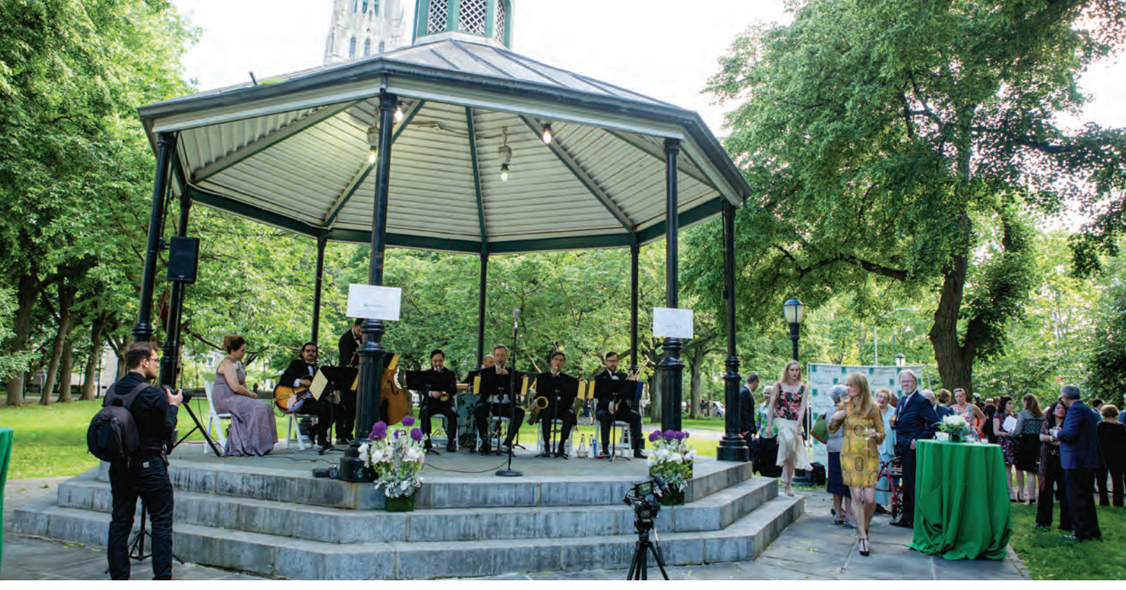
Live music floated through Sakura Park during cocktail hour.