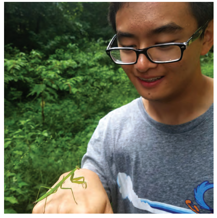
The summer was full of discoveries.