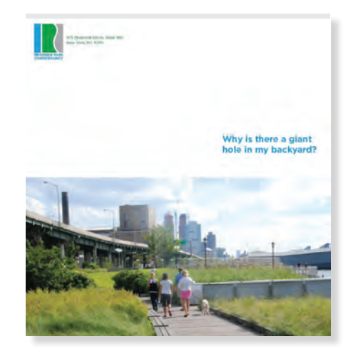
The Conservancy sent a mailing to address frequently asked questions about Riverside Park South.