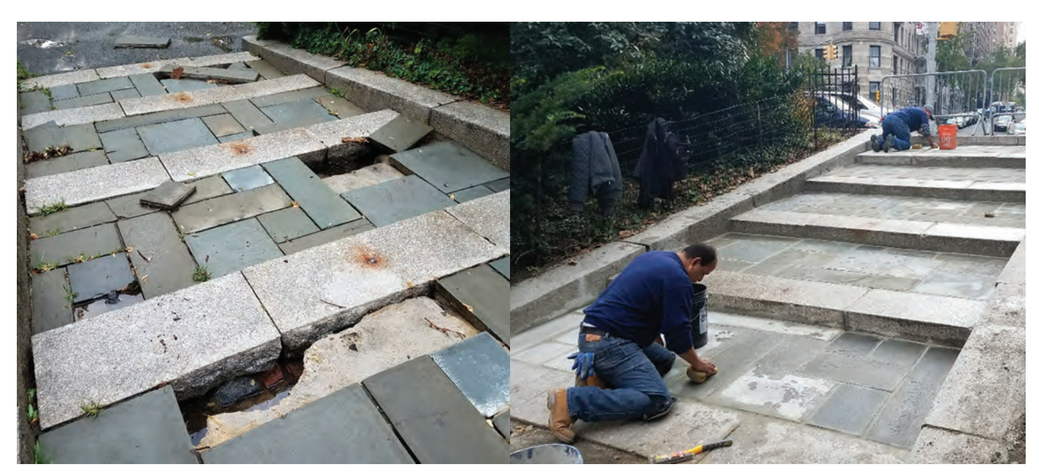
The Step Ramp was rendered unusable, and the Conservancy was able to restore access in just two weeks.

In the summer of 2018, the 97th Street Step Ramp was badly damaged in a flash flood caused by heavy rainfall. Rather than wait for this important access point to be repaired – sometime, someday – the Conservancy used its own funds to repair the Step Ramp as quickly as possible.