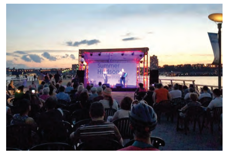
Amplified Sunday concerts take place on Pier I every Sunday in July.

Summer on the Hudson distributed 15,000 copies of the 2018 brochure.