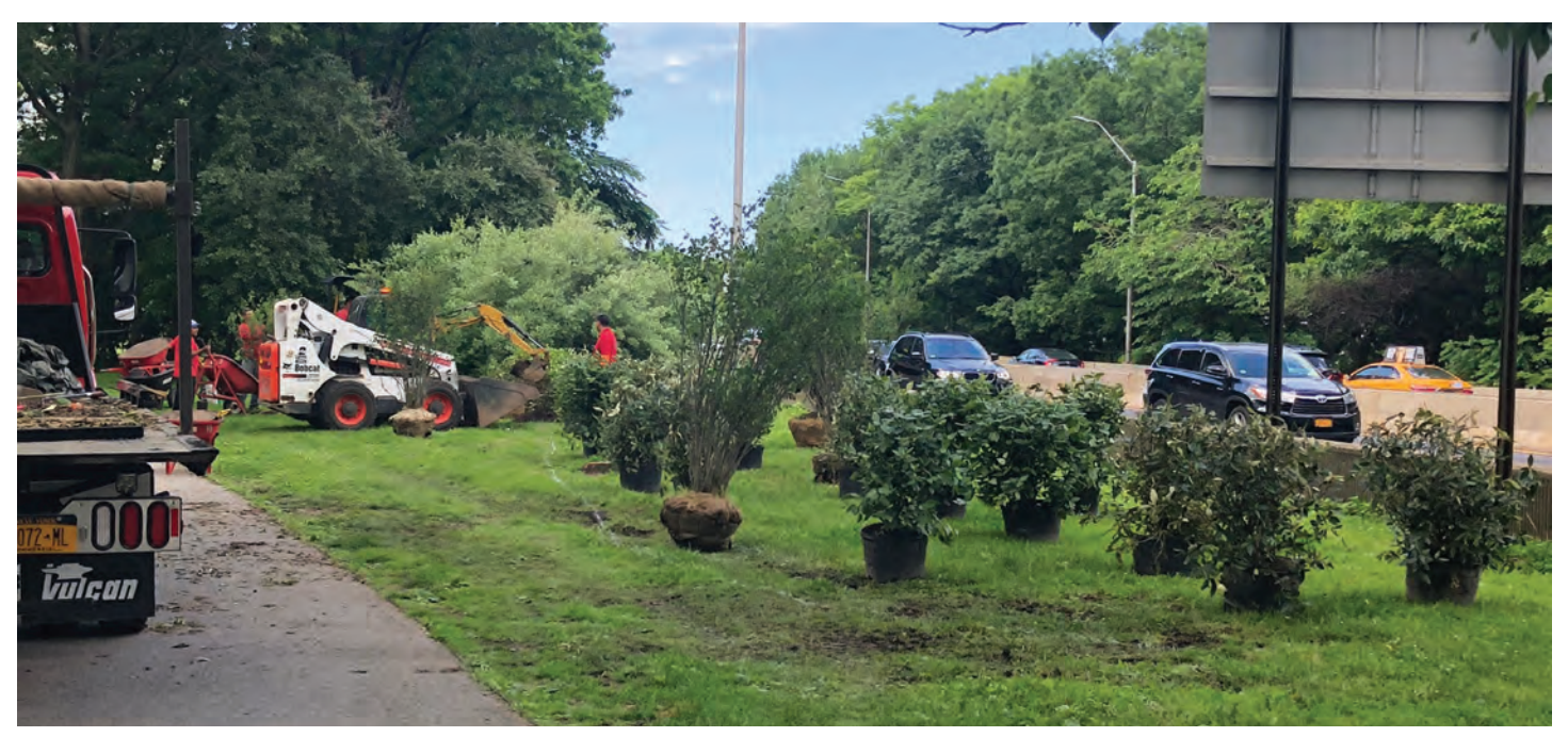
New trees wait to be planted along the highway.

New York City is a heavily populated and traveled metropolis. In areas of Riverside Park, the Henry Hudson Parkway is directly adjacent to the parkland. Car traffic is visible in areas in the West 70s, and has a direct impact on the park user experience. In 2018, the Conservancy began establishing a privacy line of tree cover. These new trees result in both immediate and long-term benefits – enhancing the daily park user experience while mitigating erosion from storm water runoff, filtering pollutants from the air, and providing shade for park users.