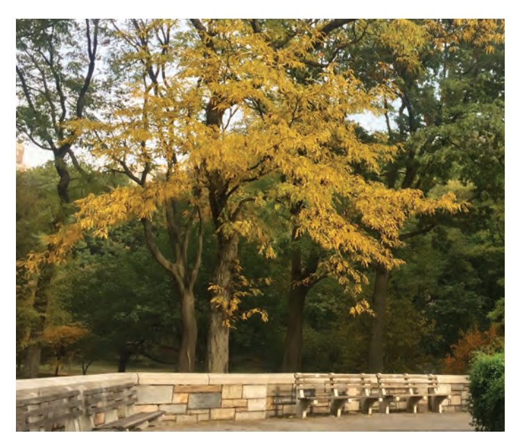
The beautiful and historic honeylocust trees can be found throughout the entire Park.

Keep an eye out and you will see the brilliant gold of the honeylocust's fall leaves throughout the year - on Riverside Park Conservancy signage and materials. The vibrant hue inspires bold ideas and embodies our revitalized commitment to Riverside Park.