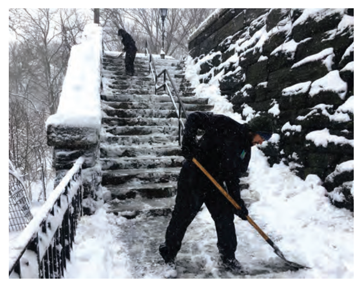
Snow Corps volunteers ensure that the Park is accessible no matter what the weather brings.

Riverside Park would not be where it is today – a place of beauty, community enjoyment, and successful environmental stewardship – without loyal grassroots volunteers and Conservancy Gardeners who continue to expand their reach. Since the 1980s, local volunteers have been caring for the Park's health and beauty with a sense of purpose and pride. They communicate with visitors and locals alike about all the Park has to offer, whether it is to describe a new planting or simply to give directions.