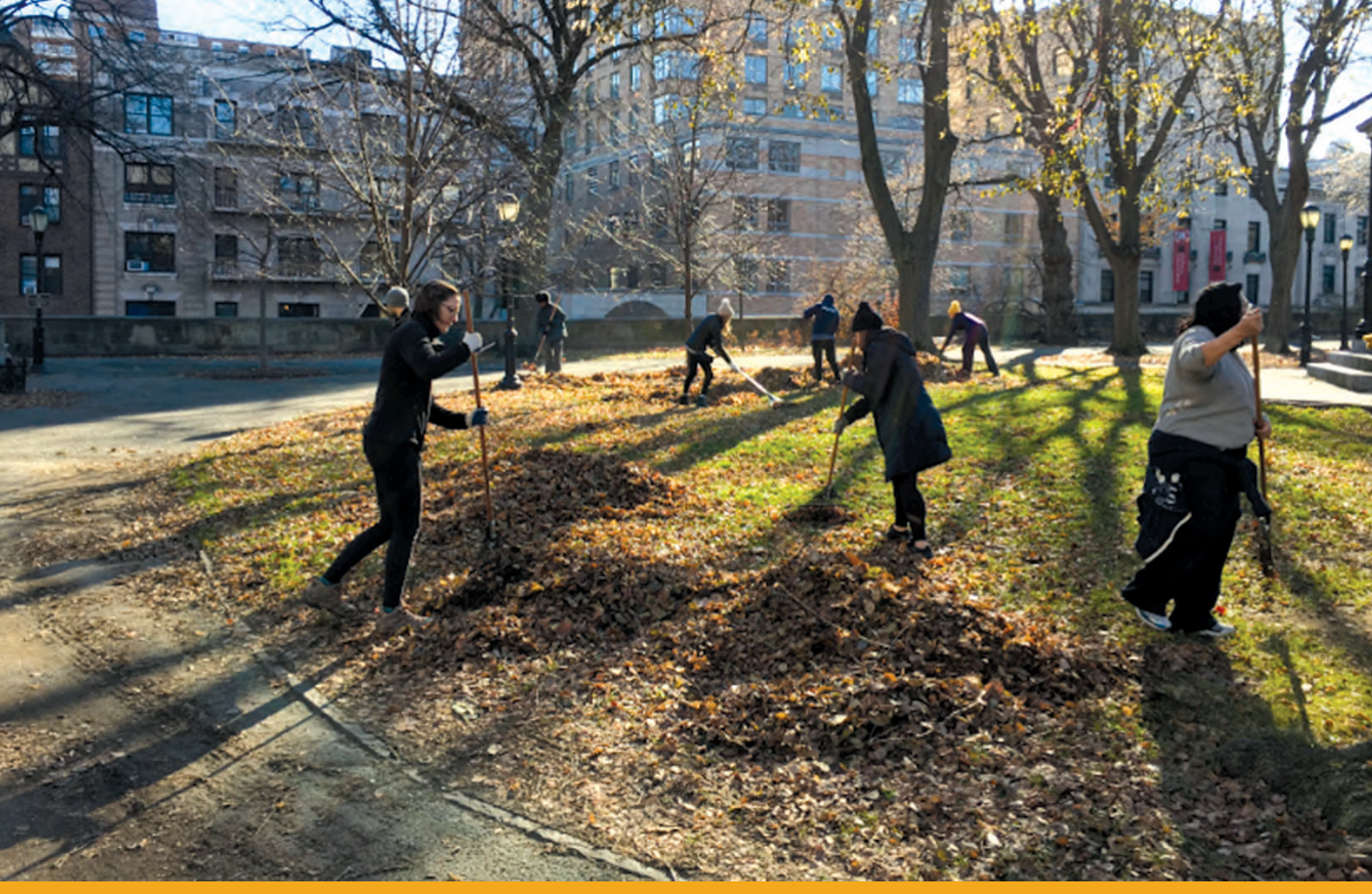
Volunteers raked leaves throughout the Park