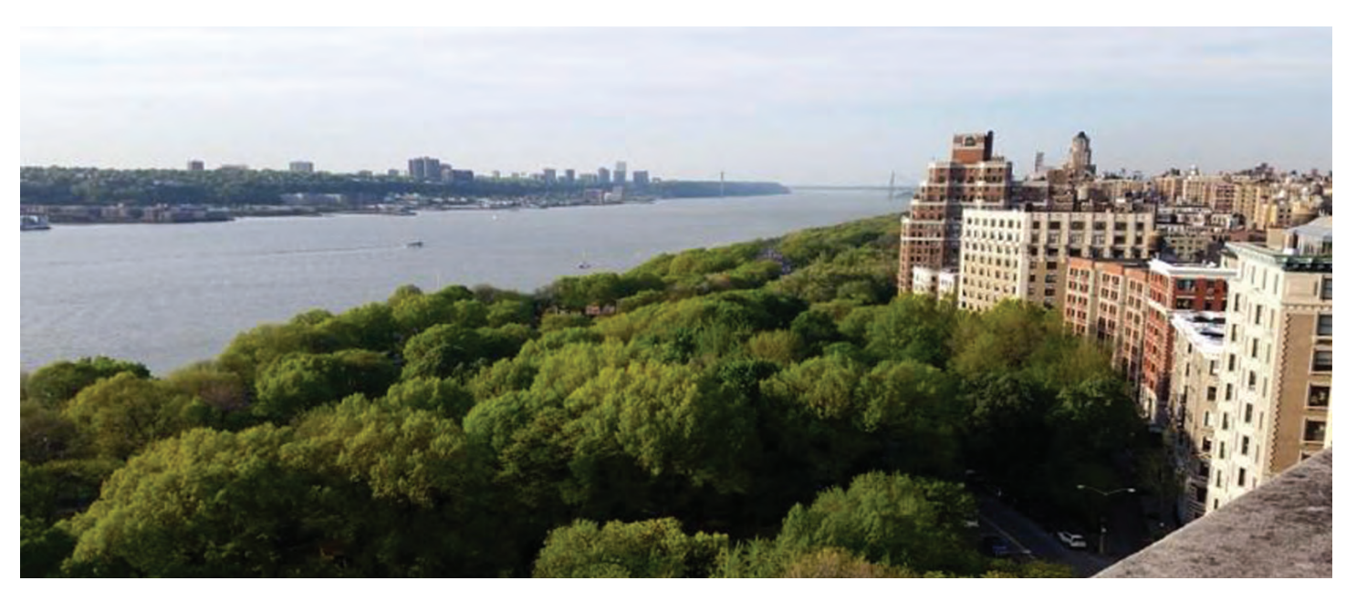
Riverside Park Conservancy's work extends for six miles along the Hudson River, serving the Upper West Side, West Harlem, Hamilton Heights and Washington Heights.

Restoring, maintaining, and improving this unique 400-acre stretch of parkland is only possible when conservancy, city, and community work side by side. A park alongside the Hudson River presents special challenges, such as storm damage, ecological challenges, and erosion. Not to mention the additional stresses of having a highway and a railroad running through it.