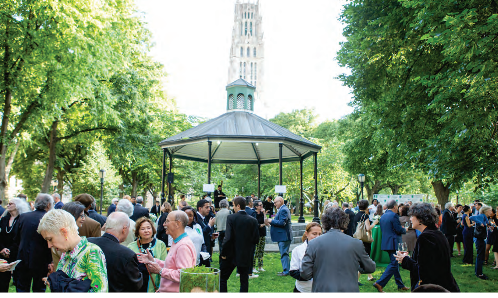
The annual spring benefit celebrates the Conservancy's work in Riverside Park – and all funds raised go directly into the Park's care.