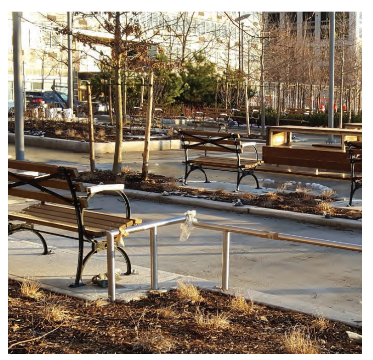
Benches were installed as Phase V work continued in the winter.

In the fall of 2018, the Conservancy sent out a mailing to park users and residents to address the most frequently asked questions from the public regarding Riverside Park South. This mailing included a comprehensive overview of the history, complications, progress, and current state of this section of the park. It effectively opened a dialogue with stakeholders and further cemented the Conservancy's role as a liaison for the community.