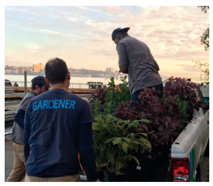
Conservancy staff are dedicated to providing year-round care for every inch of Riverside Park.