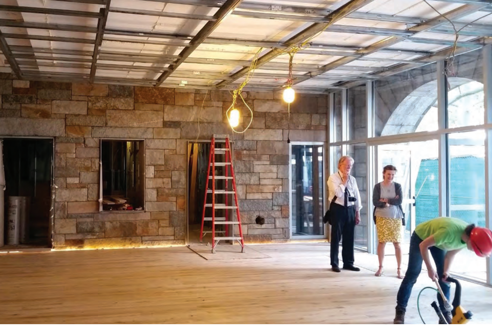
In 2018, major renovations -including an entirely new floor - were made to the interior of the Field House.

It will anchor recreational activities, including our Summer Sports Camp and Summer on the Hudson series, and provide desperately needed public bathrooms adjacent to the busy athletic fields, which are used by thousands of park users year-round. The Conservancy also plans to offer a variety of free cultural, educational, and health and fitness programs that will make the Field House a buzzing center of activity for the entire community.