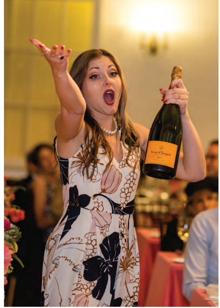
The live auction was a smashing success.