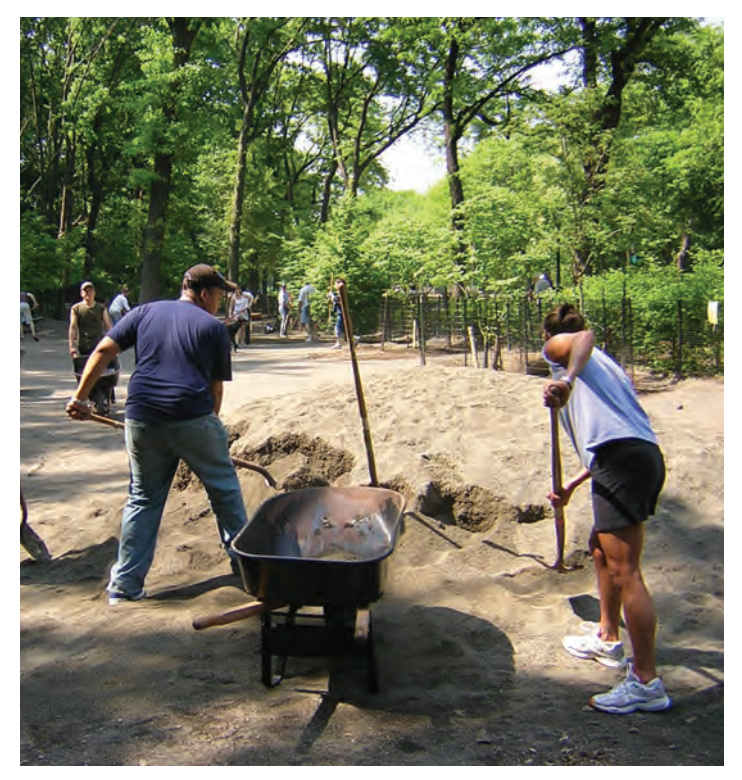
Volunteers help to periodically refresh the surface of the dog runs.