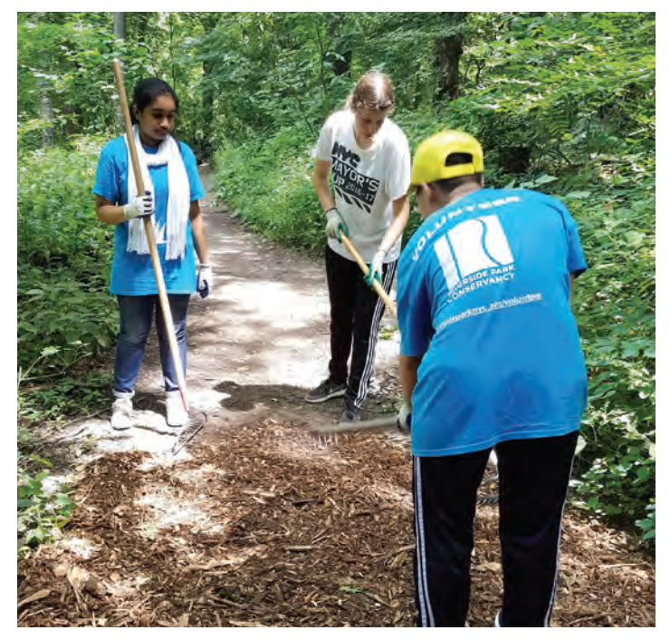
Teen Corps members assist with woodland path maintenance.

In 2018, our 10 Teen Corps members worked every Tuesday and Thursday in Riverside Park's Bird Sanctuary. They were an integral part of the progress in this area, assisting with clearing trails, invasive vine removal, and maintaining the new plantings. If you are interested in joining the Teen Corps, email us at grassroots@riversideparknyc.org.