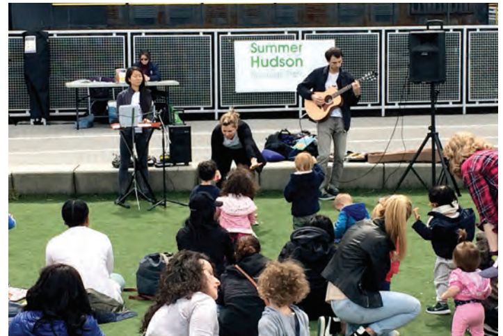
Families enjoy musical storytime at the Locomotive Lawn Live series.