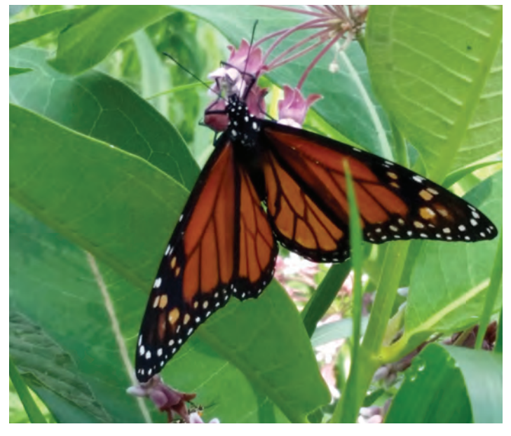
Milkweed is one of the Monarch butterfly's favorite plants.