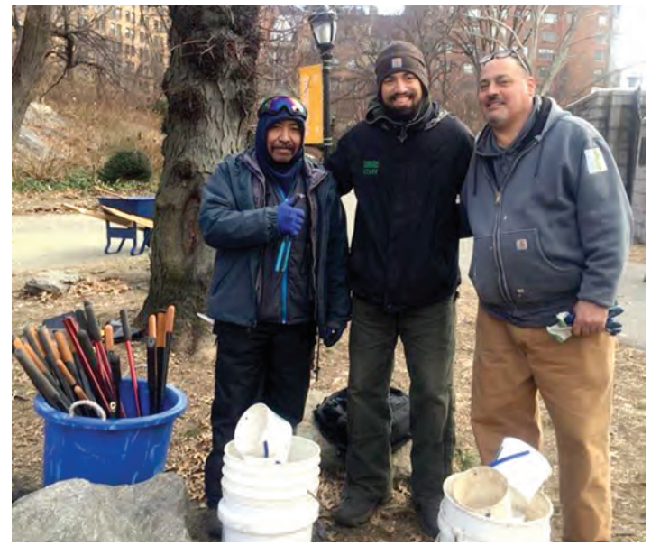
Conservancy field staff prepare for the annual MulchFest community volunteer event.