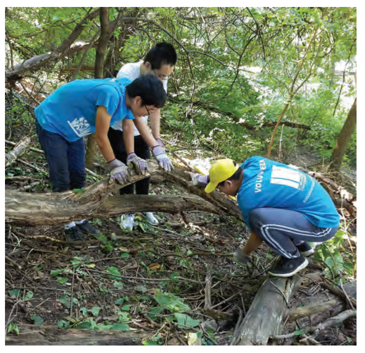
2018 Teen Corps study and care for the Bird Sanctuary's woodland habitat.