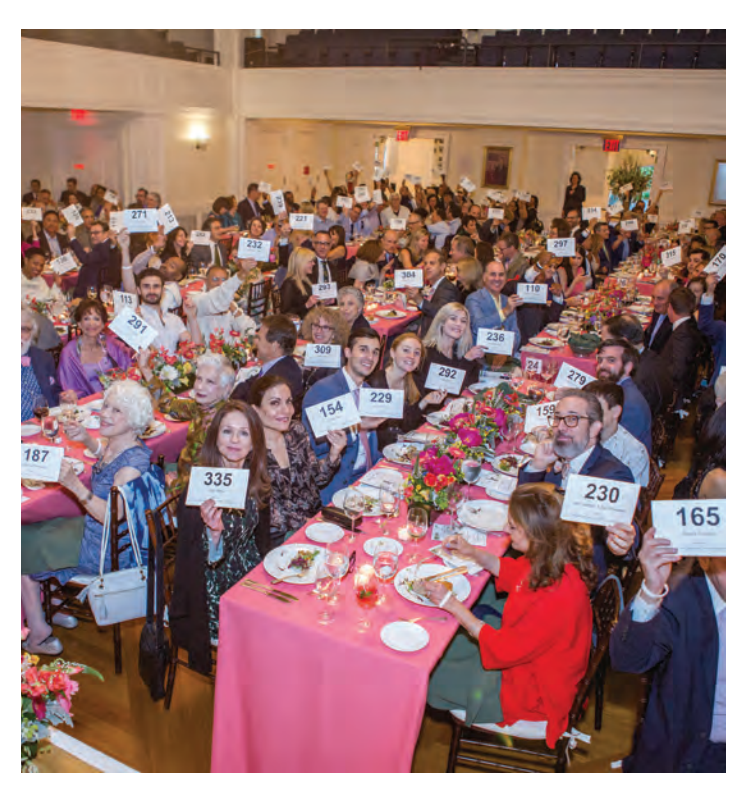
Guests prepared for the paddle-raise auction.