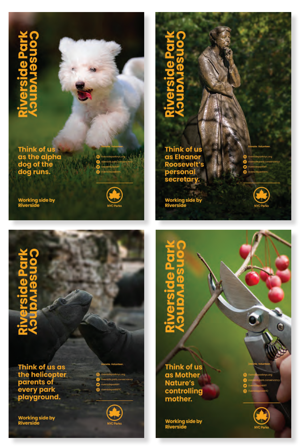
Another set of branded banners are expected in spring 2019.