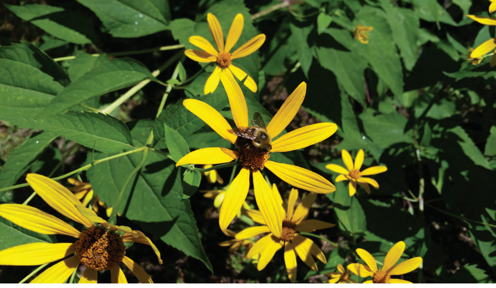
The Meadow has plenty of pollinator visitors throughout the season.