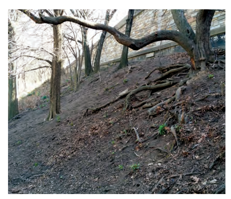
Before: The unmaintained slopes were overgrown with invasive species in some areas, with patches of bare soil in others.