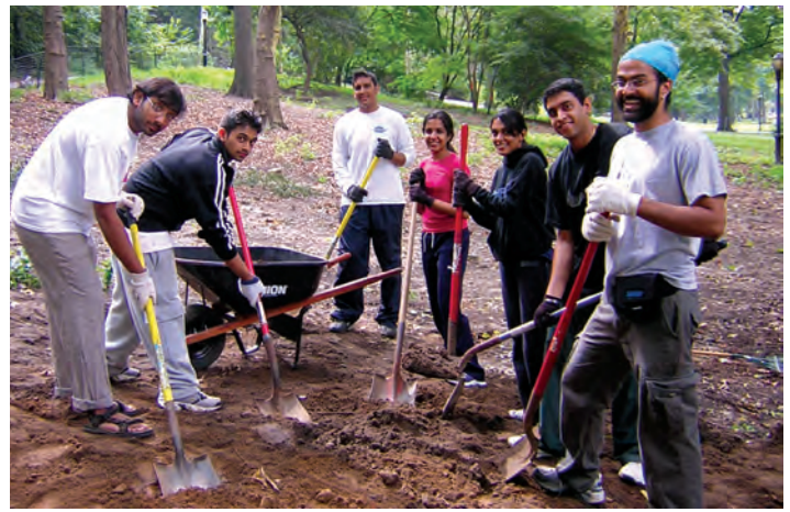
Some volunteer groups come to help out in the Park several times during the season.