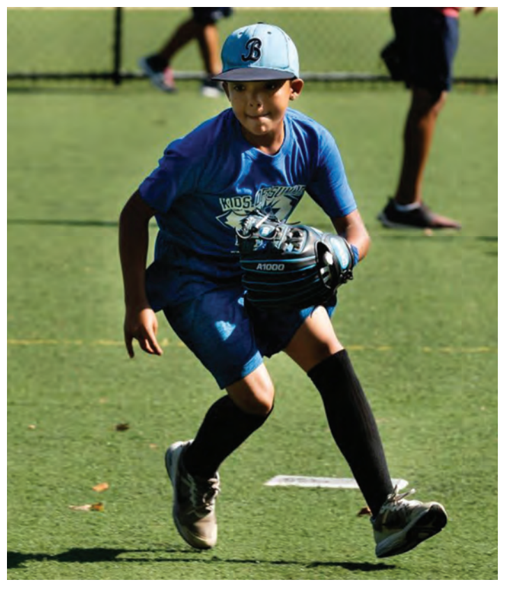
Campers have the option of participating in several sports.