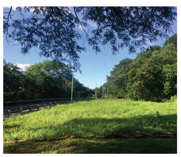
The first phase of planting in the Pollinator Meadow proved successful, and prepared the soil to support a diverse selection of perennials.

In conjunction with our ongoing work to restore and care for Riverside Park's important woodland area, in 2018 we made significant progress in our ongoing work to establish a complementary Pollinator Meadow directly north of the 119th Tennis Courts along the Henry Hudson Parkway.