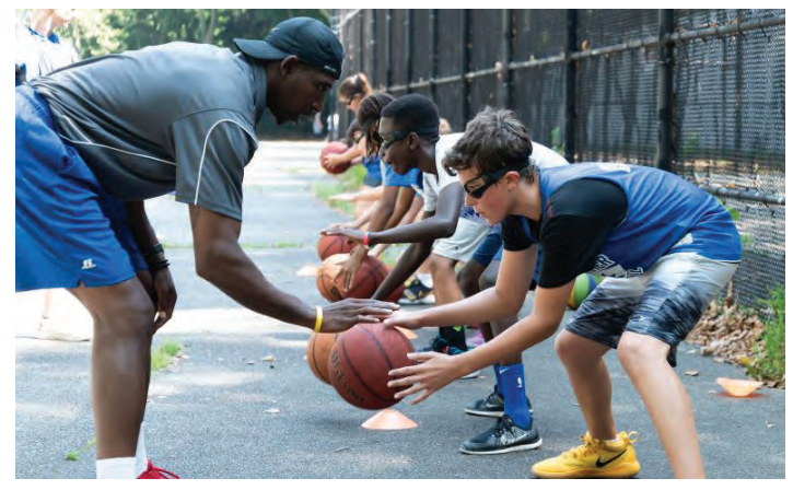
The Basketball Director instructs on dribbling skills.

Riverside Park Conservancy partners with three providers to operate the Camp: Kids of Summer, C. Oliveira Soccer Academy, and Riverside Clay Tennis Association. We offer baseball, basketball, flag football, soccer and tennis. In 2018, 1,027 children attended the Camp at an average rate of 168 campers per day and 2 weeks per camper, which equates to 2,070 total enrollment slots filled throughout the season. Children from all over New York City travel to Riverside Park to attend this popular camp.