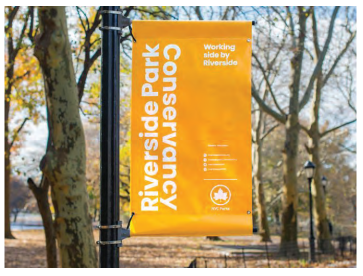
You can find bright new banners throughout the Park.