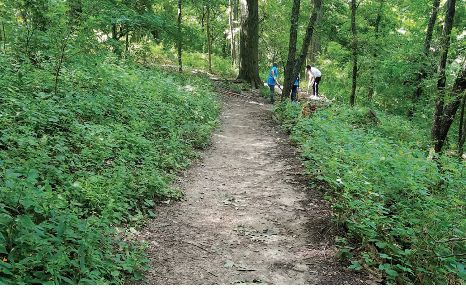
Volunteers assisted Conservancy Natural Areas Steward in woodland restoration and path maintenance.