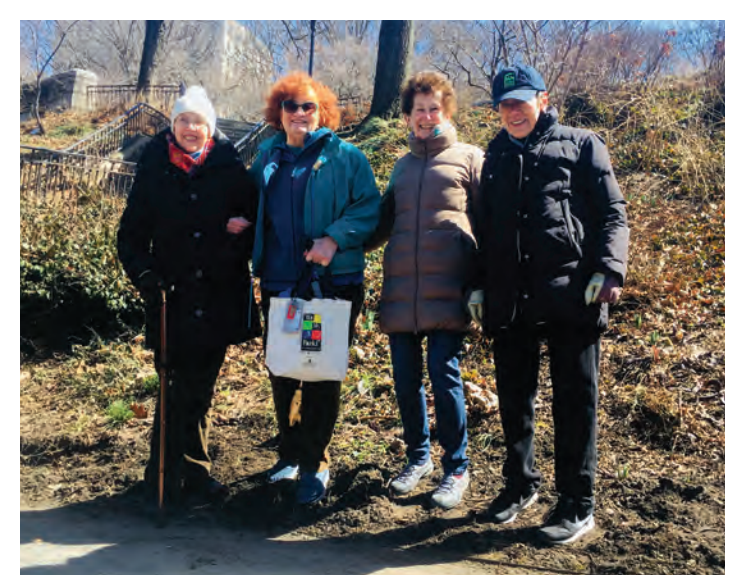
Some of the "Underpass Ladies" have been maintaining the once-neglected slopes near 91st Street since the 1980s.