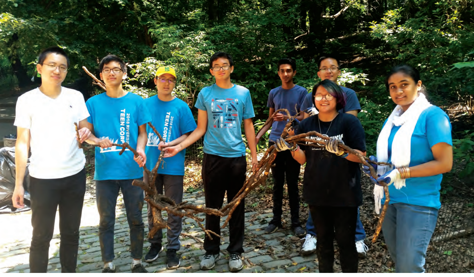
The group proudly displays an enormous Porcelain berry root after removing it from the woodland.