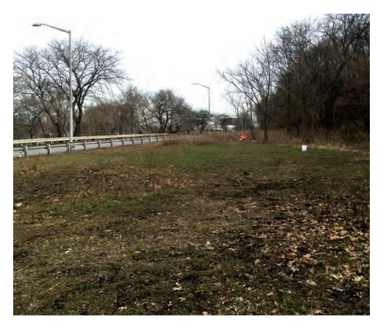
There was great potential to increase the habitat value of this swath of land.