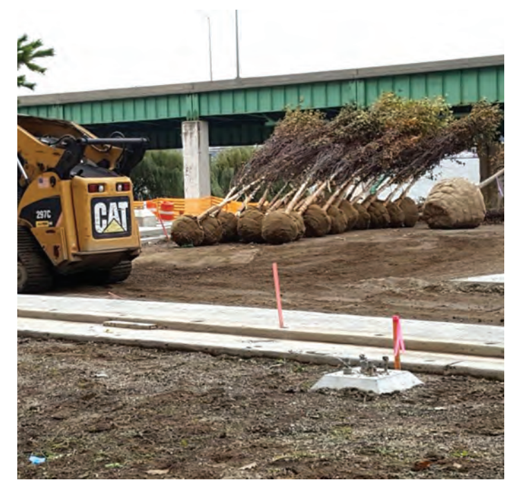
New trees were planted as part of Phase V in the fall of 2018.

In 2018 Riverside Park Conservancy took a more active role in advocating with the New York City Parks Department and the private contractor to ensure that this work gets done as quickly as possible.