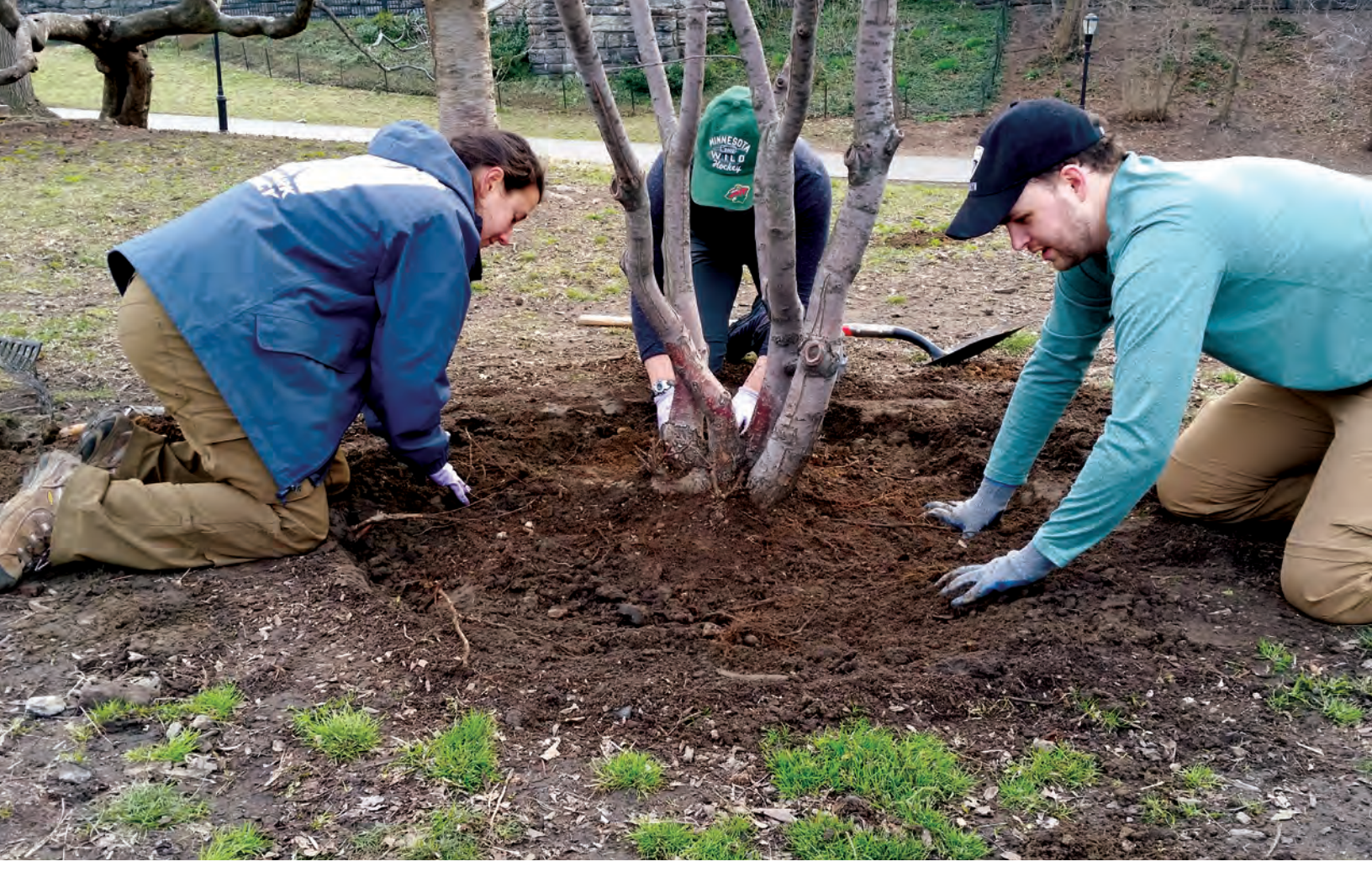
Volunteers work side by side with our team to enhance the Park's horticulture.