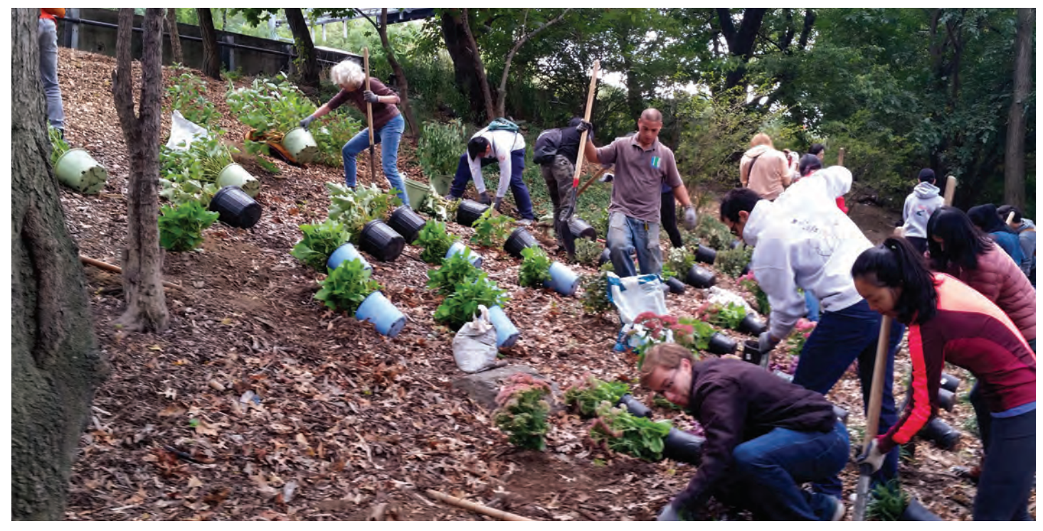
Volunteers help plant garden beds around 148th Street.