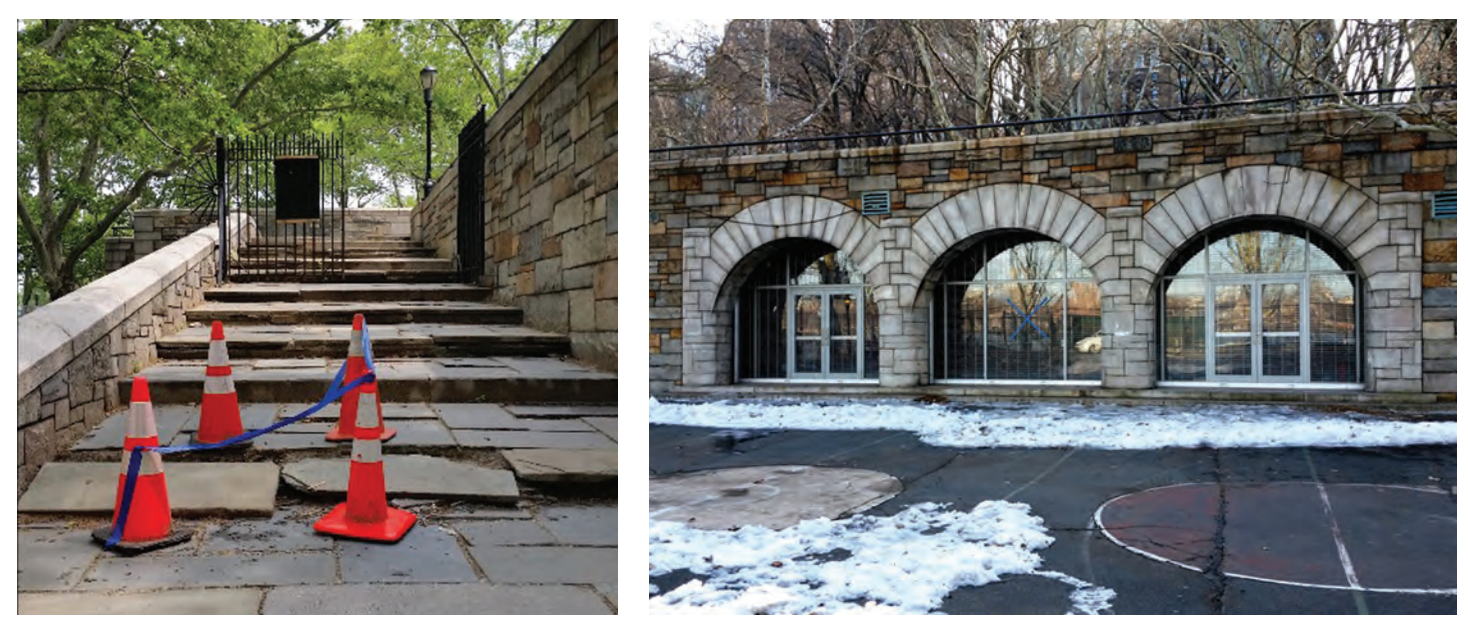
Renewed access to the staircase at 102nd Street will transform the area.