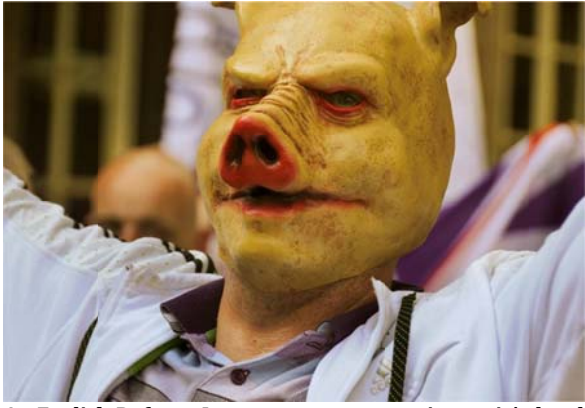
An English Defence League protestor wearing a pig's head mask at the Tower Hamlets demonstration in September 2011.

350 English Defence League members demonstrated in Telford and were countered by approximately 250 opposing demonstrators. Police reported sporadic small-scale skirmishes throughout the 4-hour demonstration.<sup>35</sup>