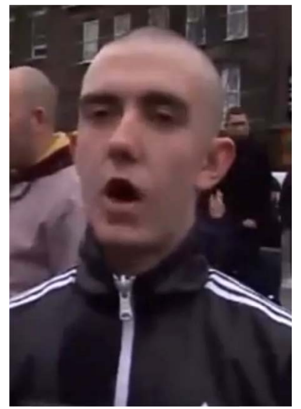
A still taken from the 'Muslamic Rayguns' YouTube film.