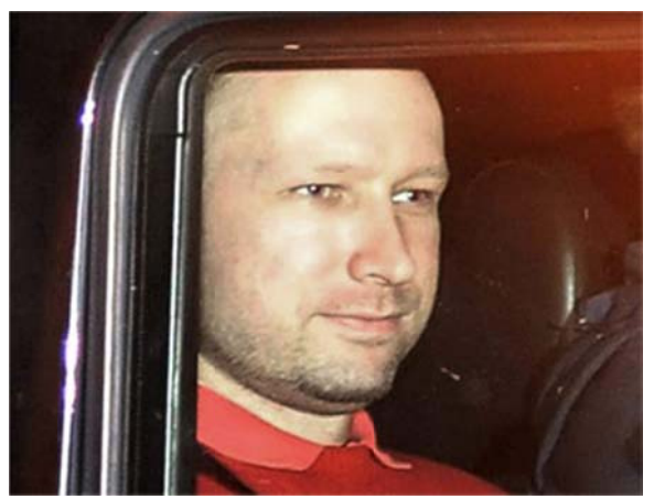
Anders Behring Breivik, who was in contact with the English Defence League in the months prior to his attacks. Breivik was also complementary of the EDL, viewing it as the type of ultra-patriotic 'Youth Movement' he wanted to see more of in the coming years.

Hello. To you all good English men and women, just wanted to say that you're a blessing to all in Europe, in these dark times all of Europe are looking to you in surch of inspiration, courage and even hope that we might turn this evil trend with islamisation all across our continent. Well, just wanted to say keep up the good work it's good to see others that care about their country and heritage. All the best to you all Sigurd.<sup>78</sup>