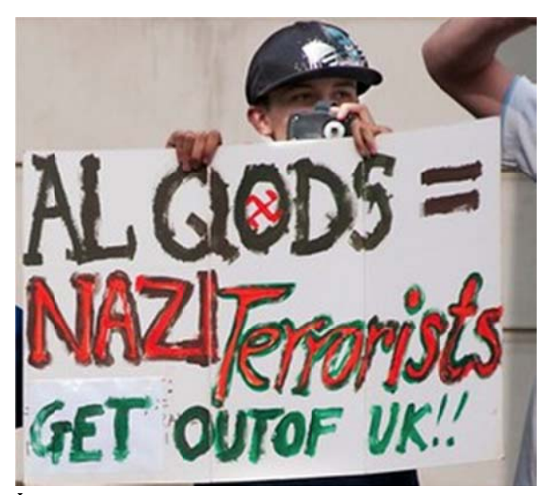
Joint English Defence League, March for England and English Nationalist Alliance protest against an Al-Quds Day march, September 2010.

protests were not violent, and even distanced themselves from the occasional interest of the extreme right-wing movement, the National Front, which tried to associate with these protests.<sup>18</sup> March for England was originally made up of former soldiers and former football hooligans, a somewhat distinct grouping from traditional far right supports. Although not now directly associated with the EDL, March for England still hold events. 2010 demonstrations in Brighton, for example, sought to ban EDL members.<sup>19</sup> Despite not being a formal part of the EDL, March for England has continued to protest along broadly cognate, ultra-patriotic and anti-Muslim lines, a fact that again points to the complexity of a social movement wider than just the EDL. Such smaller organisations, similar in nature to the EDL, also operate - often with links blurred at the grassroots level. Closer examination highlights that the EDL is not a single, clear organisation, but rather a complex patchwork of networks held together by a centralised Social Movement Organisation. To a greater or lesser extent affiliated with the EDL, these wider groupings also gravitate around the core themes of street protests, anti-Muslim sentiment, and populist ultra-patriotism.