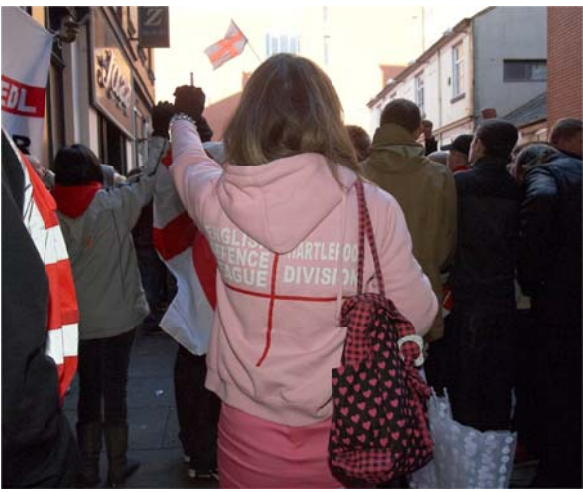
Supporters at an English Defence League march in Preston, November 2010.

A large demonstration by over 1,000 English Defence League supporters was held in Preston. Once again, around 150 UAF supporters opposed the EDL. Some minor scuffles occur, but generally peace was maintained throughout the day.