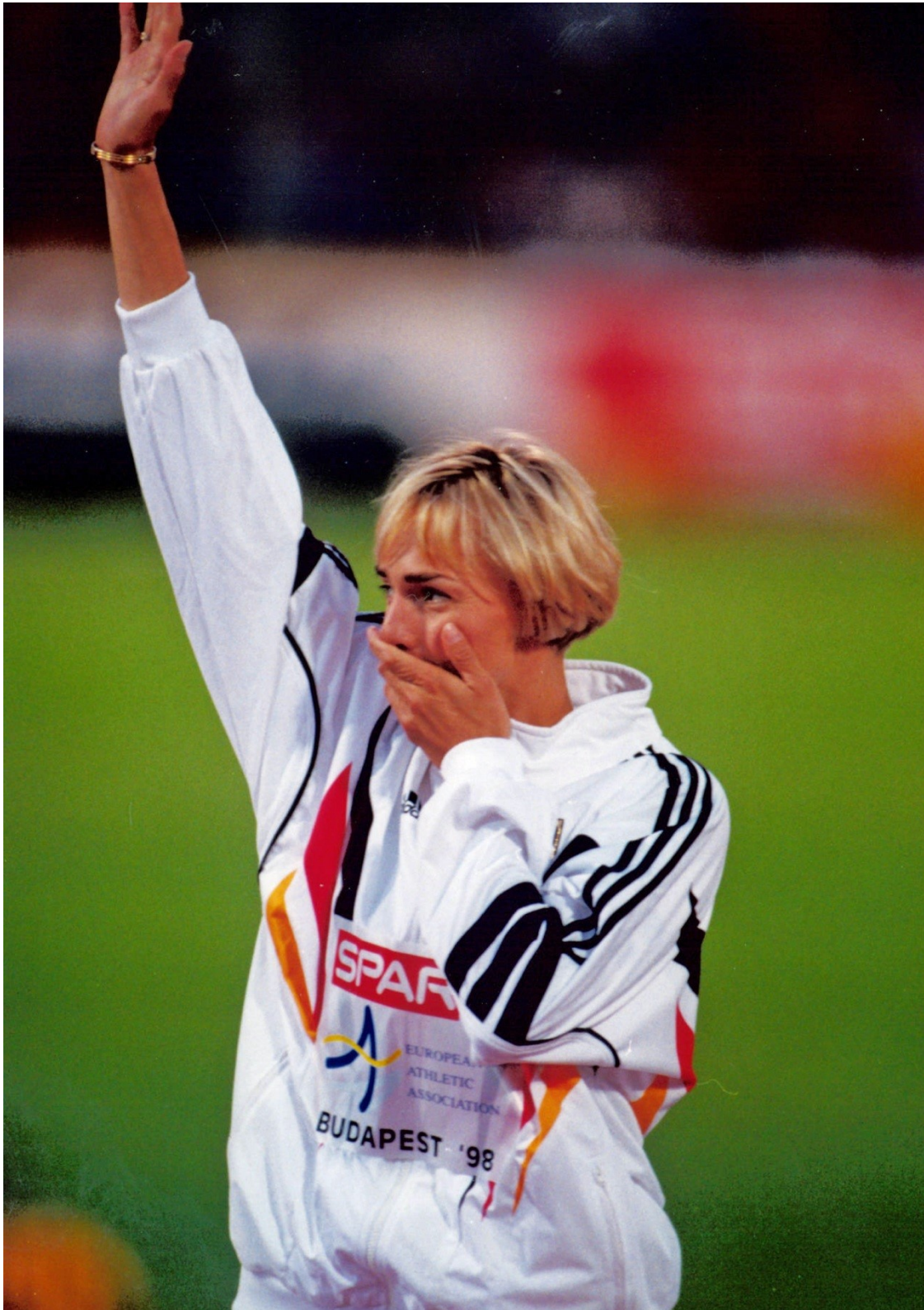
Heike Drechsler (GER) – Five European Athletics Championships gold medals.