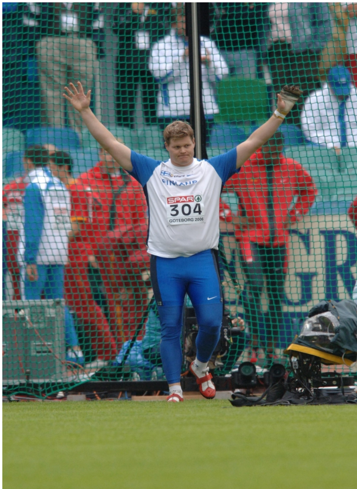
Olli-Pekka Karjalainen (FIN) – Crowned Gothenburg 2006 hammer gold medallist in 2014, almost eight years after the competition.