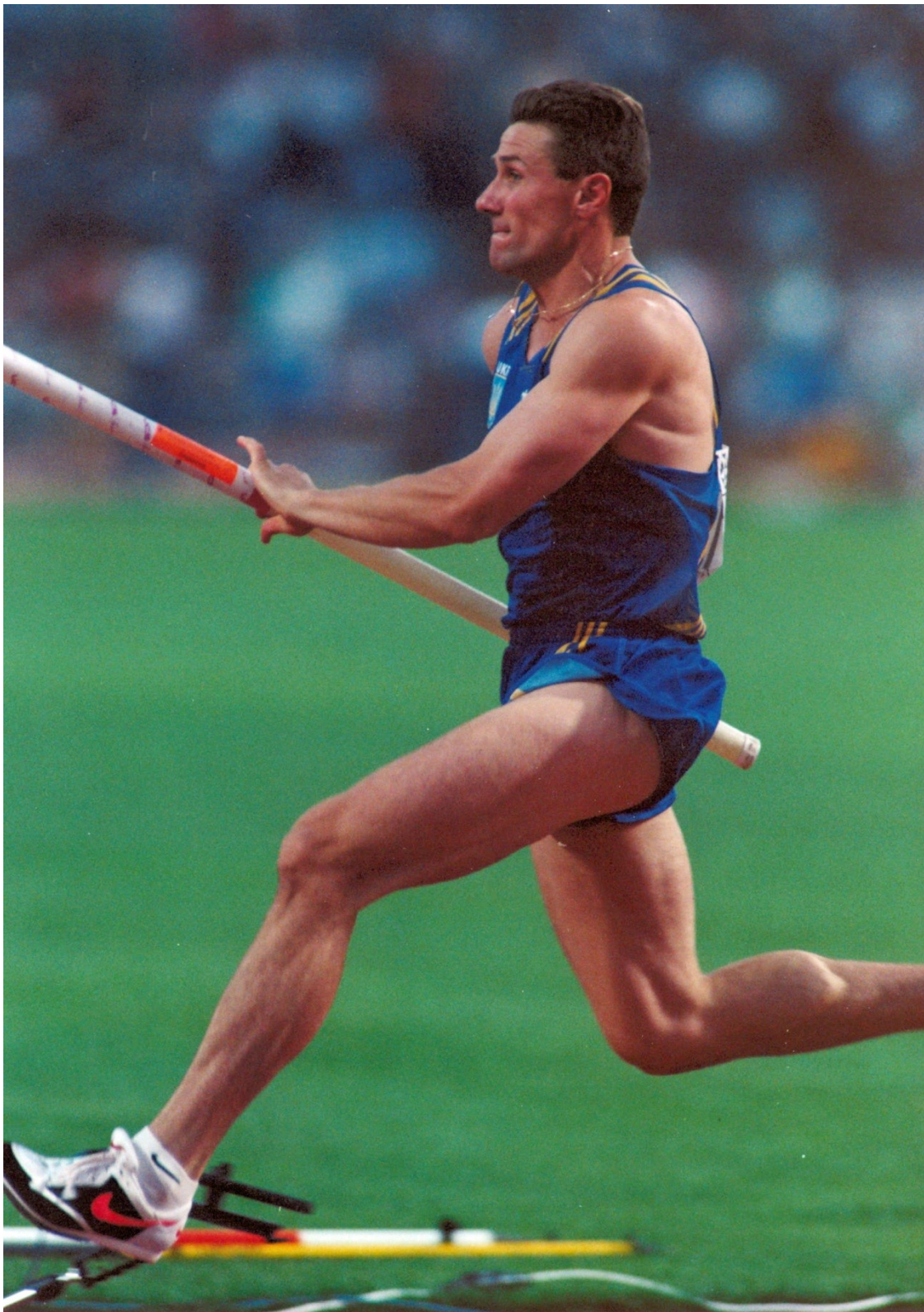
Sergey Bubka (UKR) – Pole vault gold medallist in Stuttgart 1986.