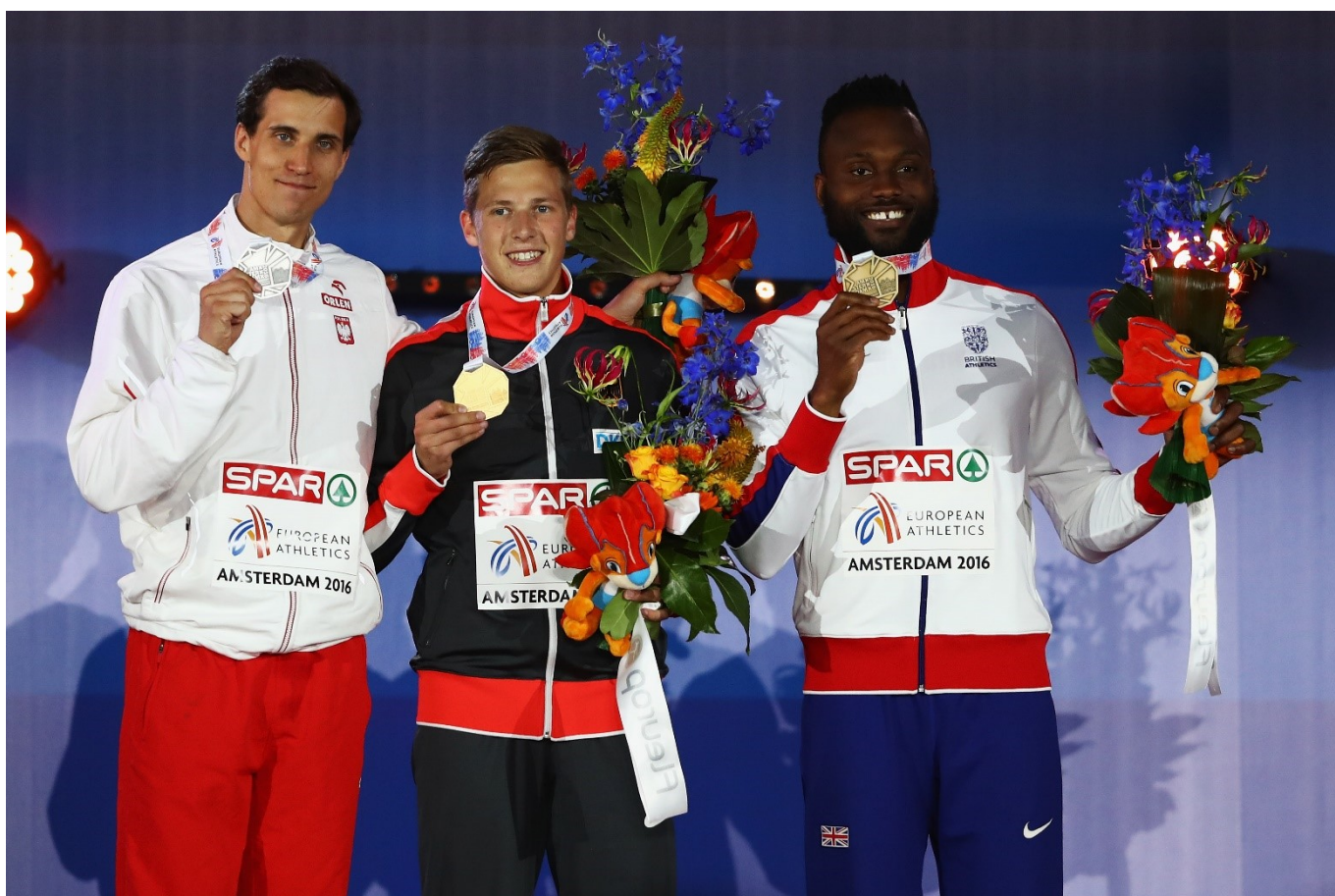
Triple jump medallists in Amsterdam 2016 European Athletics Championships