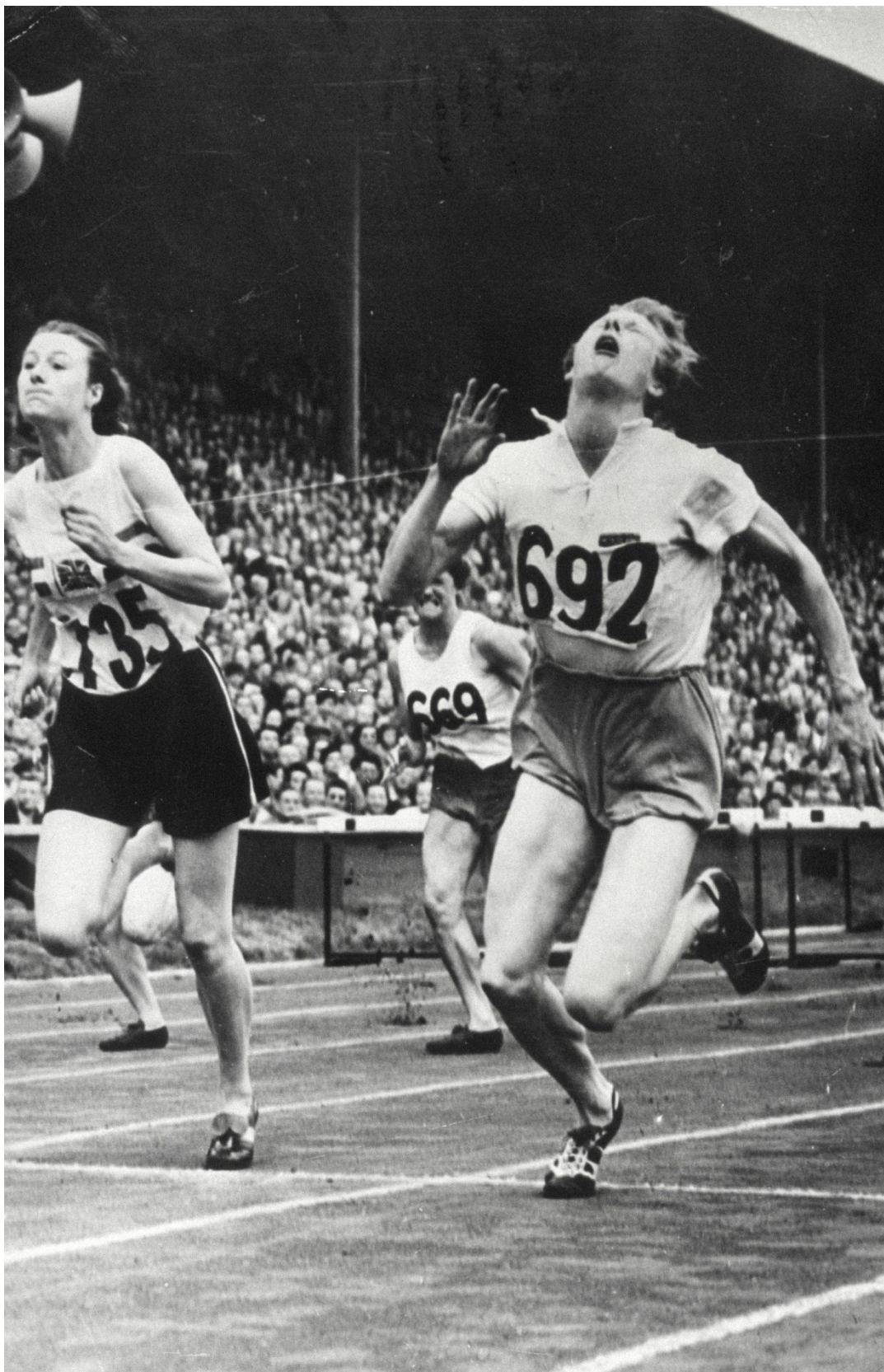
Fanny Blankers-Koen (NED) – Four medals at 1950 European Athletics Championships.