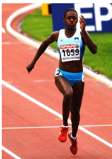
Merlene Ottey (SLO) – The oldest competitor at the European Athletics Championships.