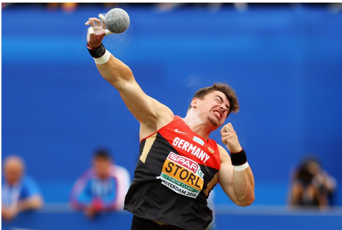
David Storl (GER) – Shot put champion from last three European Athletics Championships.