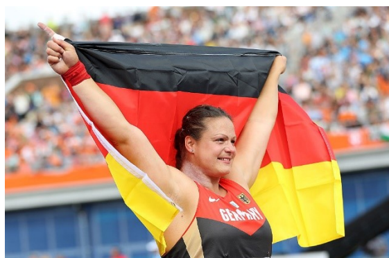
Christina Schwanitz (GER) has won two Gold medals in European Athletics Championships.