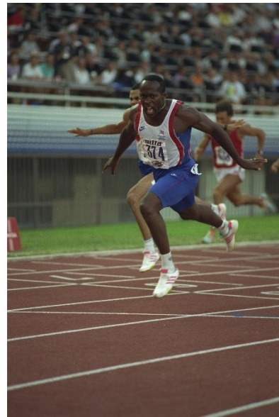
Four medals at one European Athletics Championships, Irena Szewinska (POL) – 1966 and John Regis (GBR) – 1990.