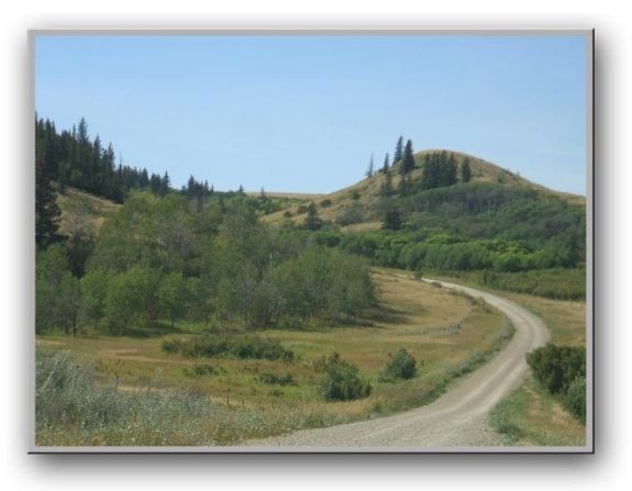
Leading you to.....