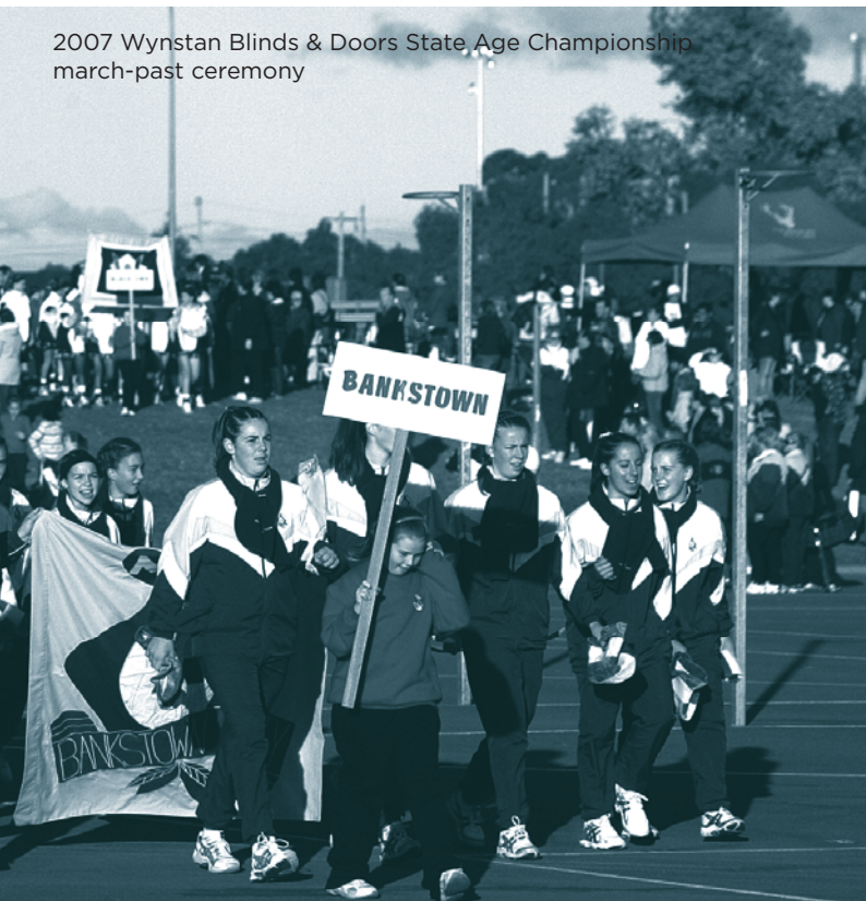
2007 Wynstan Blinds & Doors State Age Championship march-past ceremony