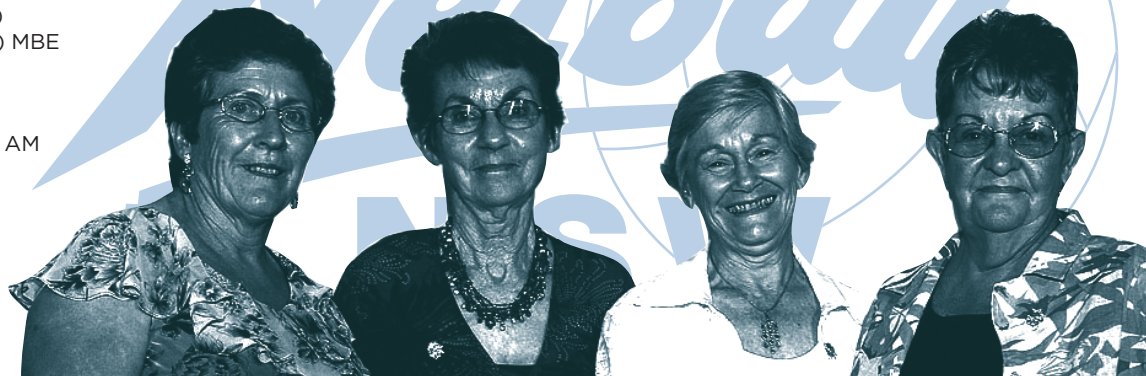
Winners of the Anne Clark Service Award 2007