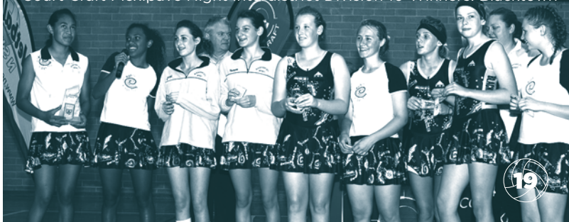
Court Craft Plexipave Night Interdistrict Division 10 Winners: Blacktown

1 Blacktown City 2 Fairfield City 3 Ku-ring-gai 4 Campbelltown 5 Illawarra 6 Penrith