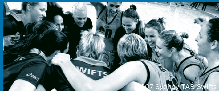
2007 Sydney TAB Swifts

Winning back-to-back Commonwealth Bank Trophy premierships had been a dream of the Sydney TAB Swifts since season 2002.