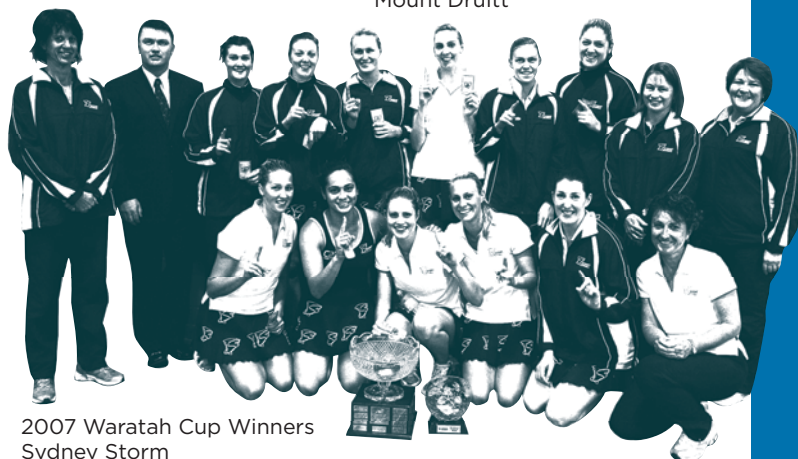
2007 Waratah Cup Winners Sydney Storm

Manly-Warringah Fairfield City/Sydney Uni Liverpool City Charlestown Camden Gosford Baulkham Hills Hunter United Newcastle St George Mount Druitt