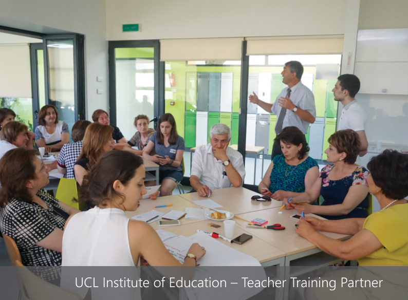
UCL Institute of Education – Teacher Training Partner