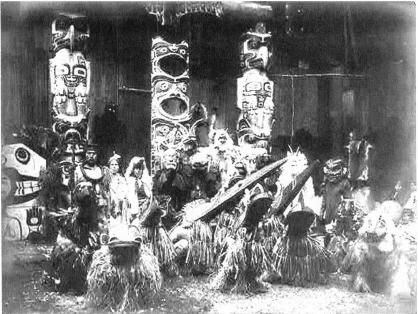
“Masked Dancers—Qagyuhl.” Kwakiutl, Fort Rupert, Vancouver Island, British Columbia, 1913. Plate 358. From: Edward S. Curtis, The North American Indian , Vol. 10 (1915).

and exulted: “Finally, I have found a place where no missionary has worked. . . .”