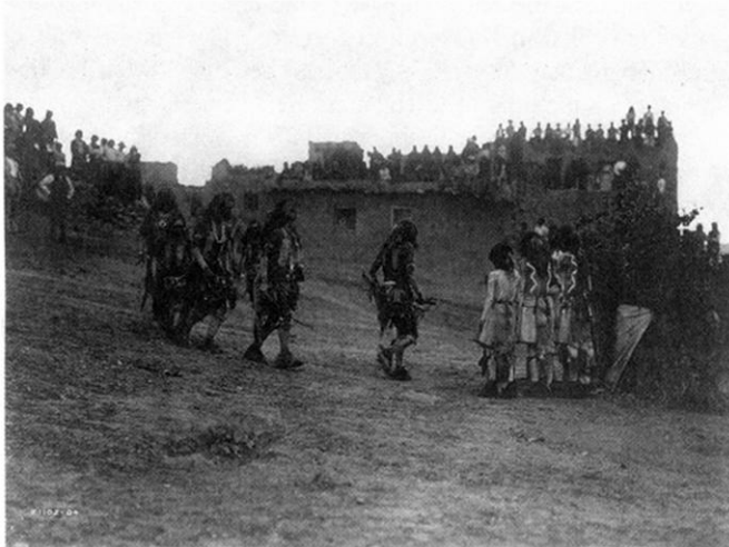
"Snake Dancers among the Plaza; At right stand the Antelopes, in front of the [cottonwood branch] booth containing the snake-jars. The Snakes enter the Plaza, encircle it four times with military tread, and then after a series of songs remarkable for their irresistible movement, they proceed to dance with the reptiles."—Hopi at Oraibi Village, Arizona, 1904 (?). Plate 422. From: Edward S. Curtis, The North American Indian , Vol. 12 (1922), p. 69.