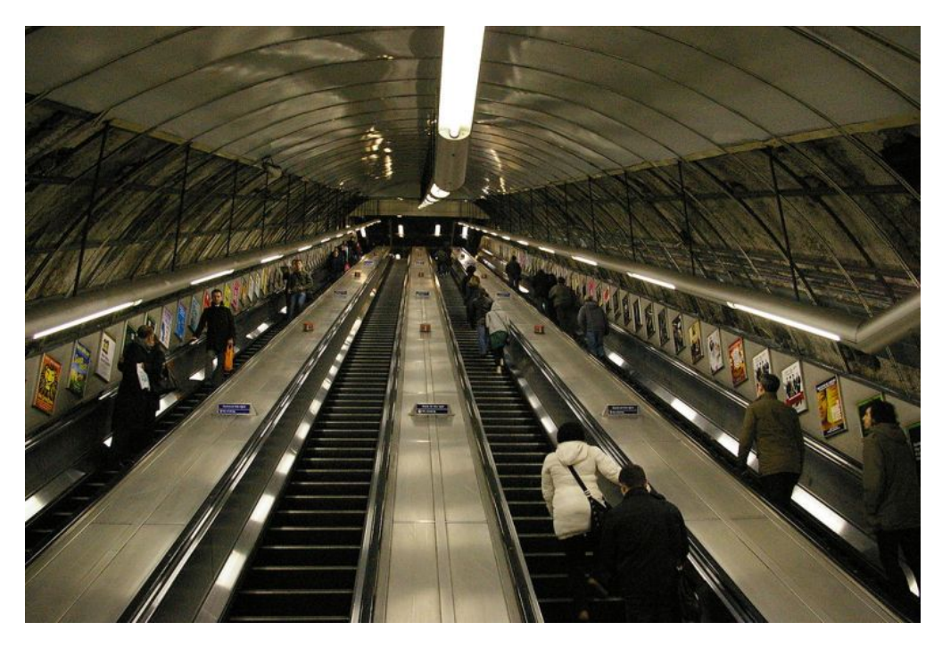
Figure 1. Holborn Tube Station Escalator.

Many people believe that the economy will start going badly wrong when we "run out of oil." The problem we have today is indeed an energy problem, but it is a different energy problem . Let me explain it with an escalator analogy.