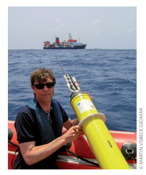
Figure 1 Ocean observations. Martin Visbeck deploying an Argo float in the ocean from the research vessel MV Maria S. Merian . Argo is an international network of more than 3,000 robotic floats that measure the temperature and salinity of the ocean's upper 2,000 m.

Beyond the decadal timescale, on the other hand, the world is developing long-term adaptation strategies to cope with persistent climate change. These include the development of large-scale infrastructure